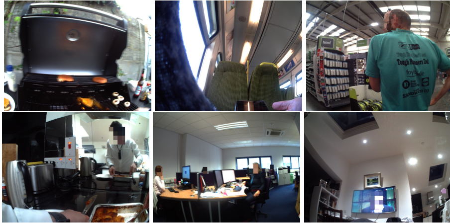
Fig. 1. Examples of Wearable Camera Images from the Dataset

a manual diet log and the inclusion of conventional photos. This makes it the richest personal lifelog dataset ever released. The data consists of: