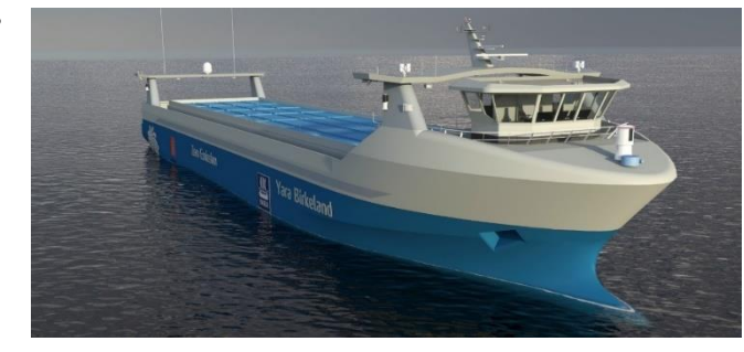
Figure 1 Illustration of Yara Birkeland (Andersen, 2019b)

Yara Birkeland will sail between three ports – Herøya, Brevik, and Larvik. This is a sea area with high density. To transport the products from Yara's factory in Porsgrunn (Herøya) to Brevik and Larvik today, more than a 100 diesel truck journeys are needed (Skredderberget, 2018). The Yara Birkeland project has a potential to reduce 40,000 diesel truck journeys each year, meaning a reduction in NO<sub>X</sub> and CO<sub>2</sub> emission (KM, u.å.c). The result will help meet the UN sustainability goals, in addition to improve road congestion and safety.