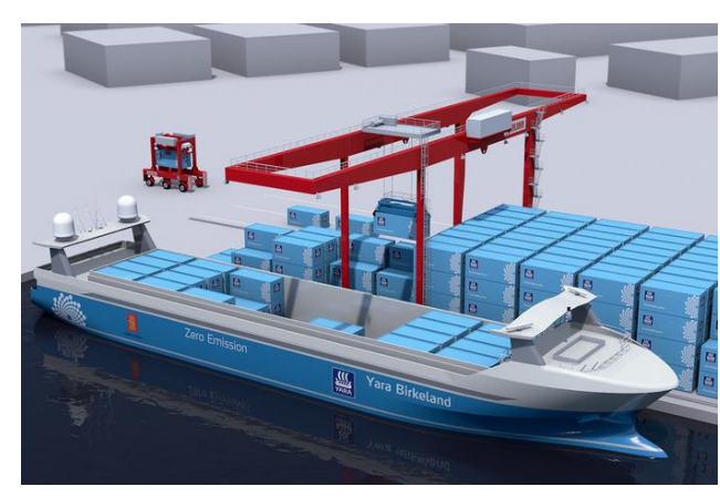
Figure 2 Illustration of Yara Birkeland (Yara, u.å.)

It is not just the voyage itself that will be autonomous. By using electric equipment and cranes, discharging and loading can be done automatically. Kalmar will deliver autonomous software, services, and equipment for a container handling solution for the port at Herøya (Yara, 2018). These elements make the supply chain fully electric and digitalized, and operations can be performed autonomous without emission. Berthing and unberthing will not need human intervention or require special implementations dockside, because Yara Birkeland will be equipped with an automatic mooring system (KM, u.å.c). To accomplish the desired result, the new systems have to use artificial intelligence (AI), machine learning, and digital twin technology (Ship IP LTD, 2018).