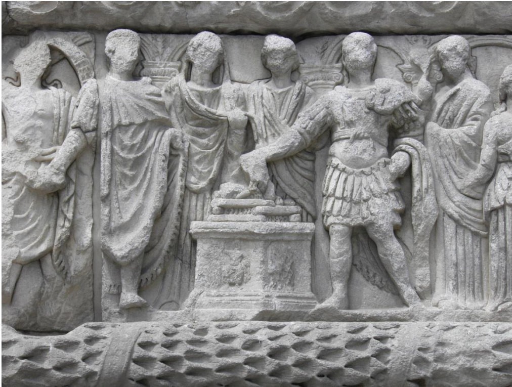
Fig. 5 Arch of Galerius, Thessaloniki. South pillar, Diocletian and Galerius sacrificing.

(p. 11): in other words it was a monument celebrating all four members of the Tetrarchy. This is also generally acknowledged today. Kinch closes the introductory chapter by proposing that the pictorial programme was arranged chronologically, picturing different campaigns on the different faces of the pillars (p. 12). 14 Kinch reckons that several artists must have sculpted the reliefs, one hand was ‘ tâtonnant ’, fumbling, and his work resulted in a ‘ lourd et pénible ’, heavy and hard, style.