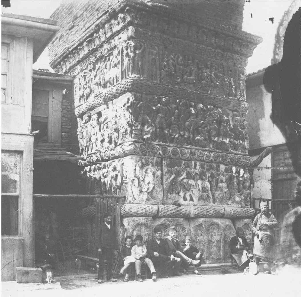
Fig. 2 Arch of Galerius, Thessaloniki. South pillar, around 1900/1910.

studies include a Roman wall painting, a Byzantine church, numismatics, linguistics, Hellenistic tombs, epigraphy and the subject of the present paper, the late antique triumphal arch in Thessaloniki.