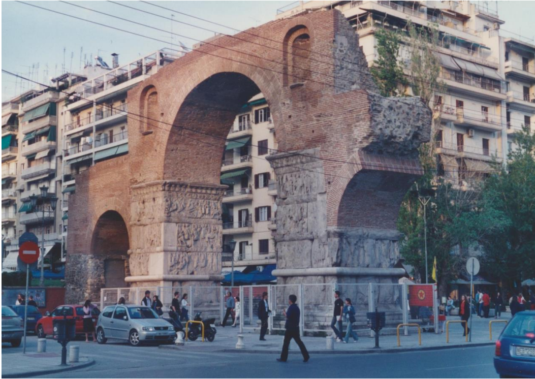
Fig. 1 Arch of Galerius, Thessaloniki. View from the northwest in 2002.