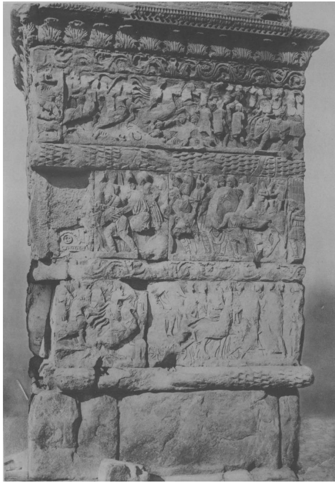
Fig. 6 Arch of Galerius, Thessaloniki. North pillar.

as monuments like the triumphal arches and columns were not intended as artworks meant for aesthetic appreciation, but were large billboards announcing imperial power and might. 17 This (modern) view is in accordance with Kinch's treatment of the monument, not as a work of art but as an important manifestation of imperial power. What particularly strikes the modern reader is the narrow focus on the monument; it is treated as a self-contained entity without considerations of its wider topographical context. In the late nineteenth century, the various remains of Galerius's palace had not yet been located, let alone excavated. 18 Still, one monument, the Rotunda of St