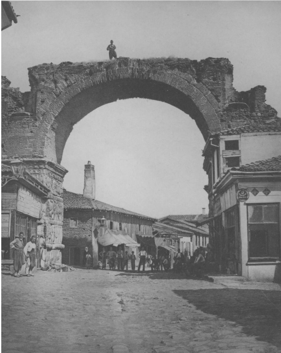
Fig. 3 Arch of Galerius, Thessaloniki. View from the northwest, shortly before 1890.

graphy was pagan, not Christian. The arch was certainly erected before the reign of Theodosius, Kinch reasons. Some early visitors had believed the arch to have been erected in honour of an Antonine emperor, perhaps due to confusion with another, no-longer-extant arch. 11 Other early visitors had proposed that it was an Arch of Constantine, celebrating his victory over Licinius or the Sarmatians. 12 However, as Kinch notes (p. 9), the emperor's adversaries look decidedly Oriental (Persian); furthermore,