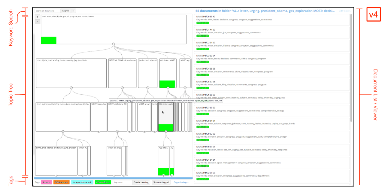
Figure 1. An example of Overview's document viewer interface (Brehmer et al. 2014)

A good interface for viewing the overarching structure (if one is discovered) of a given dataset is a very useful feature that Overview offers. On the design rationale of Overview, among other things, Brehmer et al. outline the reasoning behind presenting the document corpus at hand as a tree, as shown in Figure 1. By representing clusters of documents as nodes in a tree, where the width of the node represents the number of documents it contains, as wells as allowing said nodes to be tagged and labelled with user-generated tags, Overview provides an example of a visualization method for large sets of annotated documents that would-be developers of similar systems could learn from.