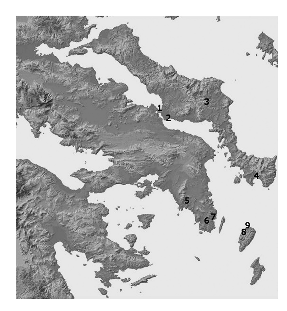
Figure 1. Geographical location of ceramic assemblages used as case-studies: