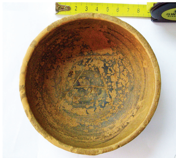
Figure 3: Black-glazed handleless bowl inv. no. MK 1915 with ΑΠ -Αο(ollo)- graffito, from Plakari (Archaeological Museum of Karystos).