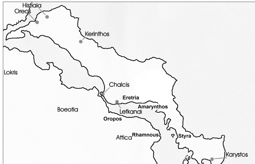
Figure 1: Map of Euboea and east Attica, with sites mentioned in text.