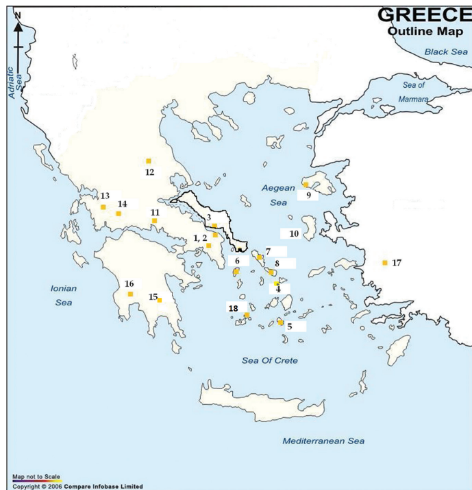
Figure 7: Distribution map of Karystian proxy network in the Greek mainland, the Aegean region and Asia Minor. 1: Athens, 2: Oropos, 3: Eretria, 4: Delos, 5: Ios, 6: Kea, 7: Andros, 8: Tenos, 9: Lesvos, 10: Chios, 11: Delphi, 12: Larissa or Krannon, 13: Stratos, 14: Thermos, 15: Geronthrai, 16: Messene, 17: Alabanda, 18: Kimolos.