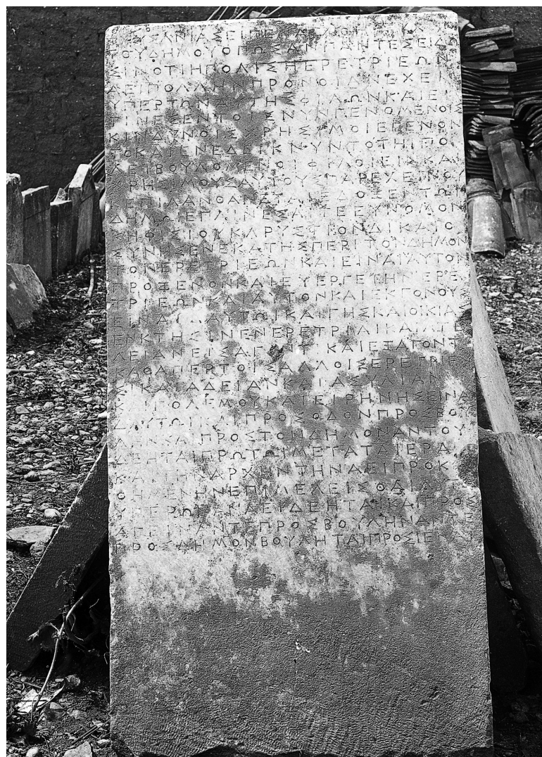
Figure 8: Eretrian stele with decree in honour of the Karystian Eunomos, photographed when found.