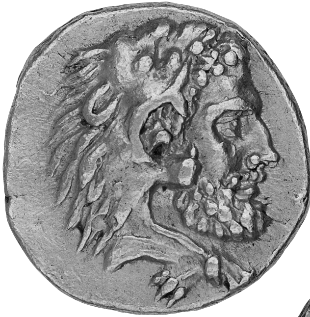
Figure 9 a, b: Gold Karystian drachma (obverse, reverse). Numismatic Museum, Athens.