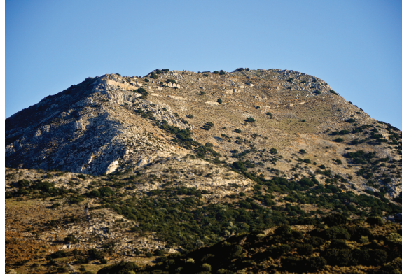
Figure 1. Overview of Kastro Apalirou.