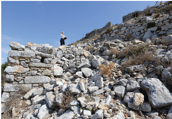
Figure 15. City gate, entrance. M on fig. 2.