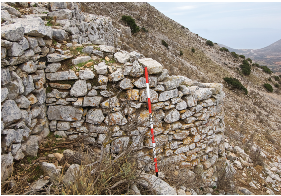
Figure 13. Semicircular tower on the north-western side. K on fig. 2.