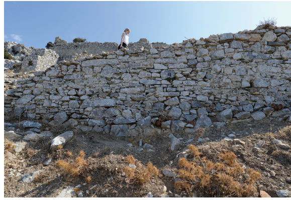
Figure 18. Rebuilt and partly collapsed wall on the western side. P on fig. 2.