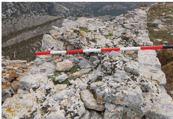
Figure 3. Narrow part of the wall (1.40 m) heavily mortared behind tower on the east side. A on fig. 2.