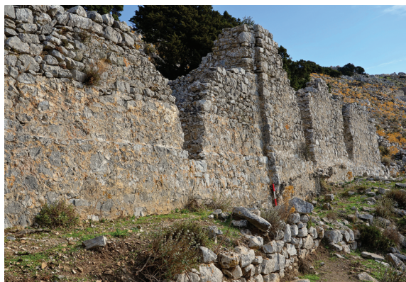
Figure 21. Systematic destruction of cistern. S on fig. 2.