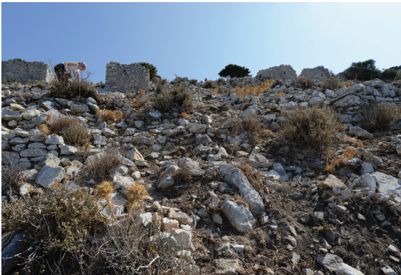
Figure 19. Drystone (and partly collapsed) wall on the west side. Q on fig. 2.