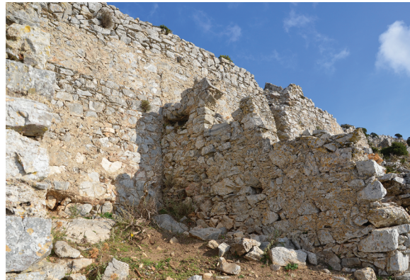
Figure 20. Rebuilt building, later converted into a cistern, with buttresses. R on fig. 2.