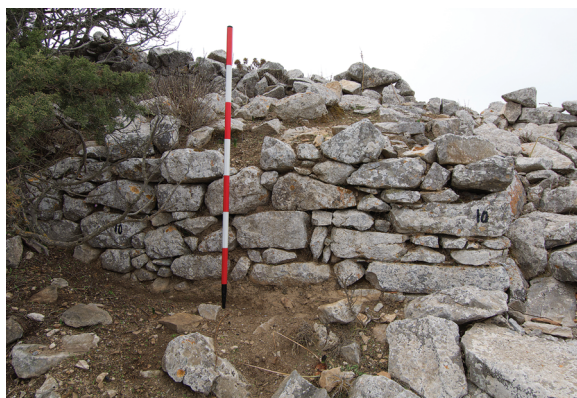
Figure 10. Drystone wall on eastern side. H on fig. 2.