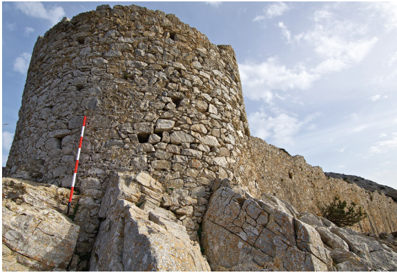
Figure 17. Bastion. O on fig. 2.