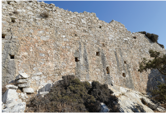
Figure 6. Masonry type 3. D on fig. 2.