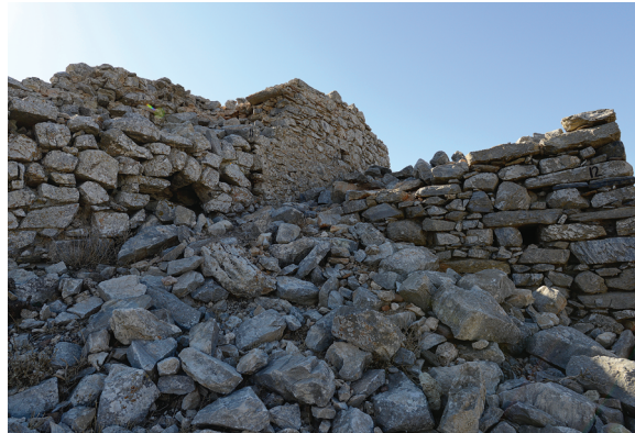
Figure 8. Enforced back wall of tower. F on fig. 2.