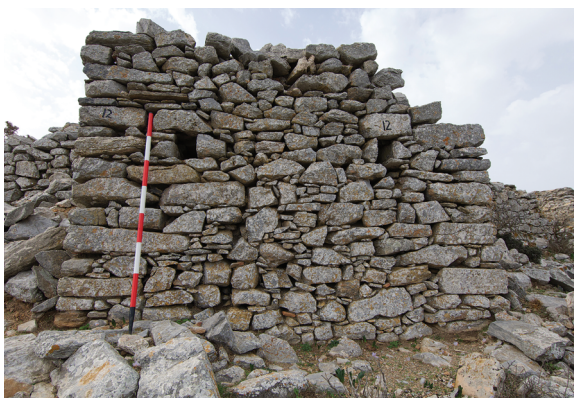
Figure 9. Front of tower on north-eastern side. G on fig. 2.