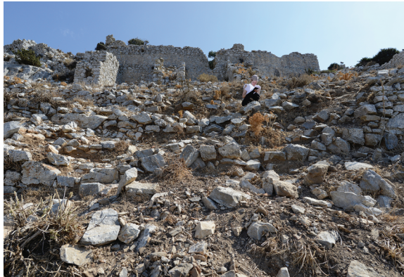
Figure 7. Foundation of (collapsed) tower. E on fig. 2.