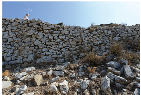
Figure 4. Masonry type 1.B on fig. 2.