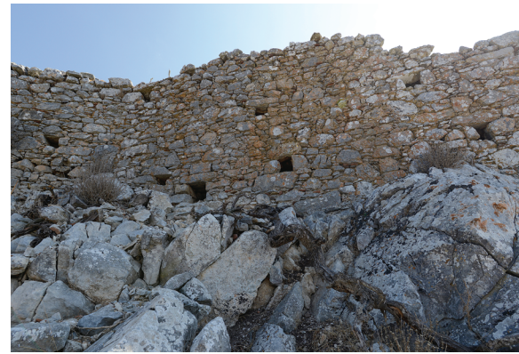
Figure 14. City gate, front to the west. L on fig. 2.