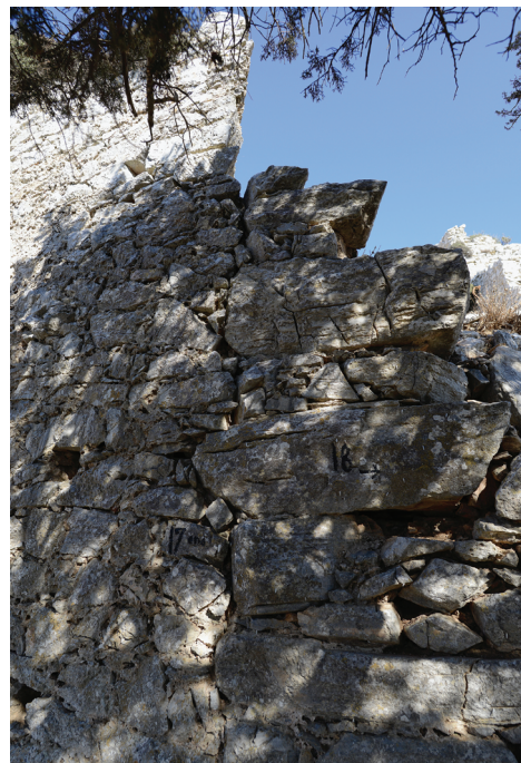
Figure 16. Junction between the bastion and curtain wall running southwards. N on fig. 2.