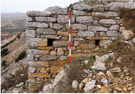
Figure 11. Tower on the western side. I on fig. 2.