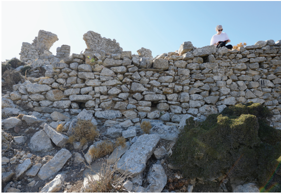
Figure 5. Masonry type 2. C on fig. 2.