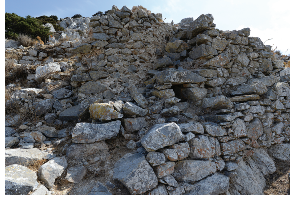
Figure 12. Tower on the south-western edge. J on fig. 2.