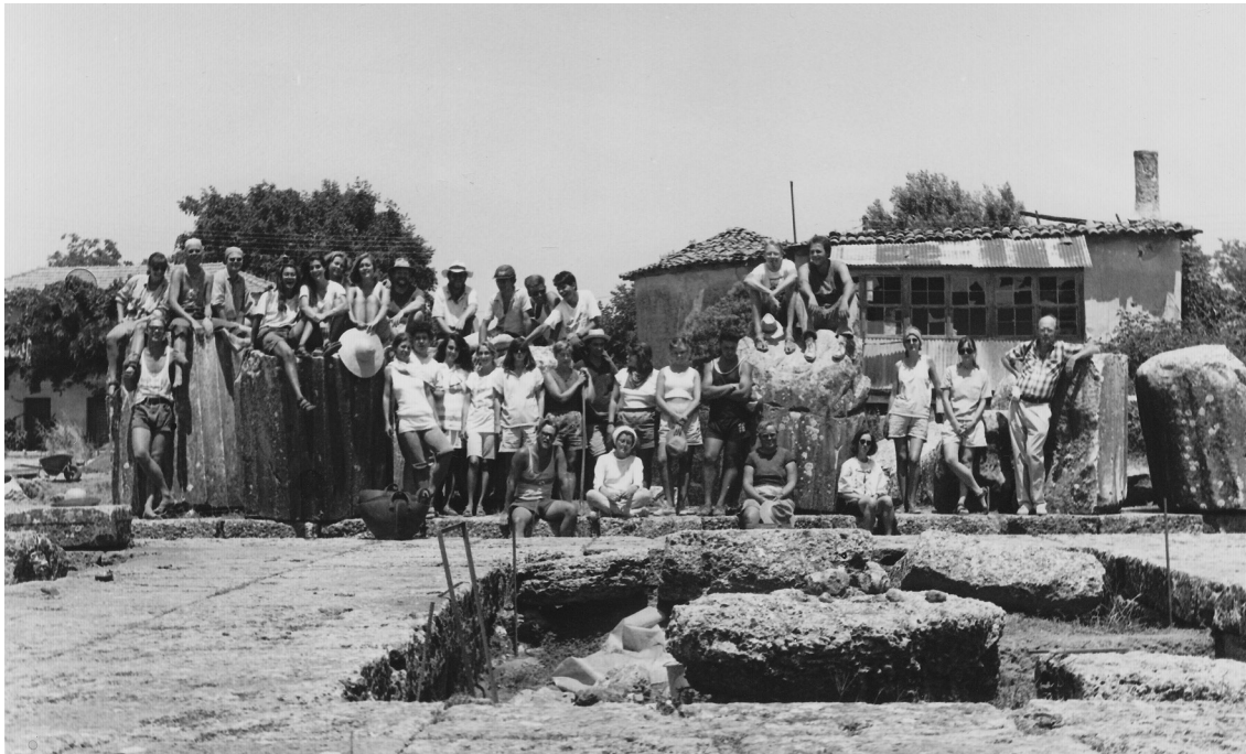
Figure 4. The team working at Tegea in 1993.

inventory and study the more than 800 blocks from the Classical temple which were lying scattered around the site. This material, supplemented with some new blocks that were discovered during the excavation, has provided significant new results for this building which remains one of the best documented examples of 4th-century B.C. monumental architecture. Some of Jari's studies have appeared elsewhere, 7 but his catalogue and some important observations correcting previous publications are included in the second volume of this publication. His results are fundamental for the updated discussion of the temple which is included in the same volume.