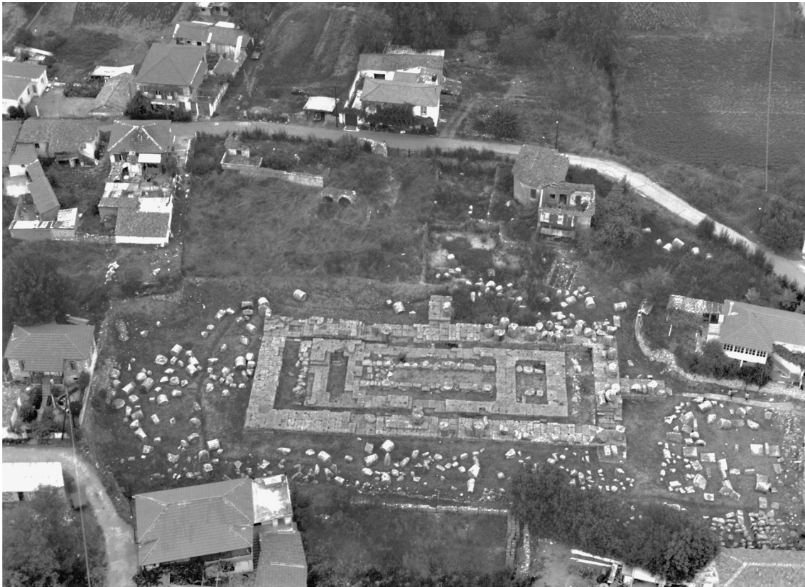
Figure 1. Aerial photograph of the sanctuary of Athena Alea at Tegea, taken after the conclusion of our excavations.

in a definitive way was to arrange an excavation and see if the stratigraphical contexts of these foundations could provide evidence for their date. Although my training as a Classical archaeologist from the University of Oslo had been purely theoretical and involved no experience of practical excavation, I had by then already gathered some such experience as field director of a joint Swedish and Italian mission at the temple site at nearby Pallantion, in 1984. This experience had been pleasant and positive, and encouraged me to consider a similar undertaking at Tegea, at a similar, modest level – just a couple of small soundings in the available area between the Archaic foundations, only what was necessary to get rid of their Byzantine date for good.