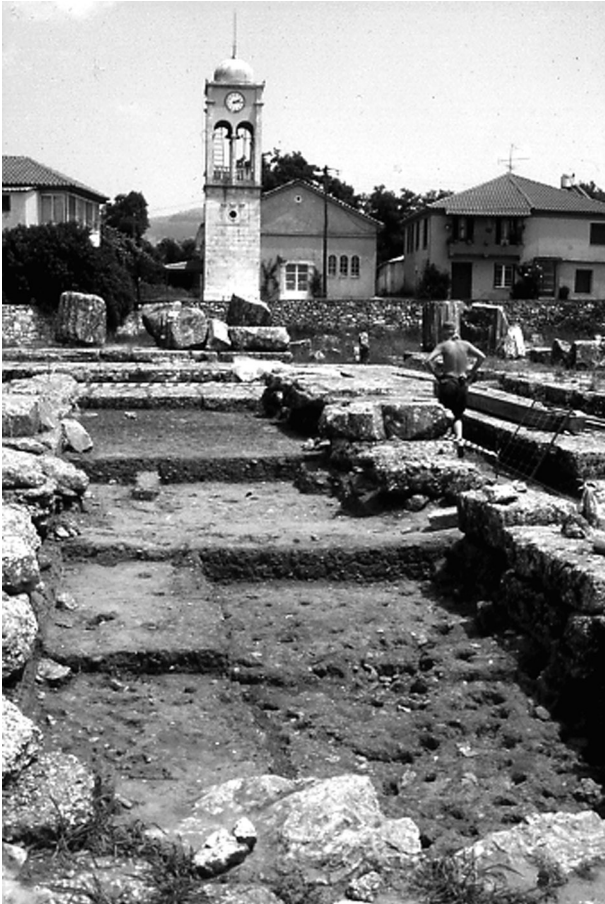
Figure 2. The temple excavation in 1992, with Building 2 below right and remains of Building 1 at a higher level, below left and behind the baulk. Jørgen Solstad to the right.

on how to organize the work the following seasons in as productive a way as possible.