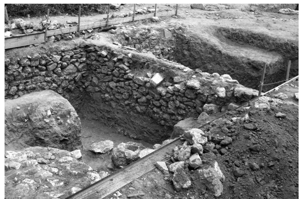
Figure 4. The excavation trench in the squares C-D 9-10, in 1990.