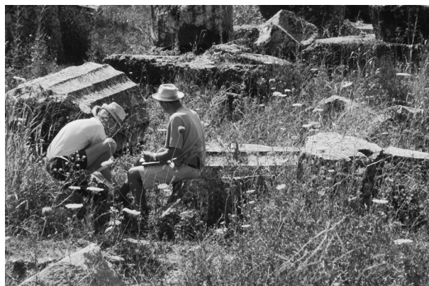
Figure 8. Work at the blocks from the Classical temple, summer 1993: Jari Pakkanen (left) and Øystein Ekroll.