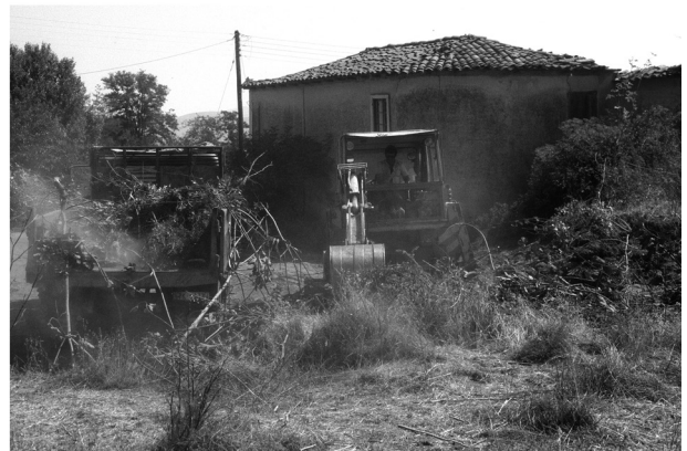
Figure 2. Machine removal of vegetation and dumps in the northern sector, before beginning the excavation in 1990. In the background, the ruined Demopoulos house.