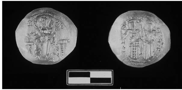
Figure 6. Byzantine gold coin (cat. no. Co 13 ) found in 1991 in the northern sector.