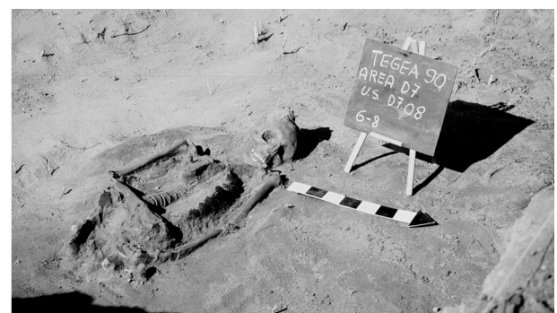
Figure 5. Medieval grave with skeleton (Sk 1) found in the northern sector during the first season, summer 1990.