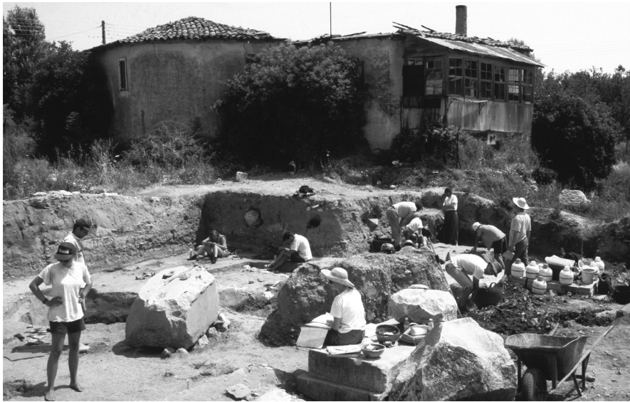
Figure 9. Work in the northern sector during the summer season of 1993.

into a large pit, which also contains marble fragments from the temple. In square C6, two parallel wheel-ruts left by a heavy cart lead to this pit over the surface from the south-west. Perhaps it brought material to fill the pit.