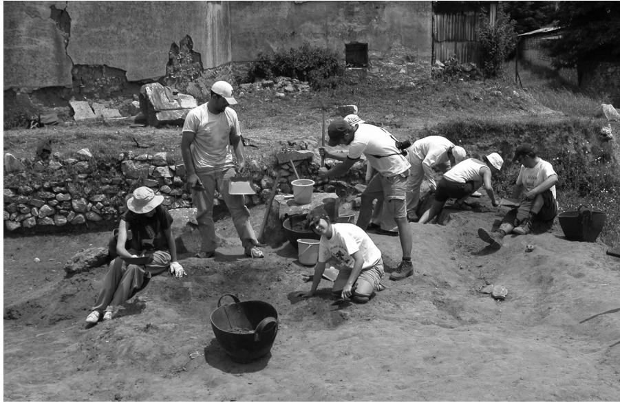
Figure 10. Italian, American and Norwegian students at work in the northern sector in July 2004.

certainly were. 27 However, the area might have been important already at that time since it was so close to that natural spring or well which must have been an essential feature in the sanctuary as far back as it existed, and with which ancient traditions are so strongly connected. 28 Our excavation could only make very modest approaches to those early contexts, by drilling tests and by a very small sounding opened in square D6. The drilling tests went 2 m below the level of the 7th-century debris layer, and produced evidence for human activity at that depth; it is now certain that the layer of river pebbles which was encountered by the French archaeologists and considered by them as the virgin soil, is just one more trace of those flooding episodes created by the nearby river which covered thick cultural layers from earlier periods. 29 The four Early Helladic bronze pins which were recovered by us from secondary contexts ( BrN-P 1–4 ) may give an idea as to how far back in time those layers may conceivably reach. 30