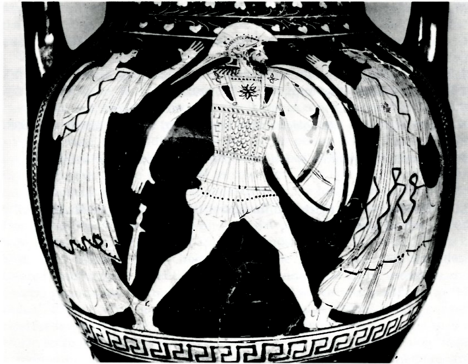
Fig. 8. Menelaos seeing Helen's breast throws away his sword, red figure amphora by the Altamura painter, 470-450 BC, ARV 594,54 (British Museum 263).

Myths certainly belong to the serious business of life.