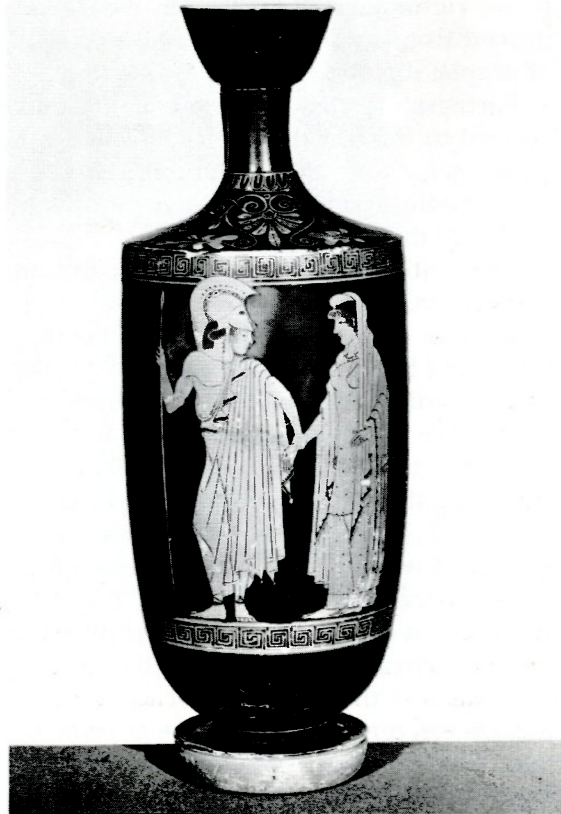
Fig. 2. Menelaos woos Helen, lekythos by the Brygos painter, after 500 BC, ARV 383, 202 (Staatliche Museum Berlin F 2205).

The sophist and Grand Master of rhetoric, Gorgias, composed a speech in defence of Helen. Gorgias' model speech, however, aimed at proving the impossible. Gorgias' line of defence was to deny that Helen consented to the abduction. It was a tour de force demonstrating the surpassing power of rhetoric; Helen had been forced by the spell of speech. It was precisely her willingness to follow Paris that had offended all people and poets and had turned Helen into the prototype of the unfaithful wife. To be sure, the Homeric poems present a rather appealing picture of Helen. Subsequent generations, however, have seized upon the tale and cast their suspicion and disgust upon this specimen of weak and fickle womanhood. Hesiodos, Alkaios, Stesikhoros, Ibykos, all concur in the condemnation, culminating in tragic drama where Helen advertises the destructive power of the female, the source of all evil.