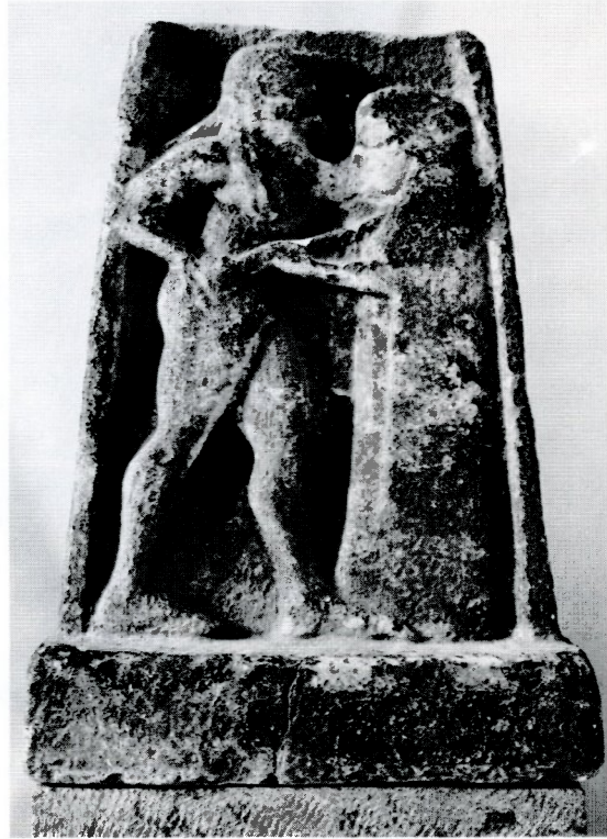
Fig. 4. Menelaos threatens Helen, grave stele from Sparta, 580-570 BC, Sparta Museum no. 1.

Myths operate through their own logic: they may present themselves as history or as geography while in fact they construct the social world-order. On the temple of Zeus at Olympia the depiction of the myth of Pelops and Oinomaos pretended to commemorate an historical event. Pelops was the first victor at Olympia and the prize was Oinomaos' daughter. However, this victory was not just a matter of athletic achievement; by defeating Oinomaos, Pelops put an end to the king's disgusting and barbaric practice of killing his daughter's suitors and attaching their heads to the temple wall. Pelops, in fact, establishes marriage as a crucial element of civilisation.