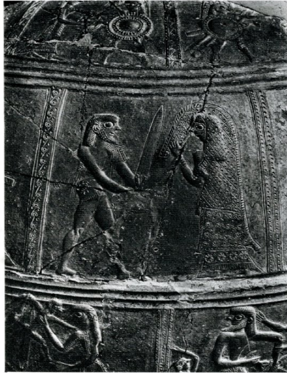
Fig. 3. Menelaos threatens Helen. relief pithos, seventh century, Mykonos Museum.

In his definition of myth Burkert has in mind some schematic patterns of action (Aktionsprogramme). He recognizes e.g. male and female initiation patterns and a crime and punishment pattern. He has, I think, successfully traced some myths that accompanied initiation or new-year rituals. In fact, when we examine the versions of the Helen myth we find that in Ancient Sparta girls' initiation rites were held under the protecting guidance of the goddess Helen and her husband Menelaos.