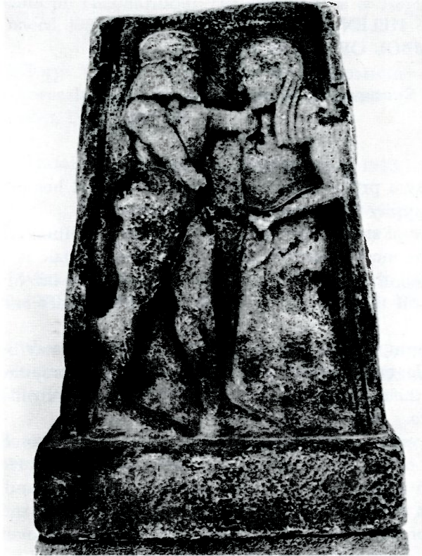
Fig. 1. Menelaos woos Helen, grave stele from Sparta, 580-570 BC. Sparta Museum no. 1.

Were stories like this just creations of fantasy, disconnected from the serious business of life?