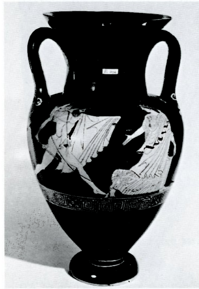
Fig. 7. Menelaos threatens Helen , red figure amphora, Oinokles 470-460 BC, ARV 647, 14 (British Museum 294).

Helen's laments at being falsely accused of infidelity, her despair at the rumour of Menelaos' death, her excessive reactions when threatened by the Egyptian king, all amount to an underlining of the value of marriage. Helen's concern for protecting and professing her chastity underscores the value of female marital fidelity. When husband and wife are reunited, the drama evokes their wedding celebration and when they arrive home, all join in the rejoicing. Thus the drama, by presenting the separation and reunion of husband and wife, Menelaos and Helen, implicitly demonstrated the crucial value of marriage and revived the correct feelings towards the institution. In this way the mythical drama of Helen served a symbolic function.