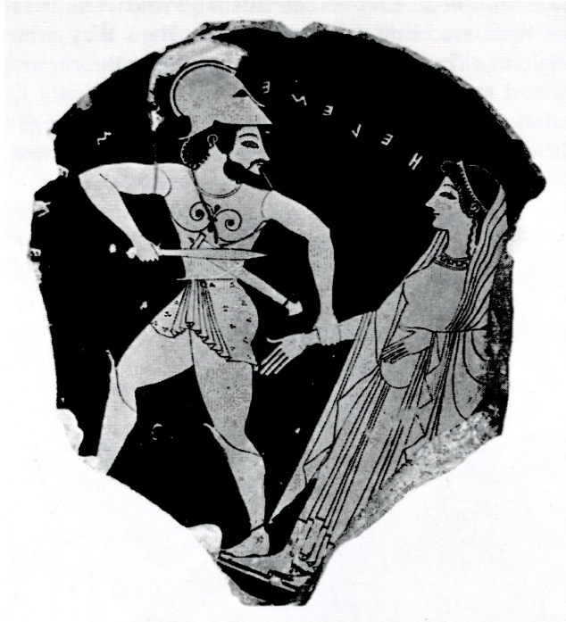
Fig. 6. Menelaos threatens Helen, red figure plate, Oltos 515-500 BC, ARV 67, 137 (Odessa Museum O. 577).

imal constants of the tale, and certainly the Athenian audience recognized this drama as a version of the Helen myth. But does the résumé provide us with its meaning? In short, can we discard the concrete drama and the occasion of its performance?