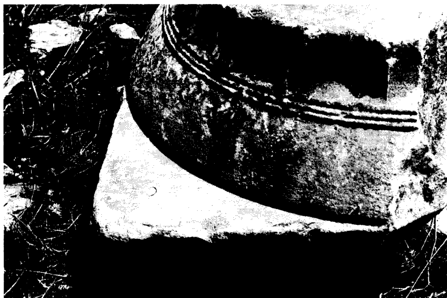
Fig. 2. Lavda, marble capital LM45.