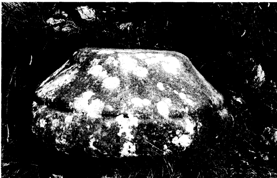
Fig. 3. Lavda, marble capital LM30.