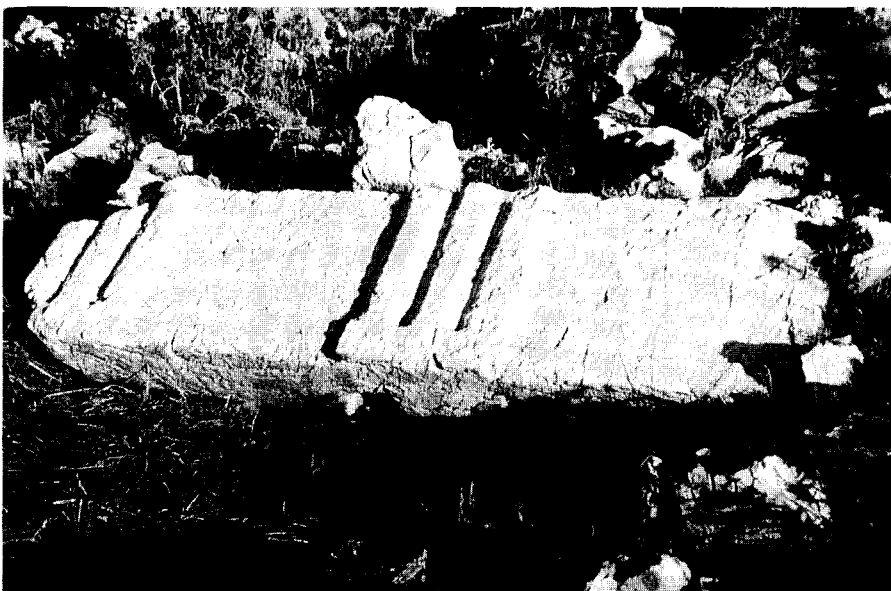
Fig. 4. Lavda, frieze block LB90.