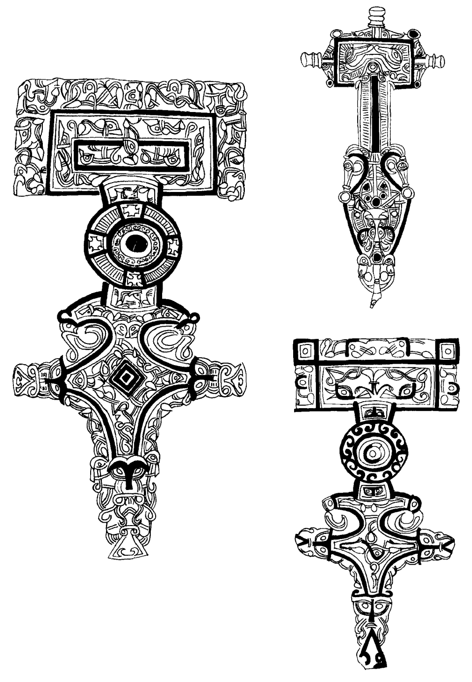
Fig. 2: Relief brooches in Style I. Left: F90, top right: F32, bottom right: F85. See numbers on map in fig. 1. Drawings by Siv Kristoffersen. Scale 3/4.