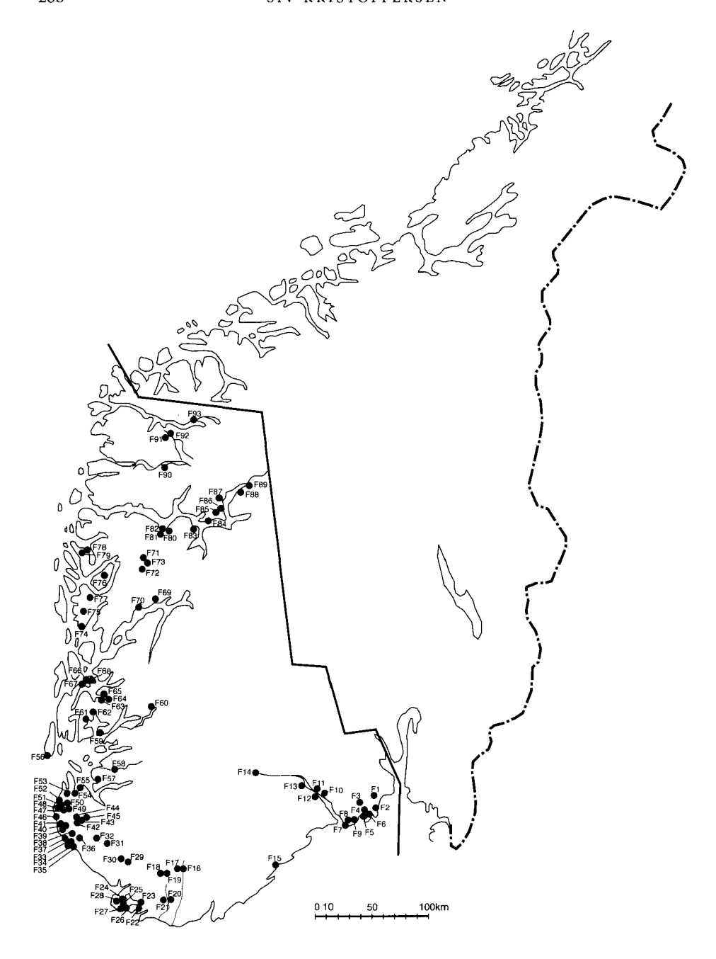
Fig. 1: Distribution of finds with objects decorated in Nydamstyle and Style 1 in southwestern Norway. Drawing by Ellinor Hoff, Bergen Museum.