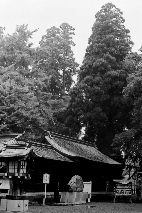
FIGURE 1 Ogatamanoki, Michelia compressa Sarg., at Aso-jingu shrine in Kumamoto prefecture, Japan.

ral environment, they should be protected and conserved as a heritage for citizens.