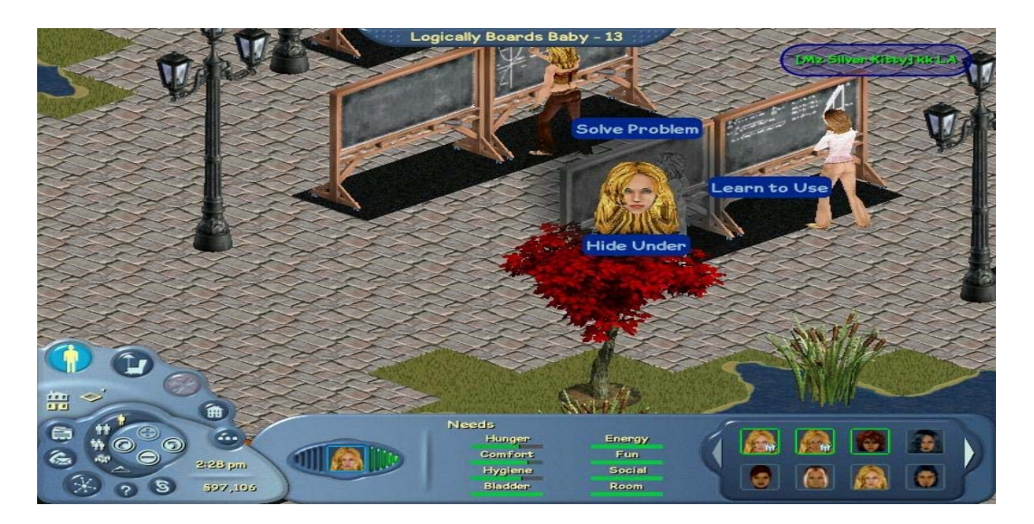
Figure 5: Boarding in The Sims Online