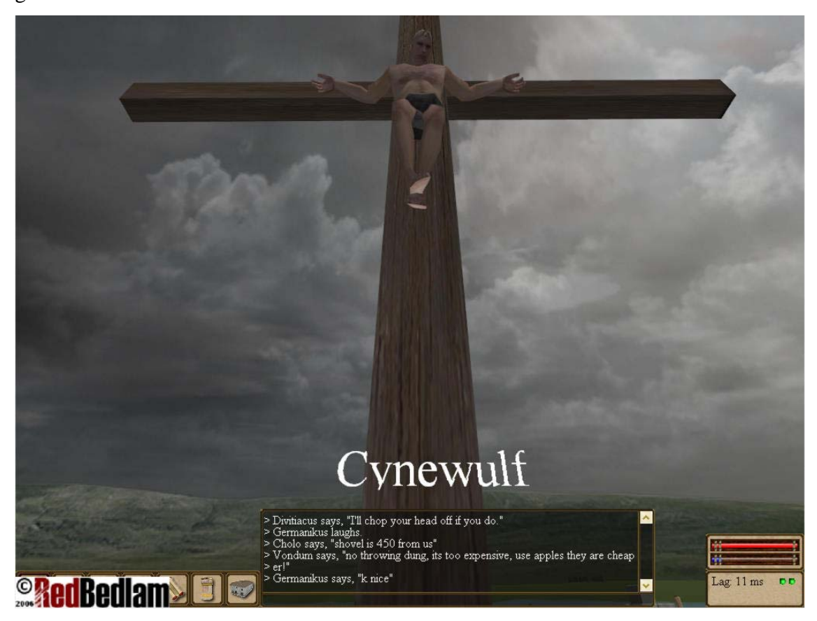
Figure 1 Crucifixion of Griefer in Roma Victor – picture from www.roma-victor.com

Other punishment systems in MMORPGs include crucifixion, as exhibited in Figure 1, in the game Roma Victor.<sup>6</sup>