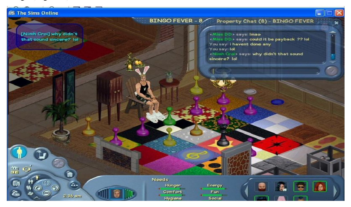
Figure 6: TSO Bingo - created by the players themselves

<u>Societal</u> – Social players, although this does not always appear on their gameplay statistics. They're very active communicators, so rumours and news will most often travel through a hedonistic auslebeners player. They're the keepers of the moral economy and are pretty much in control of what social behaviour is deemed acceptable and unacceptable, they can make or break someone's societal significance or reputation by force of communication via rumours and other news outlets. It's usually a Hedonistic Auslebener who starts third party media outlets, like radio shows and newspapers.