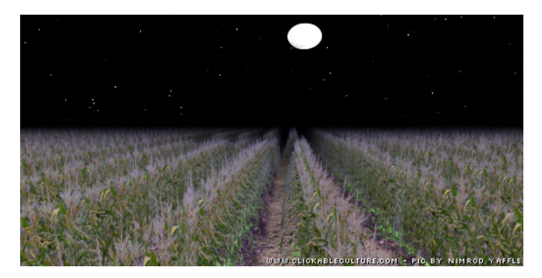
Figure 2 Second Life Cornfield

Second Life has also tried a punishment method with griefers, but Linden Lab, the creators of