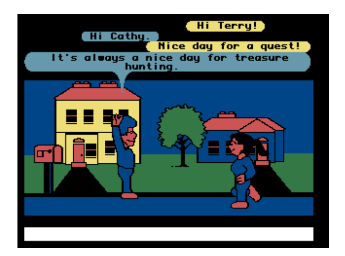
Figure 4: Screenshot from Habitat.

MUDs are persistent worlds. Unless there is a system or server error the MUD worlds never stop evolving. The players themselves are creating the space and atmosphere. In 1985, F. Randall Farmer and Chip Morningstar brought MUDs into a new visual era with Habitat .<sup>6</sup> They created two dimensional avatars roaming in two dimensional spaces as shown in Figure 4. It is in fact here the expression avatar is first introduced to the online role playing world. Morningstar and Farmer describe Habitat as a "multi-player online virtual environment" and the avatar as "animated figures (...) that can move around, pick up, put down and manipulate objects, talk to each other, and gesture, each under the control of an individual player" (Morningstar and Farmer, 1991). Whereas with Multi-User Domains one inhabits a virtual world purely with text, a bodily form had now been created to travel experience and communicate through.