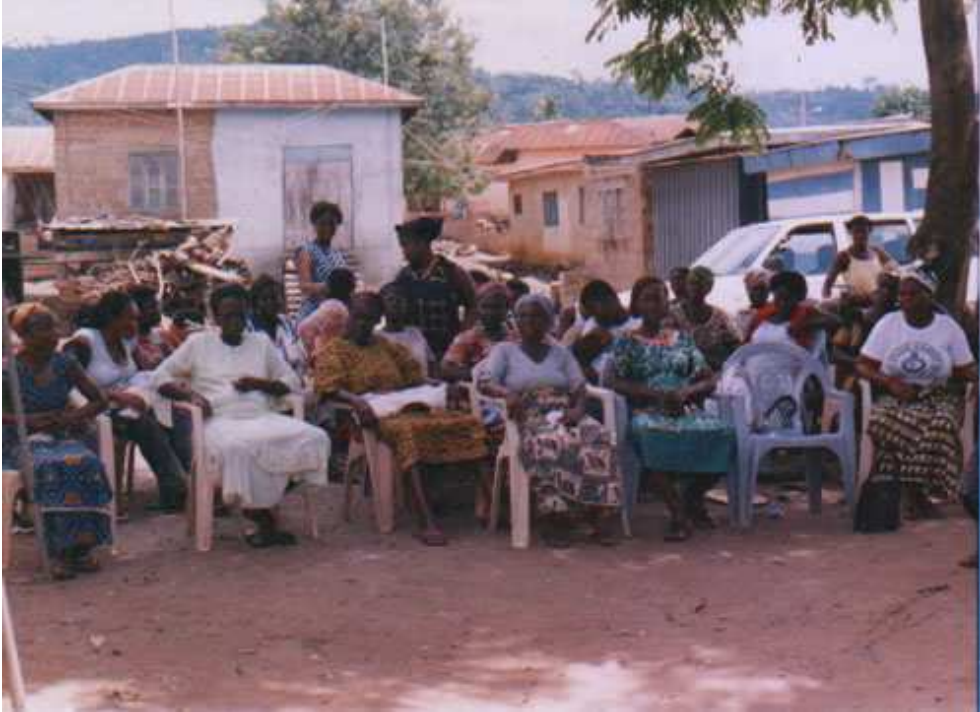
FIDA / Legal Aid Collaboration: mobile outreach clinic in Oyoko (Koforidua) 46