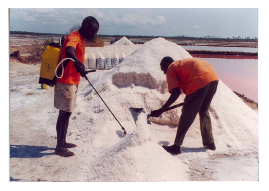
Figure 2 lodation of salt using a knapsack sprayer and manual mixing of a 2-ton salt heap.

Essential equipment: knapsack sprayer, hand sprayers (white containers with red nozzle), KIO<sub>3</sub> and instructional literature for small scale salt iodation.