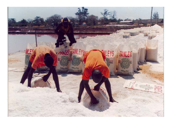
Figure 3 After indation t

After iodation the process of packaging salt from the heap results in further mixing of salt with iodate and the potential to improve homogeneity.