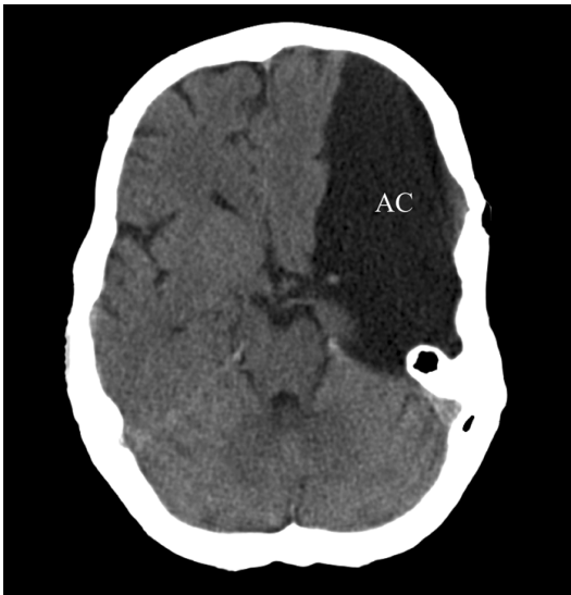
Figure 1 Radiological presentation of an arachnoid cyst (AC). Computed tomography (CT) scan of a large, left-sided temporal AC. Note the splitting of the Sylvian fissure and the compression of the frontal and temporal lobes, all classical features of a Galassi type 3 cyst [10]. The midline is displaced 6 mm to the right. Note the enlargement of the left cranial vault suggesting that the AC was present before the neurocranium was fully developed.

evolved to be the method of choice in screening projects of the transcriptome.