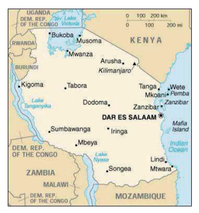
Figure 2: Map of the Kilimanjaro region and surroundings

This mixed methods study was conducted from October 2007 to February 2008 in urban and rural areas of the Moshi district in the Kilimanjaro region of northeast of Tanzania (Figure 2).