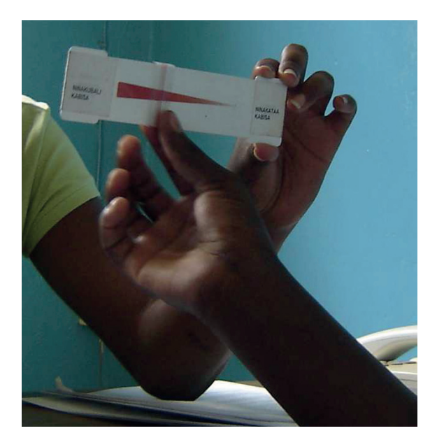
Figure 4: A mother using the VAS scale during the interview