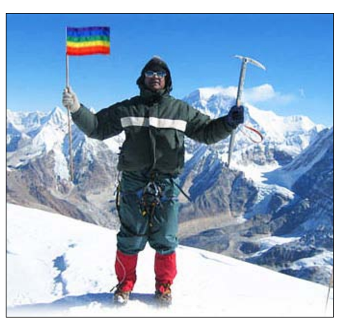
Figure 4: Gay Tourism in Nepal (Gawker 2010)

Other informants agreed that the verdict had impacted positively on the political changes which had occurred. One LGBTI advocate explained that it had become much easier for them to speak with political leaders after the Supreme Court had decided that sexual and gender minorities are natural persons. As a platform from which rights can be claimed and political space occupied, the Supreme Court Decision therefore seems to have been important. The increased political acceptance that the decision brought about was also considered by some informants to have positive consequences for gay tourism. Being a