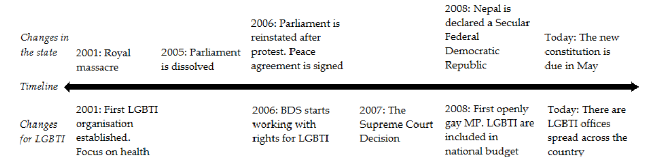
Figure 2: Timeline-Recent changes in the state and for sexual and gender minorities in Nepal

There have also been positive political changes for sexual and gender minorities the past few years. Many of the major political parties have now integrated clauses in their political manifestos recognising sexual minorities (Aryal 2008), and in 2008 the BDS founder Sunil Pant became the first openly gay Member of Parliament (MP) (Thottam 2009). A provision for sexual and gender minorities was even included in the national budget for 2008-09 (Finance Minister Bhattarai 2008). The major political changes in Nepal as well as the changes for sexual and gender minorities the past ten years are summarised in figure 2.