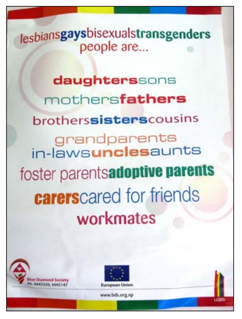
Figure 7: Poster - LGBT are ...

For the supporters of sexual and gender minorities, arguments along the lines of "they are natural" were common. The informant above had realised that falling in love is natural, and