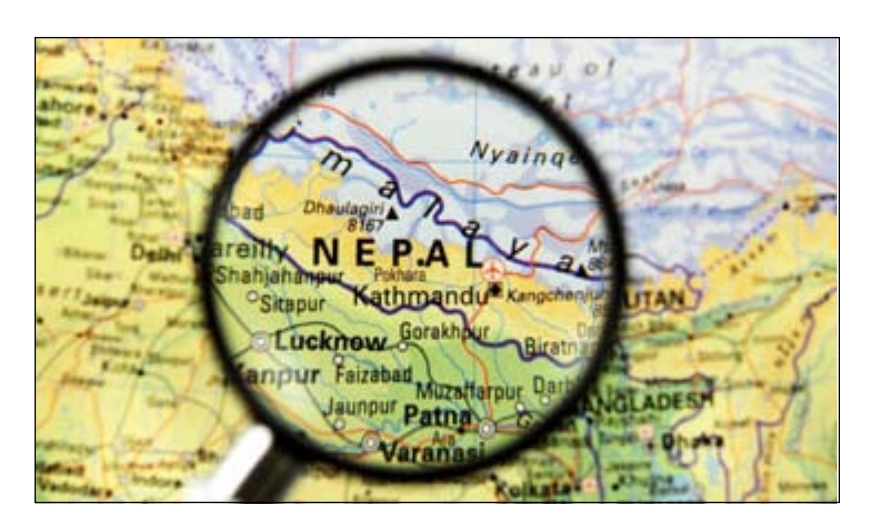
Figure 1: Examining Nepal (Top News 2010)

"Nepal, Asia's LGBT Mecca" (Jones 2010). Statements such as this one are not uncommon nowadays, as Nepal is being heralded as the LGBTI (lesbian, gay, bisexual, transgender and intersex) haven of South Asia. Five years ago however, such a statement would seem absurd and out of place. The purpose of this study is to examine the recent changes as well as the current legal, political and social situation for sexual and gender minorities in Nepal. It is also of interest to consider if there are best practices from this specific case that could be transferred to other cultural contexts. In this introduction I will first examine the situation of LGBTI from a human rights perspective. Thereafter I will address the recent political and social changes in Nepal, before discussing some cases of sexual and gender minorities in a regional and global context. I will then present the research questions which form the basis of this study, before finally introducing the structure of the rest of the thesis.