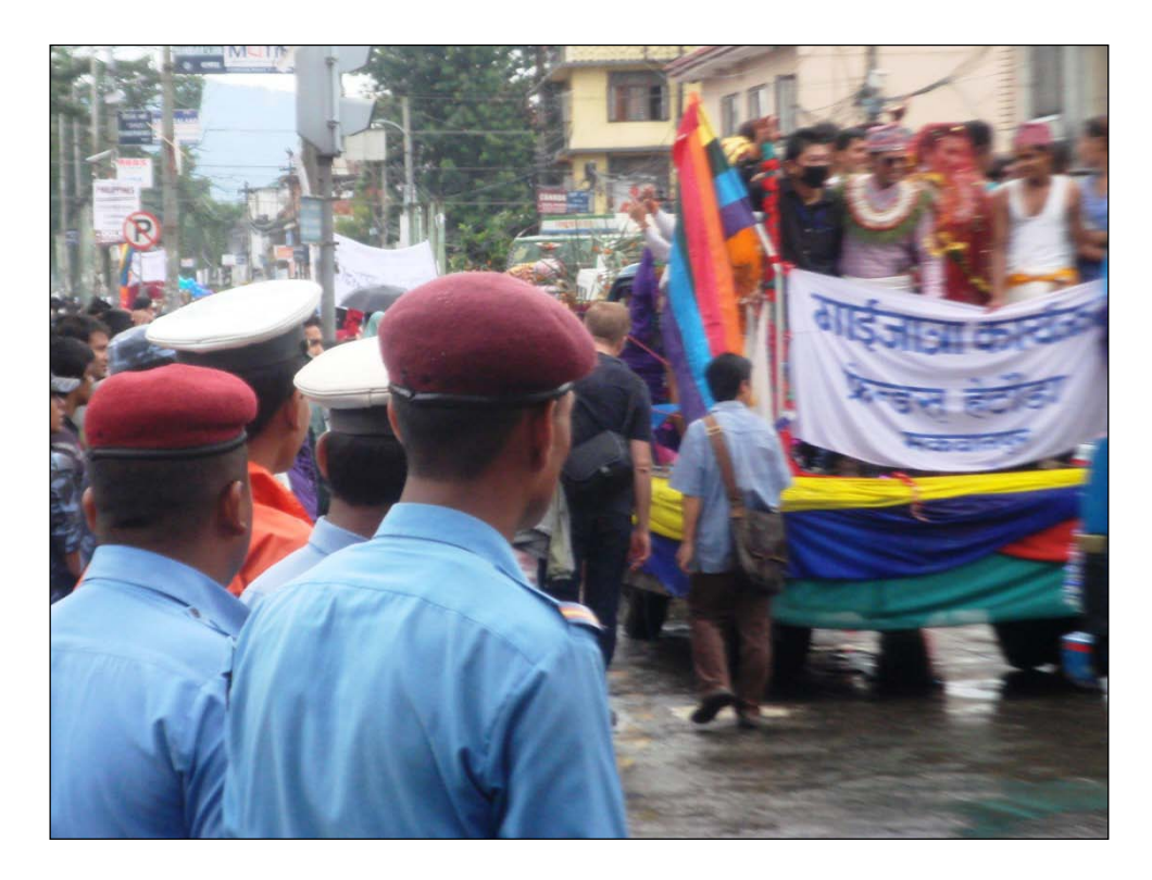
Figure 8: Police watching the LGBTI march in Kathmandu 2010

because inside every police there is a person, so sometimes personal attitudes can come up". In light of performativity theory, the attempts of individual police officers and the public to constrain and police sexual and gendered others can be understood as their way of performing their own heterosexuality.