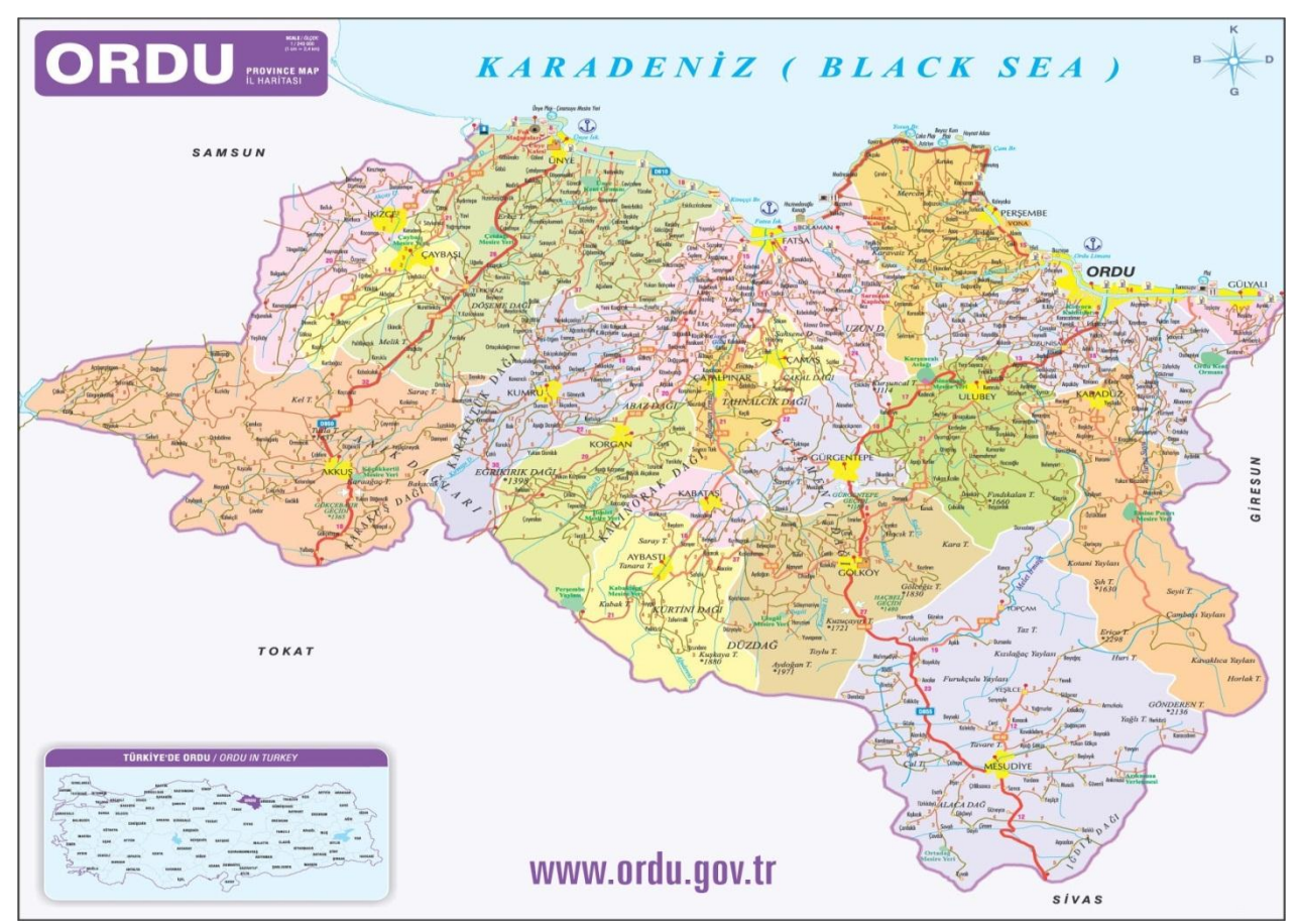
Map 1. Ordu map