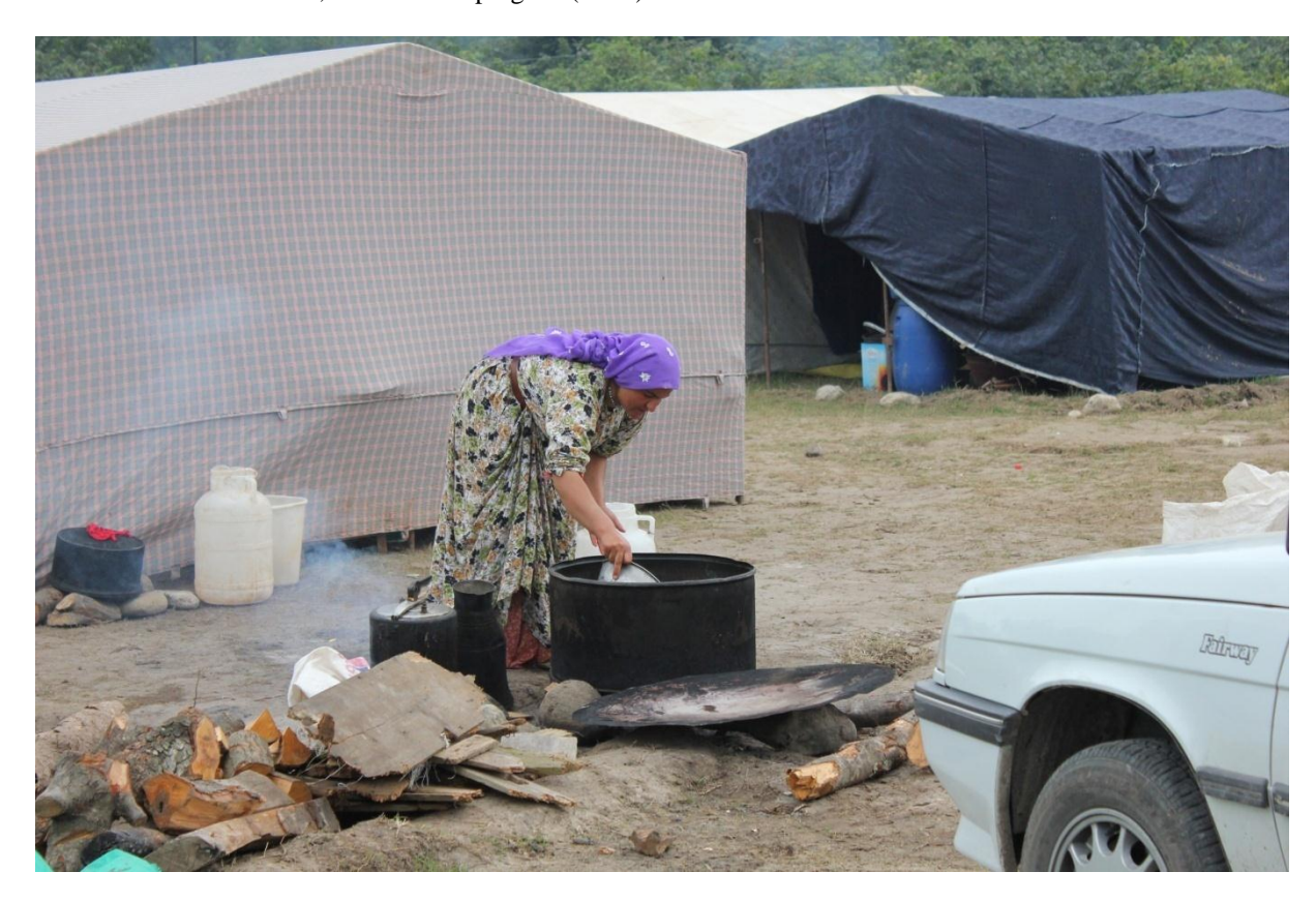
Photo 2. Hazelnut worker is cooking meal (Uzunisa camping site-Ordu)