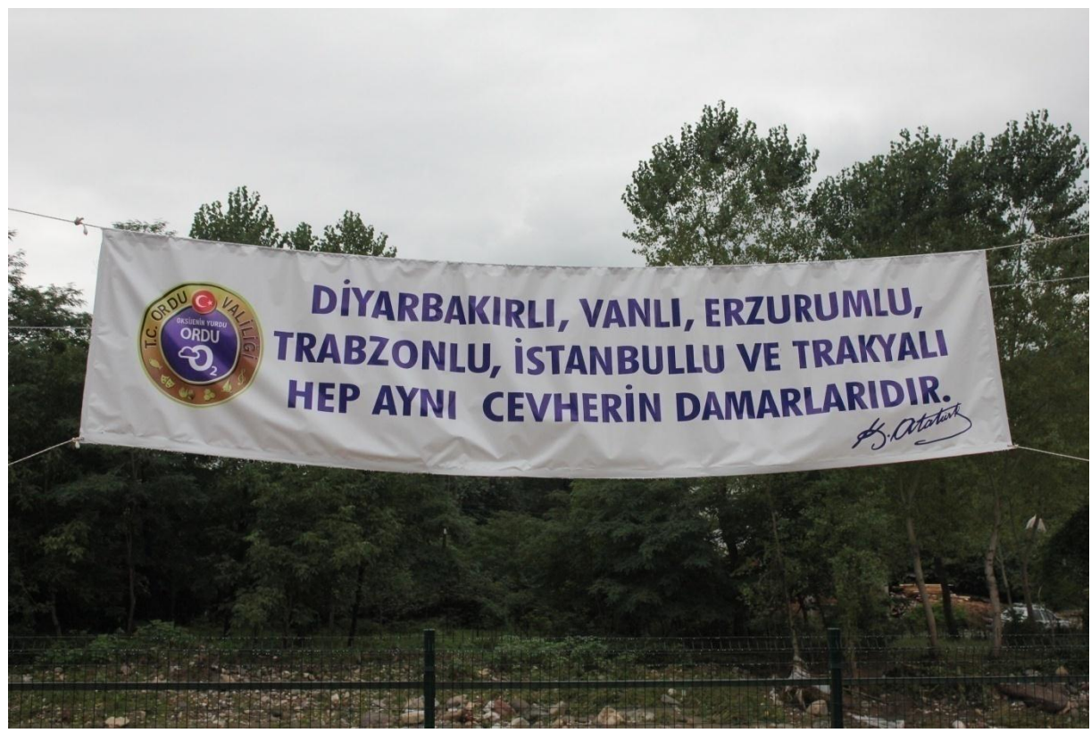
Photo7. Poster of Ataturk's dictum in Uzunisa camping site: "From Diyarbakir, from Van, from Erzurum, from Trabzon, from Istanbul, from Trakya they are all the sons of one nation, all the veins of one jewel" (Uzunisa camping site-Ordu).