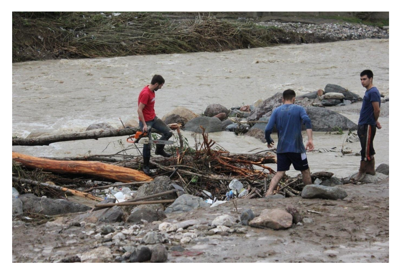
Photo 14. Villagers are collecting wood from riverside after the flood (Uzunisa camping site-Ordu)