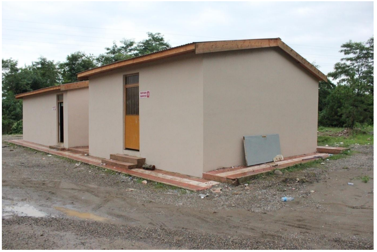
Photo 6. Baths and toilets in camping site (Uzunisa camping site-Ordu)