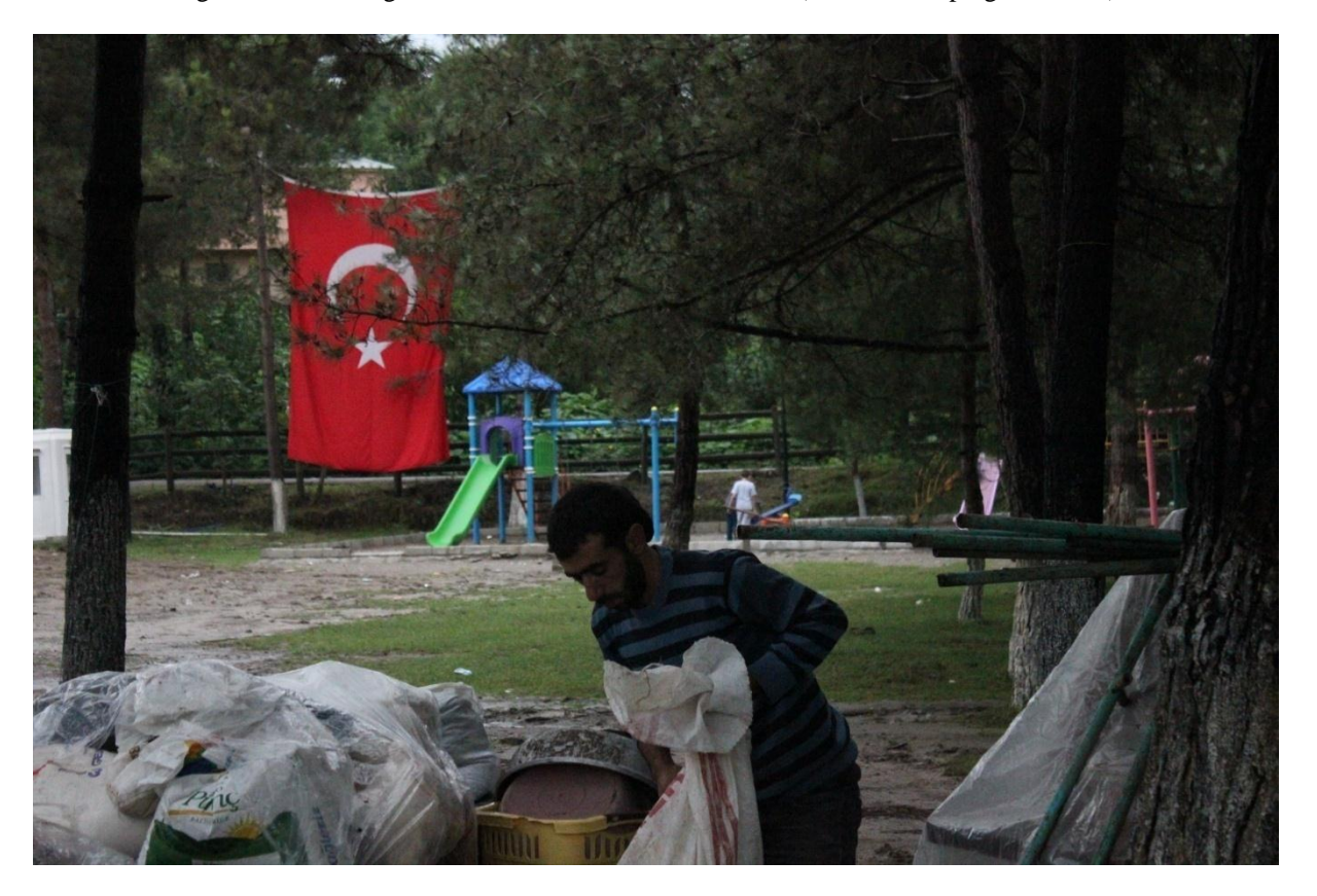
Photo 15. Turkish flag in the entry of Uzunisa camping site (Uzunisa camping site-Ordu)