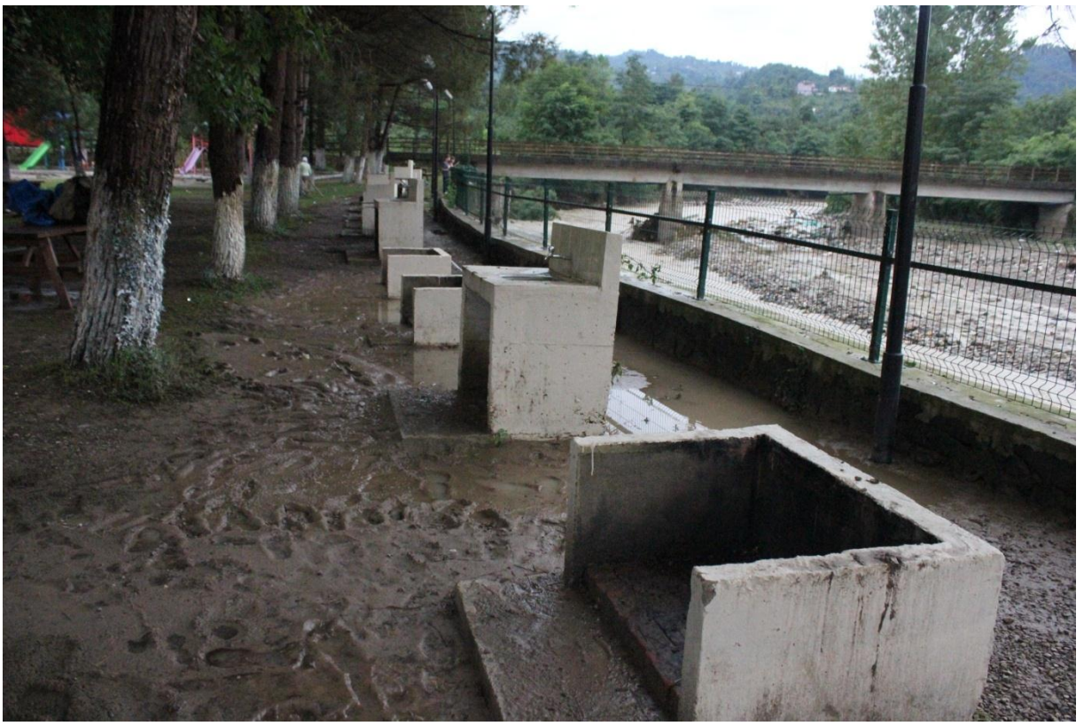
Photo 13. Cooking places in The Uzunisa camping site after the flood (Uzunisa camping site-Ordu)