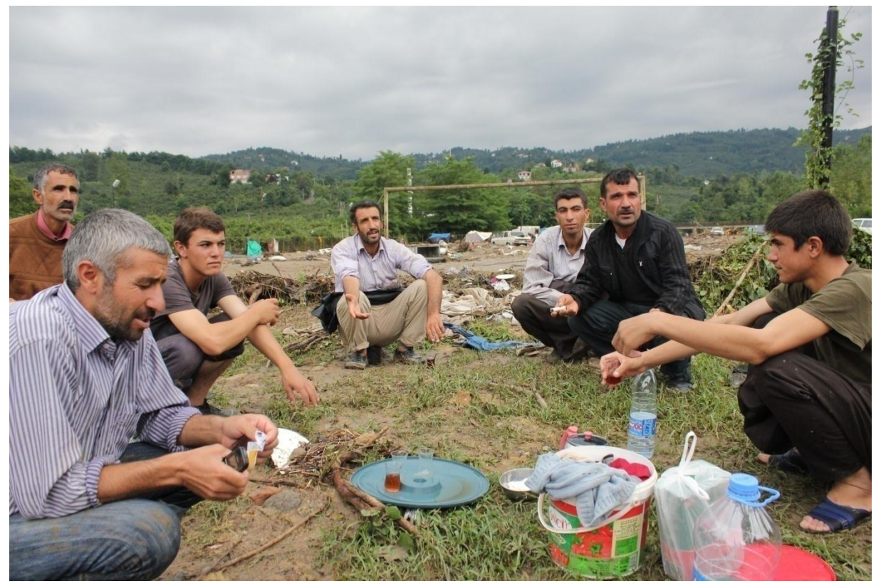
Photo 12. Conversation with the workers after the flood (Uzunisa camping site-Ordu)