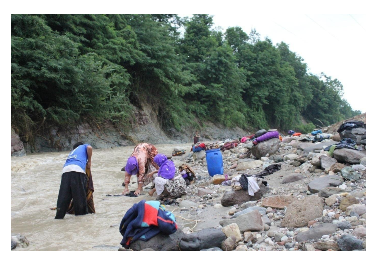
Photo 9. Workers are cleaning their daily stuffs in the river. (Uzunisa camping site-Ordu)