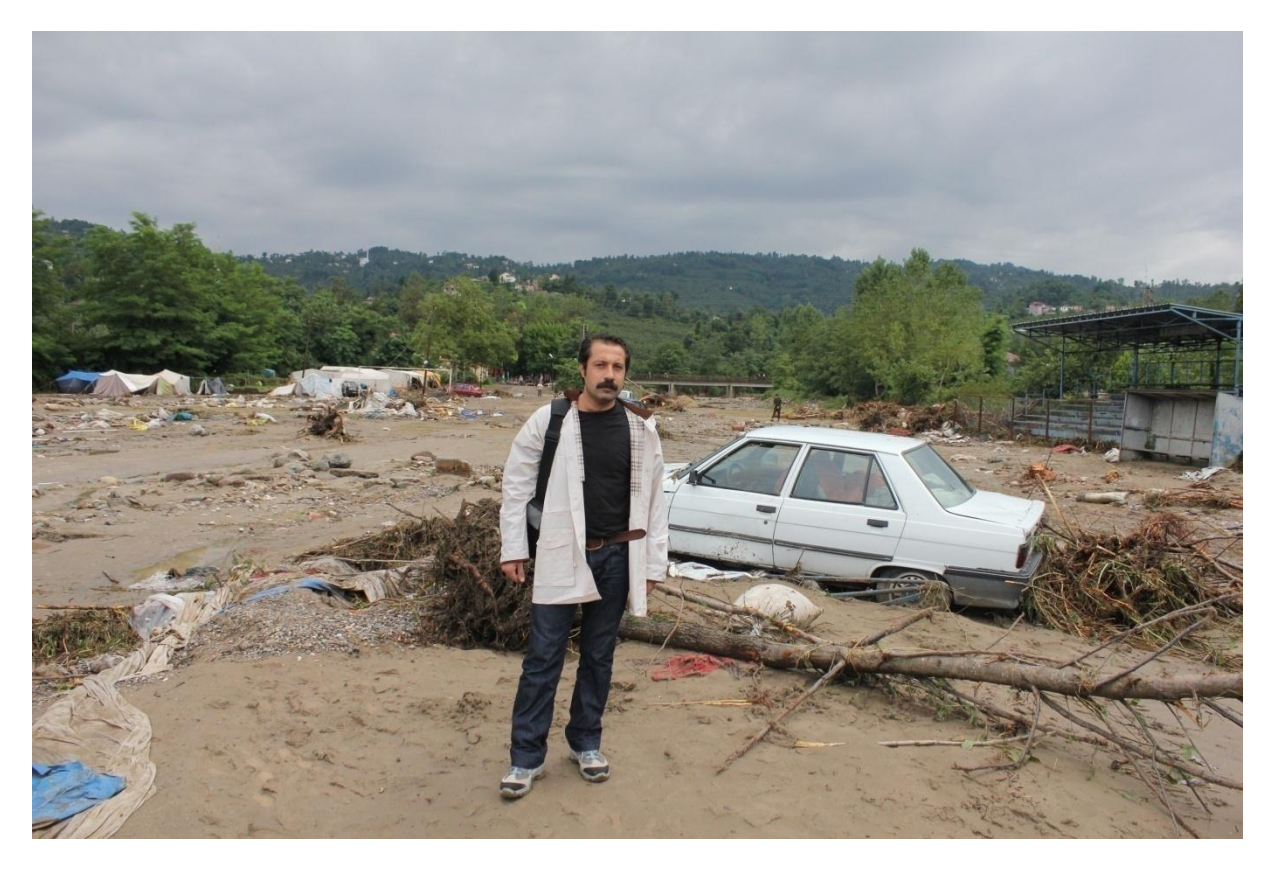
Photo 11. Researcher is in the Uzunisa camping site after the flood (Ordu)