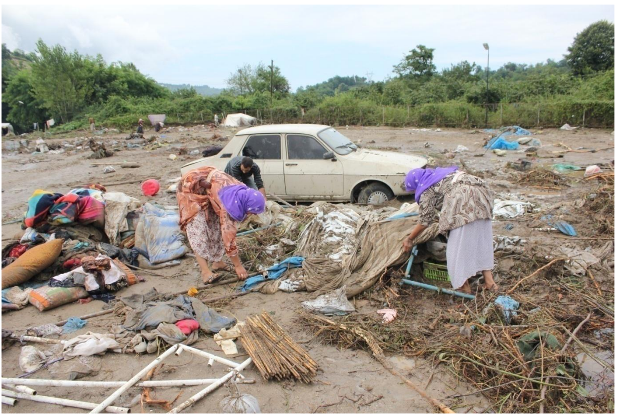
Photo 8. After the flood Uzunisa camping site(Uzunisa camping site-Ordu)