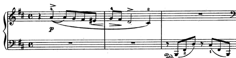
Ex. 20, Melancholy , mm. 1-3.

The theme (mm. 4-9) is divided into fourth declamatory figures. In ex. 22, each melodic figure begins with the B and ends with A three times. It is important to play each B differently, increasing the dynamic and finally going to forte in (m. 7). The accompaniment helps to keep the pulse and play the melody more continually. The eight-note rests are very important to keep in time. (ex. 2)