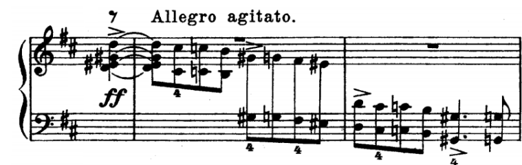
Ex. 24, Melancholy , mm. 25-27

The melody is doubled in octaves. The measures 26-27 should be performed with the left hand as Grieg implies in the score, feeling the phrase with the melody on the top. The clear rhythm and the accents increase the expression and dramatic effect in a contrast to the theme's character.