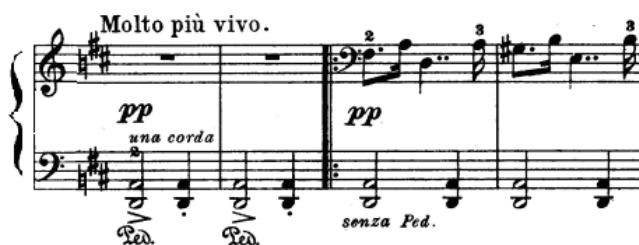
Ex. 9, From early years , mm. 59-62

The rhythm in the bass is dominating in this section throughout. It should be performed very accurately, without acceleration or losing the rhythmic control. The bass line (see ex. 10) has an interesting countermelody to the right hand.