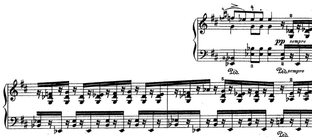
Ex. 40, Wedding Day at Trolldhaugen , mm. 31-33

It is good to bring out the melody in the top voice. Eleonor Bailie suggests to practice as shown in example 41. To avoid of choppy feeling of alternating chords and rests, the accents emphasize the first and third beats, which helps to feel the pulse that builds up the four phrases in this part (from m. 41 to m. 51 ). The performer should be attentive to the long pedal here (mm. 31-33). Grieg’s pedaling was intended for pianos at his time and should be used carefully on modern pianos (see footnotes on page 19).