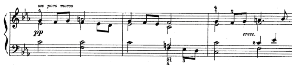
Ex. 33, Ballad , mm. 17-19

This section (mm. 17-25) will be repeated in mm. 33-40, again with octaves as mm. 13-14 in low register in the left hand, creating a darker atmosphere (ex. 34). In this register the performer should be careful with the pedal playing this piece on modern pianos 16 . The low register in the left hand can easily sound too loud and the pedal should be used discreetly in order not to overpower the melodic line in the right hand. (ex. 34)