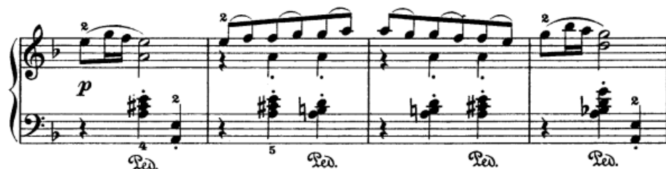
Ex. 4, From early years , mm. 17-20.

The musical material is now developed and leads to the culmination point of the A section. The rhythm is foreshortened, with crescendo and stretto in measures 17-26 (ex. 5). In a short amount of time we get a big musical effect.