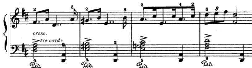
Ex. 10, From early years , mm. 69-72.

The first four measures are rhythmically varied in the following four measures. This helps to create the flow as opposed to the static rhythm in the left hand. It is possible for the right hand to be more flexible rhythmically than the static left hand.