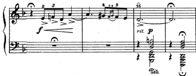
Ex. 15, From early years , mm. 170-173

After a fermata the final coda comes as a dramatic recitative in D minor. (ex. 15) Each note is declaimed. The long A in the melody (ex. 15, mm. 170-171) reminds us of the opening section (see ex. 2).