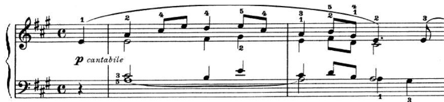
Ex. 16, Peasant's song , mm. 1-2

This melody which is like a folk song line is difficult to perform because of its simplicity. The tension between the notes should be made clear. In ex. 16, the melody has two A flat, two C sharp and two E flat. The question is which tones are to be played more expressive so as not to destroy the whole line. The culmination point in ex. 16 is the second E (fourth beat of measure one). It is the highest tone before the melody descends. The first A is softer then the first C sharp which is softer then the first E. The performer should be very careful with the D as not to stop the ongoing flow. A clear understanding of the structure of this phrase helps to make a legato as the composer has indicated.