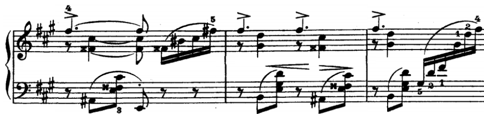
Ex. 27, Salon , mm. 2-4.

In measure 3 (ex. 27) the challenge can be to coordinate the hands. The performer should be careful to not be too stiff in the left hand. The slurs in the accompaniment (m. 2-4) should be articulated, because it helps to prolong the F sharp in the melody. In performing this it is necessary to find comfortable movements between the hands: the right hand falls on the F sharp and lifts up together with the slurred left hand.