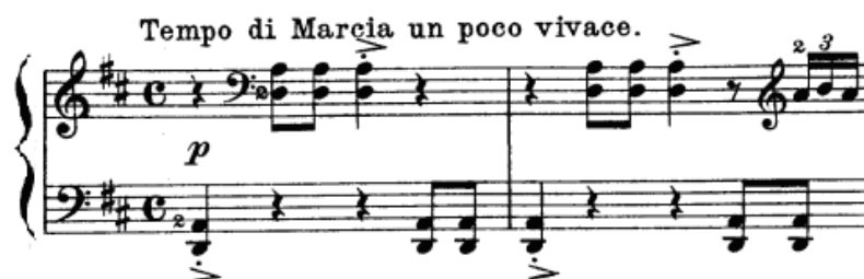
Ex. 36, Wedding Day at Trolldhaugen , mm. 1-2

The accented third beat, with staccato in the left hand, creates a feeling of motion. The dancing rhythm in the accompaniment helps the right hand to play more articulated - the hands falling on the slurs and lightly lifted with the staccato (ex 37). These synchronous movements between the hands make the articulation more precise. In my experience the feeling of going forward to the first and third beats help me to create flow despite the marching rhythm.