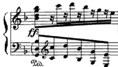
Ex. 8, From early years , m. 41.

The B section is more rhythmic in a kind of “springar” - rhythm in the left hand 2 . (ex. 9)