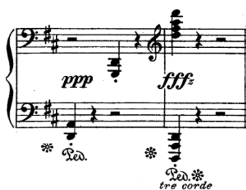
Ex. 46, Wedding Day at Trolldhaugen , mm. 181-182

The very interesting is the ending of this piece. The composer uses the big dynamic contrast between two last measures. (ex. 46) The performer should change his sound from ppp to fff only by a rest.