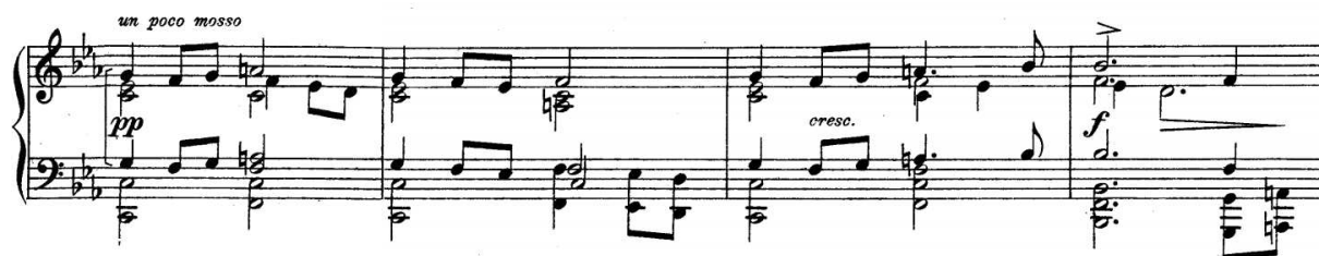
Ex. 34, Ballad , mm. 33-36

Tempo I (mm. 25-32) contains similar musical material as in mm. 17-24 and the opening mm. 1-8. This section will be repeated in octaves in mm. 41-48, now with a more pathetic expression. The culmination point of the whole piece is clearly in mm. 44-45 and created by the expanded bass line with accents in fortissimo . (ex. 35) The bass line speaks as a declamation especially if played with portato articulation. Eleanor Balie recommends to play the bass acciaccatura in measures 44 and 45 (ex. 35) by catching the G and B flat clearly in the pedal on the first beat. She adds, that the one can take time in measure 45 and “expand ever more grandly from measure 44 towards the climatic chord on the second beat of measure 45”, 17 thus creating a big culminating effect.