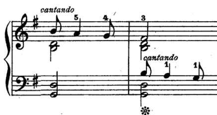
Ex. 44, Wedding Day at Trolldhaugen , mm. 59-60

He adds that the performer should “think about the syncopation accent in relation to the usual accent on the first beat”. 20 The syncopated motive - repeated between the hands - create the movement despite the organ point in the left hand. (ex. 44)