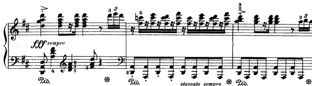
Ex. 45, Wedding Day at Trolldhaugen , mm. 162-164

The very interesting is the ending of this piece. The composer uses the big dynamic contrast between two last measures. (ex. 46) The performer should change his sound from ppp to fff only by a rest.