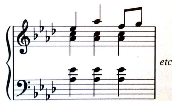
Ex. 30, Salon , m. 20