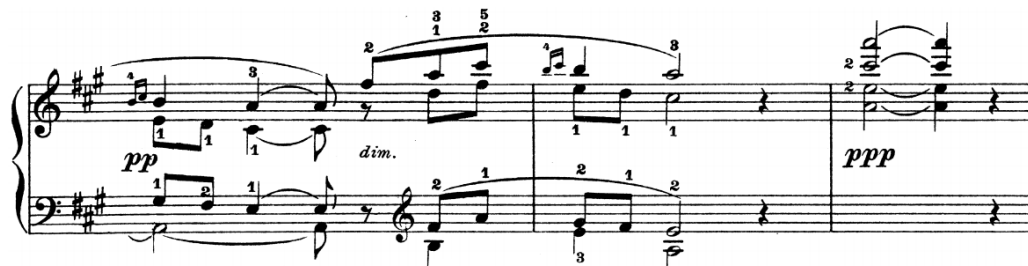
Ex. 19, Peasant's song , m. 24-26.