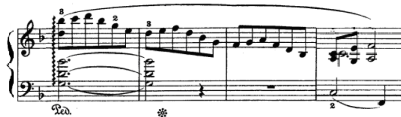
Ex. 3, From early years , mm. 9-12.

This phrase is repeated twice, the first time in G minor and the second time in E flat major, which suggests that the second phrase could be played softer.