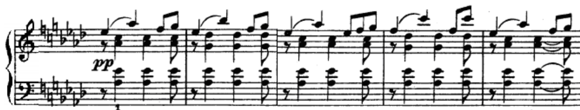
Ex. 29, Salon , mm. 20-24