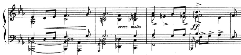
Ex. 35, Ballad , mm. 43-45

In my experience shaping the form of this piece depends on thinking about the final culmination point (mm. 44-45) already from the beginning and implies carefully building up the dynamics and saving the expression until the final statement of the theme.