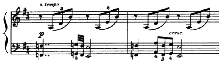
Ex. 24, Melancholy , mm. 16-17

Stringendo (m.18) brings the phrase to a shifting of the beat by the syncopated left hand. In my experience, the syncopated B in the left hand (m. 19) can be played too powerfully and lose the effect of syncopation. The H in the left hand should play softer than F with a tendency to strive forward. The syncopation can give the impulse to the sixteenths and F in the left hand (m. 19) will continue the phrase. (ex. 25)