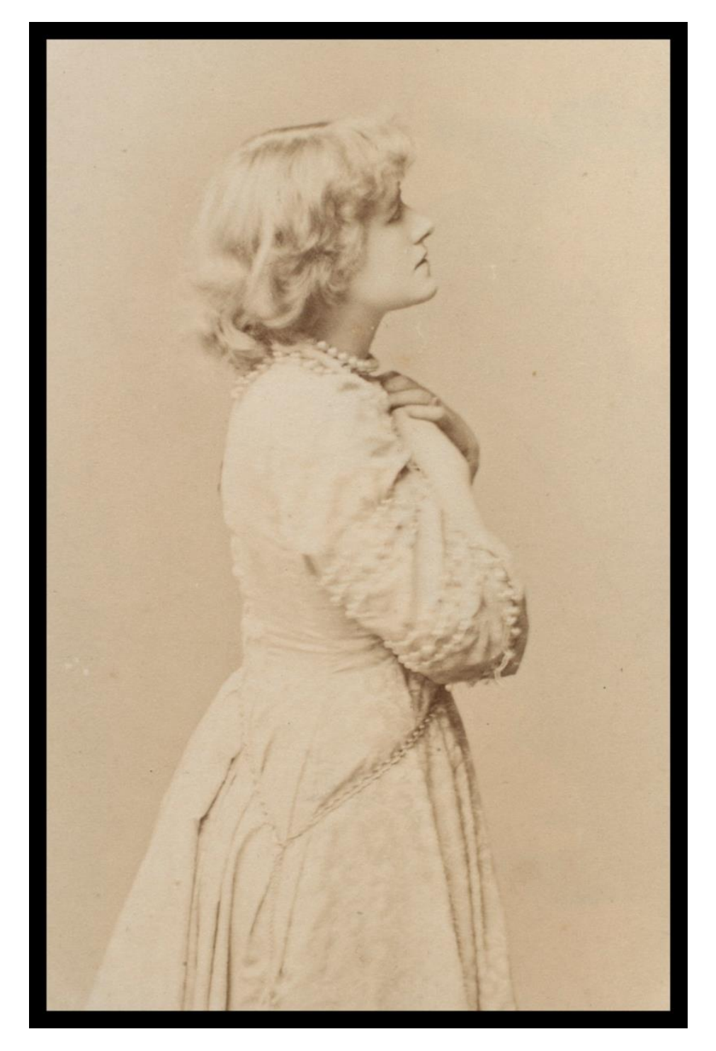
Ellen Terry as Ophelia from the Lyceum Theatre's production of Hamlet , Window & Grove, London, 1878, 9 x 5,8 cm. Victoria and Albert Museum, London.

The photograph could be said to be of Ellen Terry in role. But it could also be said to be of Ellen Terry in a costume or of the role Ophelia being played by Ellen Terry in the production of Hamlet at the Lyceum in 1878. The problem of which side of the difficult 'as' to assign the