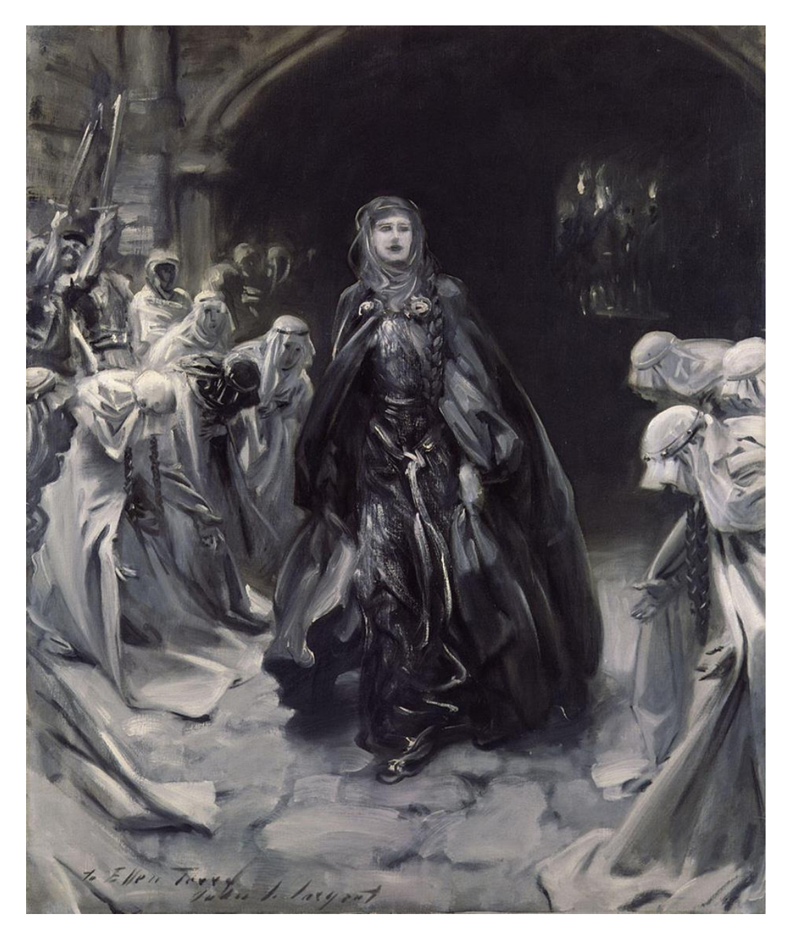
John Singer Sargent, Ellen Terry as Lady Macbeth , 1906 after a sketch done in 1889, National Portrait Gallery, London, 85,1 x 72,4 cm, oil on canvas.