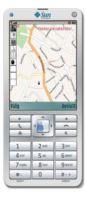
Figure 2. The PB game as it appears on a mobile phone. For clarity, the screenshot was made on a mobile phone emulator without connected GPS, hence the display of 'Venter pa satellitter...' ('Waiting for satellites') instead of an actual distance.

the text turns green. In the version of PB that was played in relation to this particular field trial, the radius was set to 40 meters, but the radius around each location is easy to change, through altering the code in the phone application. The icons bar displays an icon for each location that the game player has successfully "picked up," and empty spaces indicating how many there are still left to pick up. From the menu, the game player can choose to pick up locations, display and re-display the most recent task assignment and hints, and check the current game score. Interactions are mostly done using the standard Symbian menu system. Figure 2 illustrates the game application on a mobile phone emulator.