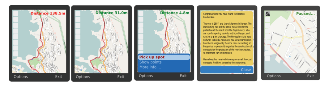
Figure 3. "Pick up spot (location)" interactions in the game

closes the text-overlay, the mode is returned to map view. The distance meter indicates that the game is paused, and the icon for the first location is displayed in the icons bar. The icon is a picture of a man with a uniform that looked like the one Premier Lieutenant Bielke wore. The game is automatically paused so as not to stress the players when reading text, and has to be restarted by the player. The latter functionality has been added since the completion of the user test described here.