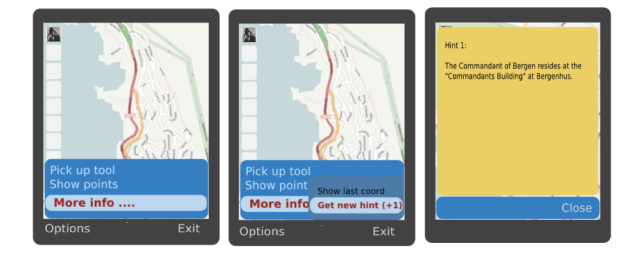
Copyright © 2009, IGI Global. Copying or distributing in print or electronic forms without written permission of IGI Global is prohibited.