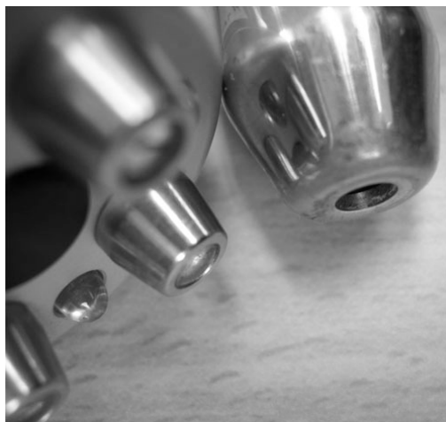
FIG. 3. Laser probe tip, the 904 nm laser with a protruding lens ( left ), and the 810 nm laser with a folded up lens ( right ).

contact than with no skin contact. On the other hand, the 810 nm laser probe has a recessed flat window. Here, the metallic ring surrounding the lens will push skin underneath the lens, which leads to less penetration with the probe in skin contact than not in skin contact (Fig. 3).