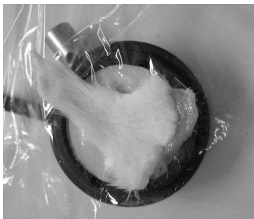
FIG. 1. A skin flap, consisting of skin overlaying the gastrocnemius muscle.

Step four (same procedure as in step three, but with the probe not in skin contact). The laser probe was now kept ~1 mm from the skin during LLLT irradiation.