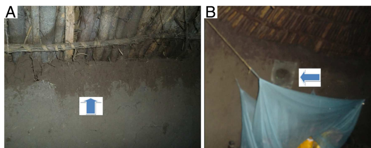
Figure 3 Openings around eaves closed by mud (A) and openings for ventilation closed by metal mesh (B).

Mosquito data within household was described by mean number of An. arabiensis per CDC light trap per night. A Generalized Estimating Equations (GEE) with a negative binomial error distribution was used to account for over dispersion of An. arabiensis and culicine counts. A first-order autoregressive correlation structure was considered to account a serial correlation between repeated catches made in the same house. The GEE was fitted separately to counts of different abdominal conditions of An. arabiensis and overall culicine to determine the protective effect of screenings against house entry of the species. The mean's ratio of mosquitoes between screened and control houses were used to determine the percentage reduction of house entry. Non-parametric correlation was used to see the house entry patterns of An. arabiensis in pre-intervention and post-intervention months. All houses were included in analysis because no damaged metal mesh and malfunctioned CDC light traps were observed. The statistical significance of screening effect was tested by P-value obtained from GEEs at 0.05 level. IBM SPSS version 20 (SPSS Inc, Chicago, USA) was used for data entry and analysis.