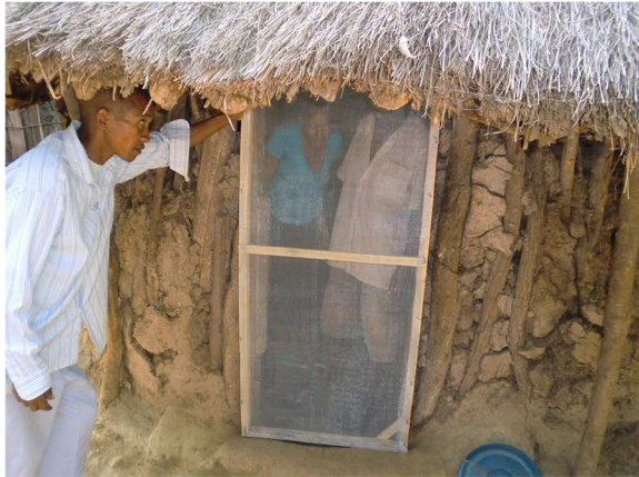
Figure 2 External view of screened door.

half gravid and gravid based on abdominal condition. Culicines were counted and discarded.