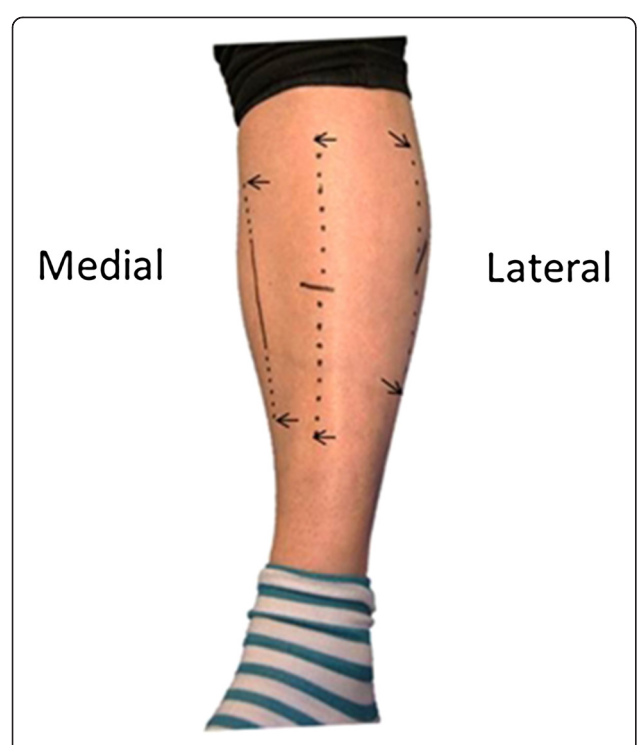
Figure 1 Photograph of patient's leg after surgery. The three fasciotomy incisions used to access all compartments are illustrated. Continuous black lines indicate skin incisions, and dotted lines between arrows indicate the extent of the subcutaneous fascia splitting: approximately 20 cm in the anterior, lateral, and superficial posterior compartments and approximately 10 cm in the deep posterior compartment.

skin incisions, an adaptation to modern endoscopic principles. Only the fascia of the anterior compartment was split blindly. The superficial fibular nerve was protected by splitting the fascia under direct vision. The other leg was operated on only after the patient indicated satisfaction with the results of the first operation. The distance between fascial edges was noted. Patients were encouraged to walk from day one and to use elastic stockings for 2 months as protection against phlebitis and deep venous thrombosis (DVT). Follow-ups were performed by someone other than the person who performed the surgery. The mean follow-up time was 2.8 years (range 2–4.3 years). Complications, including hematomas, infections, DVT, and any unintended loss of sensitivity, were registered.