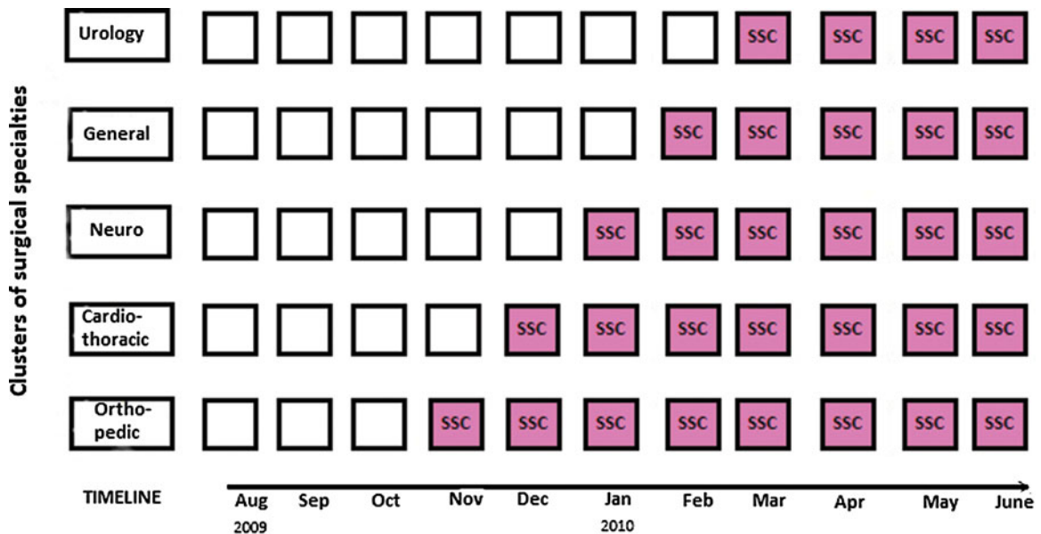
FIGURE 1. Design of the stepped wedge cluster randomized controlled SSC trial in 2 hospitals in western Norway in 2009–2010. Order of the SSC introduction to the clusters was randomized. White box indicates controls with care as usual; colored box, SSC intervention.

The study population included all age groups and elective or emergency surgery. Procedures not involving all 3 parts of the checklist (ie, \gamma knife treatment or donor surgery) were excluded. Patient