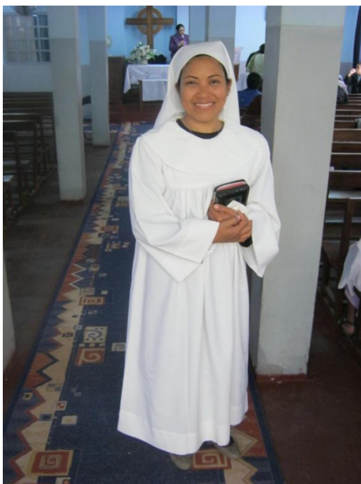
(Picture 1. A highland Merina woman in Antananarivo dressed in the shepherds white robe, typically holding the bible close to the chest)

At the moment when the audience starts to sing everyone in the assembly that is a shepherd (and is designated to conduct this day's asa sy fampaherezana ) rise and go behind a curtain to dress themselves in a large and long white dress, which covers the arms and goes all the way down to the ankles (see Picture 1 & Fig. 1). The dress is the same for men and woman, except that woman also tie a white cloth around their heads. The dress is kept in a special bag to prevent it from becoming dirty and folded in a particular way to prevent creases. The dress is also called “ lamba masina ” which means holy cloth. The dress is supposed to be kept impeccable, and I deduced that some shepherds even perfume the cloth with soap, incense or cologne.