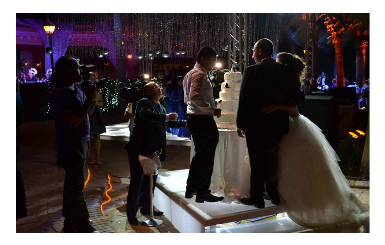
This picture is from a wedding I attended in Cairo, in May 2013.