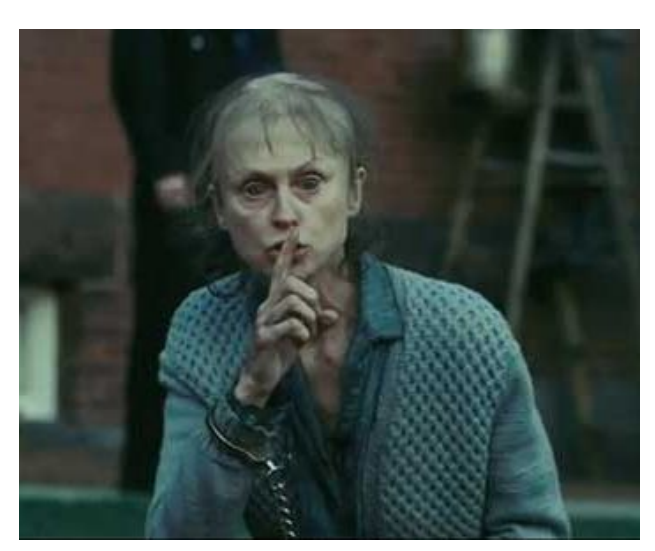
Figure 3.7. One of the shutter island patients, the physical manifestation of madness.

mad and heroically mad. This distinction manifests not only in a meaningfulness and morality of the behavior but also can be physically seen. Scenes in Ward C are perfect example of this, as is the arrival scene where a madwoman smiles to Teddy (Figure 3.7), acting as a face of a mad-house.