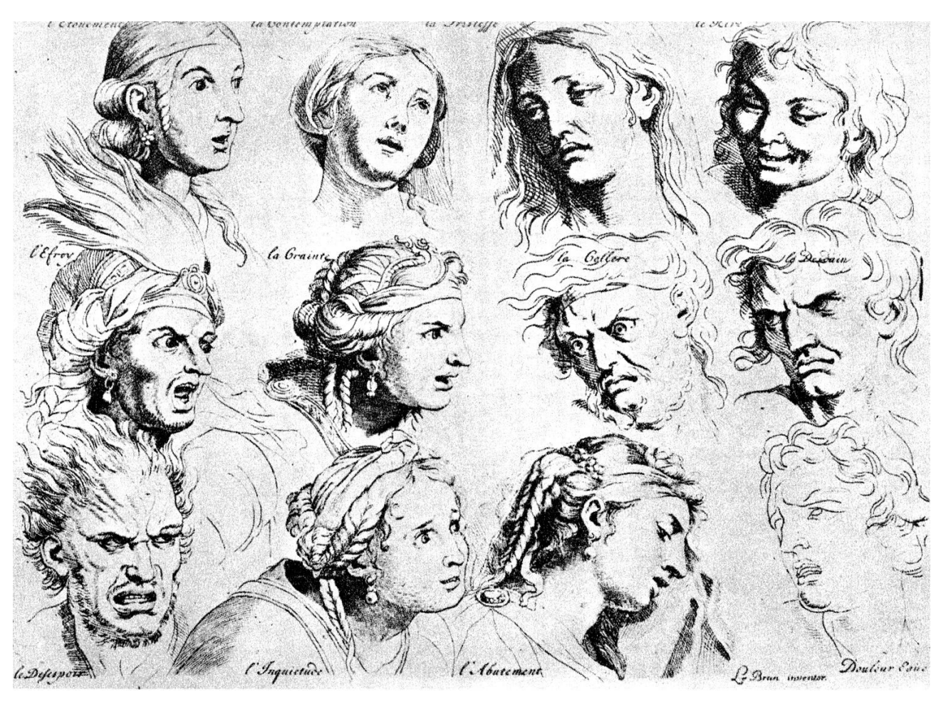
Figure 2.3: Charles Le Brun, the Expressions (from Trait é des Passions, 1698)

It is also interesting to note that Bug actually started Shannon's career as an actor who plays madmen ( Boardwalk Empire (2010 – 2013), My Son, My Son, What Have You Done (2009), even to a some degree the Man of Steel (2013)), in 2012 he was nominated for a PRISM award for depicting a mentally ill person in Take Shelter (2012). Besides the actor's talent, this, I think, has to do with a spectrum of facial expressions that Shannon possesses. In many films he displays his menacing, angry-looking and in general worried expression that associates with a troubled mind – a reflection of ideas about state of a soul reflecting on a physiognomy, and, not only medical but also artistic or even metaphysical tradition, such as Metoposcopy of Girolamo Cardano<sup>48</sup> where he was using facial wrinkles as an indicator of mental illness; or Passions of the Soul by Rene Descartes<sup>49</sup>, where he stated that movement of the soul was reflected through the nerves and then manifested in contractions of the body; or Charles Le Brun who systemized the facial geometry to help to witness the processes in the soul (Figure 2.3)<sup>50</sup>. This illustrates that the way in which movies are consumed, creates a certain expectations and demands on the visual part of the insanity. I think that the visual signs of madness in visual storytelling, although more subtle that