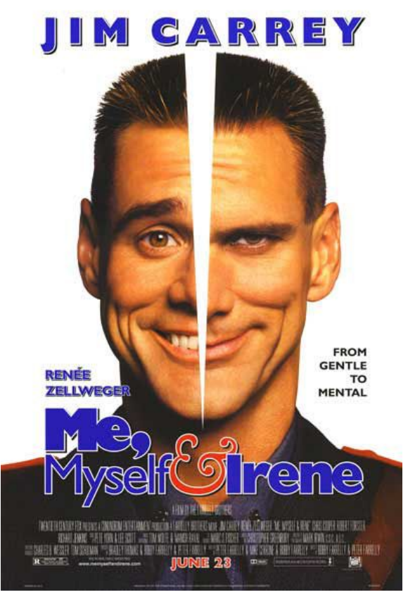
Figure 1.1: US poster of Me, Myself and Irene (2000)