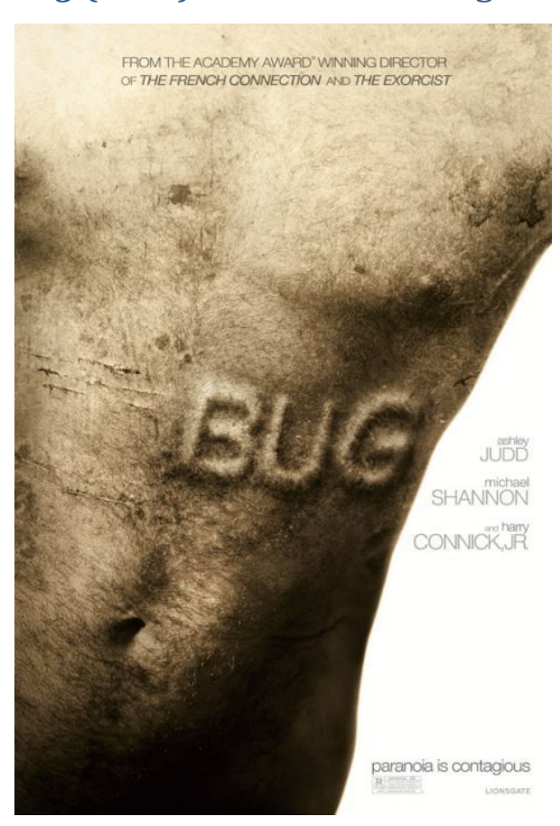
Figure 2.1: UK poster of Bug , a direct refference to The Exorcist