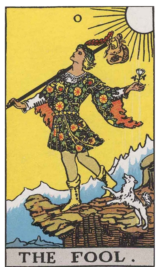
Figure 3.6: Fool steps down the cliff, despite the dog who tries to stop him. Rider-Waite Tarot deck.

Even if the lobotomy looks terrifying to us, for Teddy it is easier than suffering the ghosts of his past that haunts him. At the same time we, as spectators, see this as too big price to pay. By making this choice, Teddy is depicted as having an almost inhuman sense of justice.