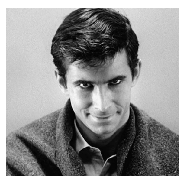
Figure 1.2: Expression of cinematic "mental". Norman Bates from Psycho (1960)

In almost all those cases we can see Freudian psychoanalytical ideas, where the multiple personalities are expression of the fight between the Id and Superego, one - an embodiment of social norms, another of a pure desire. Also it is an often material for horror movies, as it is a good way to hide a menace where he is most hard to find - inside a head of someone who seems to be most harmless. Simultaneously this split provides an easy to understand explanation to the extreme behavior. But there are just few comedies that are dealing with the split personality as a mental condition, even ones that exist seem to be quite obscure and not well known, I only managed to find three examples: Serial Mom (1994) which is more of a spoof on split personality horror movies, Me, Myself and I (1992) and More of Me (2007), both much more moderate in the representation of the illness and also without any major distribution. In any case, they all have a common theme: life can push you so hard that your psyche will shatter (from here probably comes the confusion between Schizophrenia and DID), but the true solution is to accept who you are and become whole again. It is a kind of reassuring narrative, stating that the usual way of life is the right one.