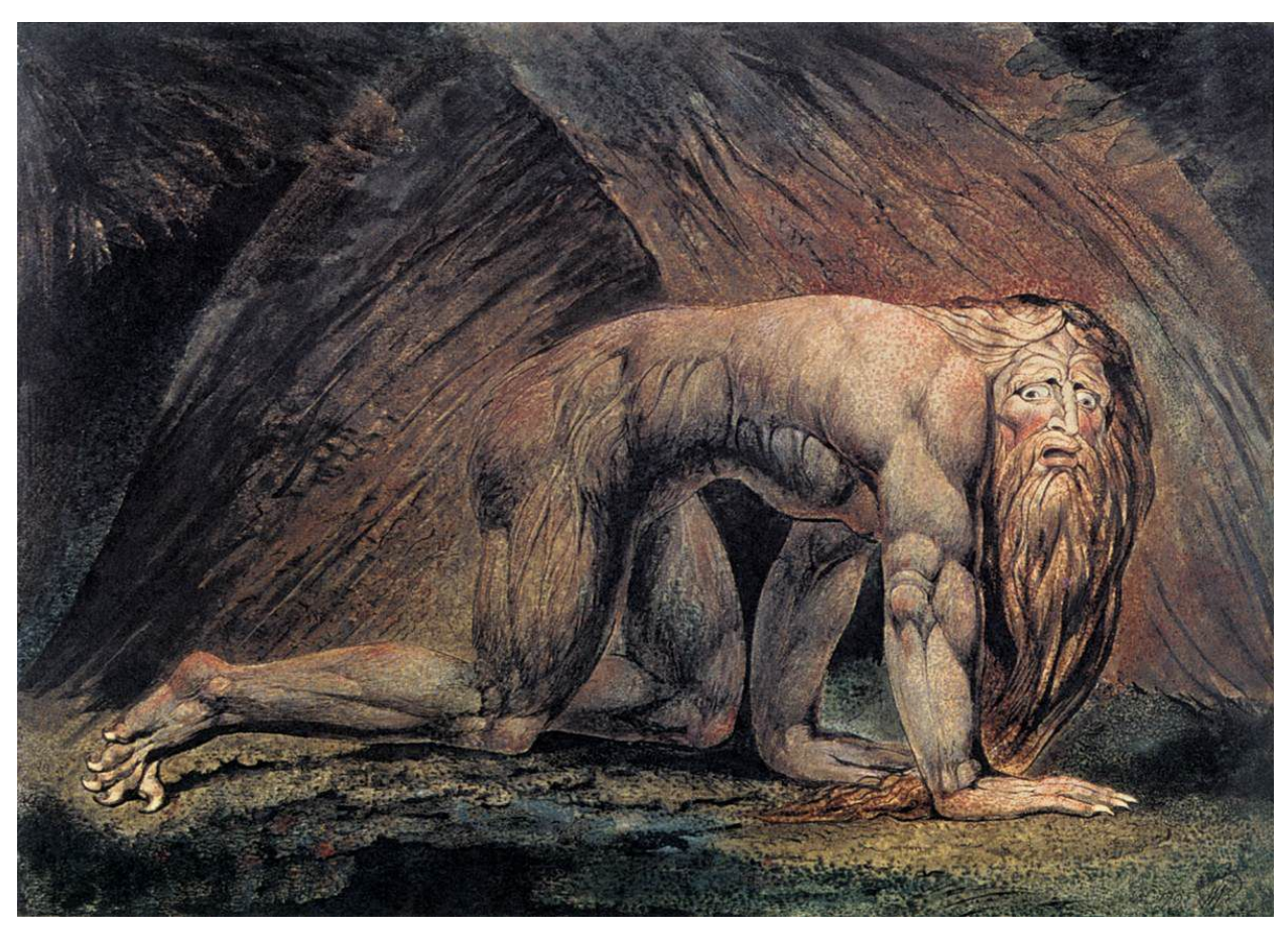
Figure 3.3: Nebuchadnezzar by William Blake, late eighteen century

This lithography, despite the chain and iron door, is an illustration of hope. It also again refers to the light/darkness metaphor that is prominent in Shutter Island .