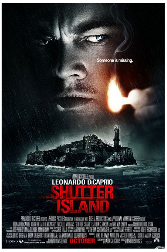
Figure 3.1: Us poster of Shutter Island

is a heaven of classical luxury, calm and warmed by a fireplace, filled with music. But the main difference is light. Ward C is dark the only way to find something here is to bring your own source of light, which illuminates dirty naked bodies of madmen, sight that many of us would prefer to not see. In all Gothic tradition the setting is a reflection of the idea. On the other hand, Doctor's quarters are filled with the warm light. So, on the visual level the distinction between sanity and insanity parallels the opposition of light and darkness and order versus chaos - a very traditional distinction, and distinction that is often used to separate good from evil. At the end, when Dr. Cowley is explaining the truth, he uses a white flip-chart which he deliberately illuminates with a lamp. The light causes migraines for