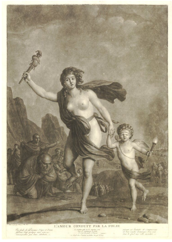
Figure 2.7: Cupid, blindfolded, led by a woman carrying a fool's bauble and personifying Madness, while in the background people are paying their homage to them. 1785 Mezzotint

( Figure 2.7 ), it is interesting to note that people depicted bowing to this pair, probably mocking the idea of making non rational impulses in to a virtues. Unlike Me, Myself and Irene , where love has a magical power to restore sanity, in Bug love is foolish and leads to madness and death, as in this fiction rationality and objective results, not a metaphysical "righteousness" is main factor that separates good from evil and sanity from insanity.