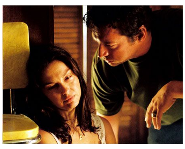
Figure 2.5: Agnes played by Ashley Judd: a pose of melancholy

of dirt is hard to avoid as we are always positioned too close to her body by the merit of close shoots, and it reflects the state that Agnes mind is in – she is struggling at the edge of depression and addictions – also expressed in the numb postures used by Ashley Judd, that remind depictions of melancholy [figure 2.5].