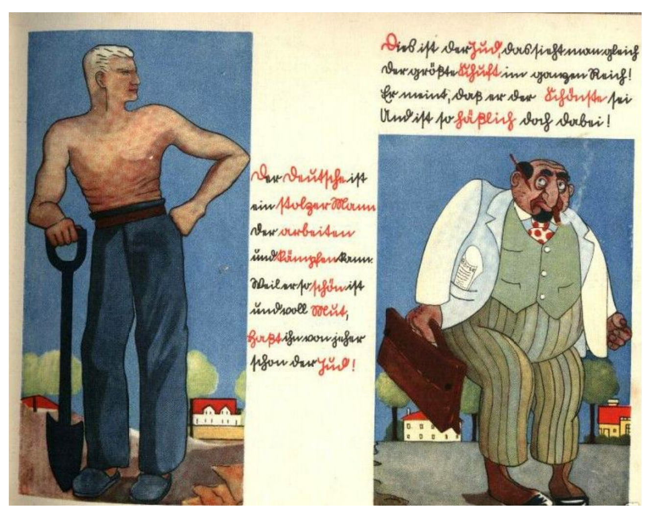
Figure 3.5: Illustration from a children book Trau keinem Fuchs auf gruener Heid und keinem Jud bei seinem Eid, 1936

To answer the question of who is sane and who is not, we together with teddy must solve a riddle, that Dr. Cowley devised. It is here to help Teddy to make the right decision (that basically boils down to staying insane or recovering). In a case that he chooses to resist he will be subjected to a lobotomy, that will make him stop being dangerous, but also will strip him of his free will, identity and probably will make him in to a vegetable, there will be no way back. This is also a healing versus a punishment. And Teddy refuses to be healed because he feels the need to be punished for what he has done, he basically chooses death, as we learn from films such as One Flew Over the Cuckoo's Nest , where is clearly stated that it is better to be dead than lobotomized (a procedure that, I think, taps in our natural fears). But at the same time Teddy refuses to be a