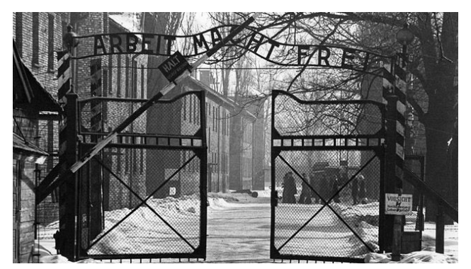
Moreover Dachau that we see in Teddy's memories, does remind of the Shutter Island. Similar barbed and electrified fences, red brick buildings, even inside of the officer's quarters there is the same gramophone, playing the same music that we get to see and hear in the doctor's lounge, where we meet Naehring – a doctor of a

The same goes to the marshal's badge that Teddy caries: it looks a bit different than the real one from the same time period, but it looks real enough not to dispel our suspense of disbelief. This is how Teddy's insanity works: he dismisses, or simply does not notice anything that confronts his delusion. Shutter Island consciously brings a parallel between the madness of its hero and the audience experiencing the movie.