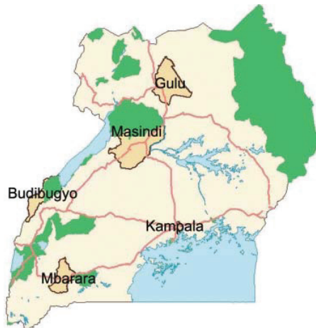
Figure 1. Major towns and districts in Uganda; districts and major towns share the same names. Green shading, national parks; red lines, main roads; blue shading, perennial lakes.

Investigation teams actively searched for case-patients in health facilities and communities and retrospectively reviewed hospital records. Increased awareness of the disease through public education campaigns and the media facilitated reporting of suspected cases to health authorities. Village health teams assisted in case identification and reports and contact follow-up at the community level. Clinical and epidemiologic data were systematically collected from persons with suspected, probable, and confirmed cases. Proxies (usually parents, spouses, or adult siblings) were interviewed for information about case-patients who had died before an interview could be conducted. Persons with suspected cases identified in the community were transported by a mobile ambulatory team to designated isolation facilities. A triage desk was established in the outpatient departments of each health facility in the district to screen for suspected cases and notify the surveillance system. Clinical specimens, including blood, were collected for laboratory testing from all persons with suspected EHF. All contacts were entered into, and follow-up schedules were drawn by using, the Field Information Management System database (10).