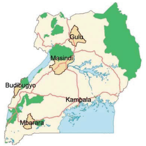
Figure 1. Major towns and districts in Uganda; districts and major towns share the same names. Green shading, national parks; red lines, main roads; blue shading, perennial lakes.

Investigation teams actively searched for case-patients in health facilities and communities and retrospectively reviewed hospital records. Increased awareness of the disease through public education campaigns and the media facilitated reporting of suspected cases to health authorities. Village health teams assisted in case identification and reports and contact follow-up at the community level. Clinical and epidemiologic data were systematically collected from persons with suspected, probable, and confirmed cases. Proxies (usually parents, spouses, or adult siblings) were interviewed for information about case-patients who had died before an interview could be conducted. Persons with suspected cases identified in the community were transported by a mobile ambulatory team to designated isolation facilities. A triage desk was established in the outpatient departments of each health facility in the district to screen for suspected cases and notify the surveillance system. Clinical specimens, including blood, were collected for laboratory testing from all persons with suspected EHF. All contacts were entered into, and follow-up schedules were drawn by using, the Field Information Management System database (10).