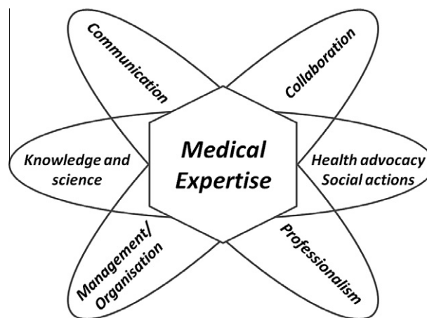
Fig. 1. The seven roles of a physician identified by the Canadian CanMEDS system. Figure modified from http://rcpsc.medical.org/canmeds/index.php .

The updated third version of the CC for clinicians can be found in full text at the ESTRO website [7] or downloaded as supplementary