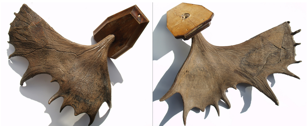
Figure 2. The elk antler from Fluberg, Søndre Land municipality in south-eastern Norway.

it might be of Late Glacial age. A 1.4 gram section of the antler by the pedicle was sent for ^{14}\text{C} dating by accelerator mass spectrometry (AMS) at the Poznan Radiocarbon Laboratory in Poland. The ^{14}\text{C} date was calibrated using CALIB 5.0.1 (Stuiver & Reimer 1993) with the calibration curve Intcal04 (Reimer et al. 2004), using 1 standard deviation ranges. If not specified, all the reported ages are in ^{14}\text{C} years before present (BP).