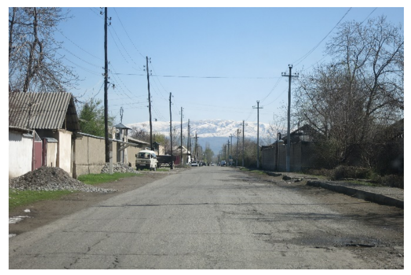
The third field site with the main road going through it.

people as some members of my host family were stateless themselves. Unfortunately, after three months, I once again had to search for a new fieldwork location due to my hosts' and my own security concerns after undesired attention from state security personnel. Through my already established network in the area, I managed to find a new location site for my already ongoing fieldwork.