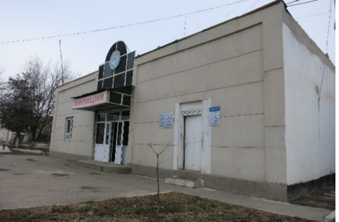
Information posters at a regional passport office and a local administrative building with a passport office and a police station.

In addition to the formal interviews with state officials, I also interviewed representatives of NGOs, both international and local at the national and regional levels. UNHCR was the main international actor, playing an important and decisive role in tackling statelessness issues in the country. Interviews with UNHCR representatives gave me an insight into both national and regional processes addressing the gaps in the citizenship legislation, as well as state practices that had contributed to the creation and perpetuation of statelessness issue. Ferghana Lawyers Without Borders was the organisation amongst the local NGOs with the most expertise and experience in working with stateless people. Lawyers who were helping these people