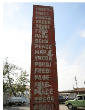
The first field site: The local market and Soviet period monument with the word 'peace' in many languages.

Due to the fact that Kyrgyzstan was a new fieldwork area for me, the first fieldwork location was my initial entry point into the field, a town to which my pre-fieldwork networks and connections gave me access. This was a town with a population of 7,000, and it was located approximately three kilometres from the Kyrgyz–Uzbek border. The town was established in the 1950s in connection with the construction of a hydropower plant near it. This large-scale construction project engaged a large work force recruited from all over the Soviet Union, creating an ethnically diverse population. Yet, today the population is overwhelmingly Kyrgyz in its ethnic composition. The town has a small market, schools, kindergartens, library, police station, bank office, several shops and other service facilities. My hosts during the stay in the town were ethnic Kyrgyz, which limited my interactions and restricted my access to the local Uzbek community. The inter-ethnic violence that occurred in the area in 2010 had left its marks as tensions and resentment between the two ethnic groups in the town were still felt and also expressed by my Kyrgyz interlocutors. Therefore, while staying there, I pursued the possibility of changing the fieldwork site to allow me greater access to the Uzbek