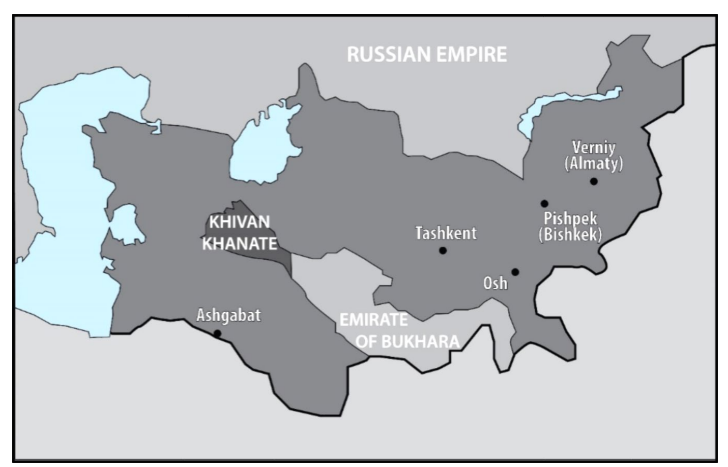
An illustrative map of Turkestan by 1990. Illustration by Nina Bergheim Dahl.

After the imperial conquest of the region, some of the political entities, such as the Bukhara Emirate and the Khiva Khanate, remained as distinct political units within the Russian Empire, while the rest of the territories were incorporated into the Turkestan Governor-Generalship, which was established in 1867 with Tashkent as its capital. In the coming years, numerous other administrative reforms were implemented in the region, redividing the region into gubernyas (regions), which were sectioned into oblast (provinces), districts and subdistricts. Following the fall of imperial power in 1917, Central Asia was torn by a violent power struggle as various groups attempted to establish their own political centres and systems of governance within smaller territories. A civil war ensued which lasted for several years until the Bolsheviks gained control over the region in the 1920s. Thereafter, the Soviet authorities set in motion new policies aimed at recreating and modernising the region, transforming both the land and the peoples according to the Soviet promoted ideology. The region was completely reshaped by the establishment of new administrative territorial units, which today represent the independent nation-states of Central Asia.