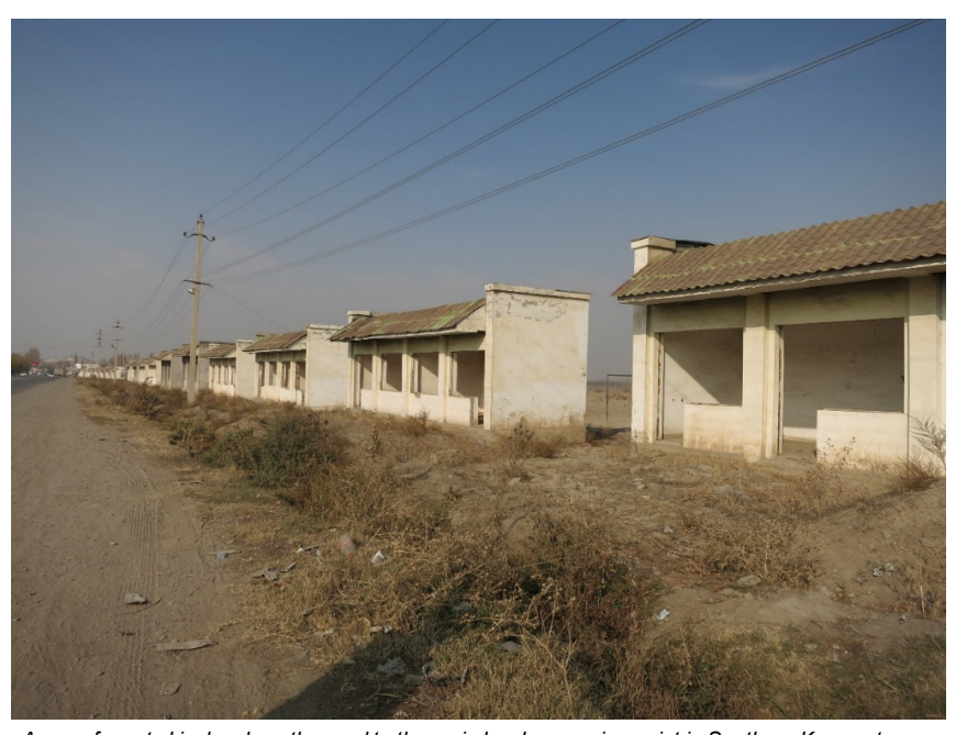
A row of empty kiosks along the road to the main border crossing point in Southern Kyrgyzstan – Do'stlik.

funerals, and for persons who were married to the citizens of the other neighbouring country. The crossings consisted of long journeys as only a few border posts were opened, demanded certain paperwork and would often involve bribery. The extensive cross-border kinship networks and the frequent cross-border communication via phones and along the border fences depicted the wide social worlds of borderland inhabitants, spanning across the landscape divided between the neighbouring states of Kyrgyzstan and Uzbekistan. Likewise, the existence of cross-border bridges, road networks and markets located on the border, but no longer in use, indicated the former connectedness of these borderlands. Yet, the depilated state of the connecting infrastructure and its abandoned state were the visible marks of the current restrictive policies governing cross-border economic and social life.