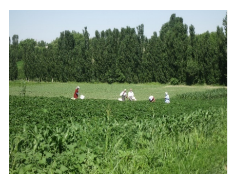
Local villagers working in the fields at the second field site.

The second fieldwork site was an exclusively Uzbek village located on the border itself. The village consisted of approximately 45 households; however, it used to be much larger, but became divided into two parts by the now established international border. Just across the border one could see the other part of the village that today is located on the territory of Uzbekistan, separated from the Kyrgyz side by the barbed wires and trenches of the borderline. The division of the village meant that, after the closure of the border, the Kyrgyz side had to establish a new school, medical clinic and cemetery on their side of the border as these facilities ended up being in Uzbek territory and became inaccessible to them. In addition, the village also had one small shop that provided locals with a selection of essential food products. All the inhabitants were engaged in agriculture and farming, which were their main sources of income, in addition to the remittances from those who had travelled to work in Russia and Kazakhstan. This second site turned out to be a very fortunate, productive and valuable fieldwork location for several reasons. Firstly, it allowed me to observe everyday life in a place where the consequences of the new militarised border regime had such a profound effect as the village itself became divided in two. Secondly, it not only gave me access to an Uzbek community, but also put me in direct contact with stateless