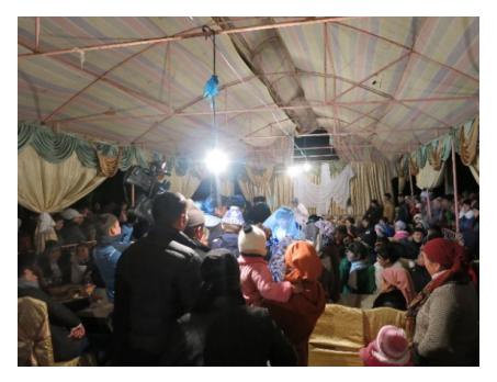
Wedding in the village.

In contrast to these formal interviews, life at the field site locations involved a different type of data collection techniques, namely practices associated with participant observation. Alpa Shah (2017, 48) has asserted that 'participant observation is not merely a method of anthropology but is a form of production of knowledge through being and action'. This 'being' in the field, immersing oneself in the lives of people, was filled with daily activities that varied from season to season: from lying on a toshok <sup>15</sup> (thick, double-sided quilt) in the coal heated rooms during the cold winter months and watching old Indian movies broadcasted by Uzbek channels with the family's grandmother, to joining younger women in their work in the fields during the scorching heat of the summer months, and all the mundane everyday activities in between. Likewise, attending important life events such as weddings, funerals, and important celebrations as Nooruz <sup>16</sup> (new year/spring festival) were all important events that gave me an understanding of the people's social worlds and their lived environments.