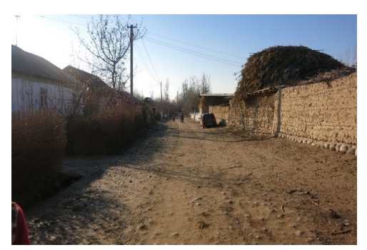
Village road at the second field site.

community and put me in more direct contact with Uzbeks. After a period of two months, I was finally able to relocate to another village through one of my new acquired interlocutors employed in a non-governmental organisation working on statelessness.