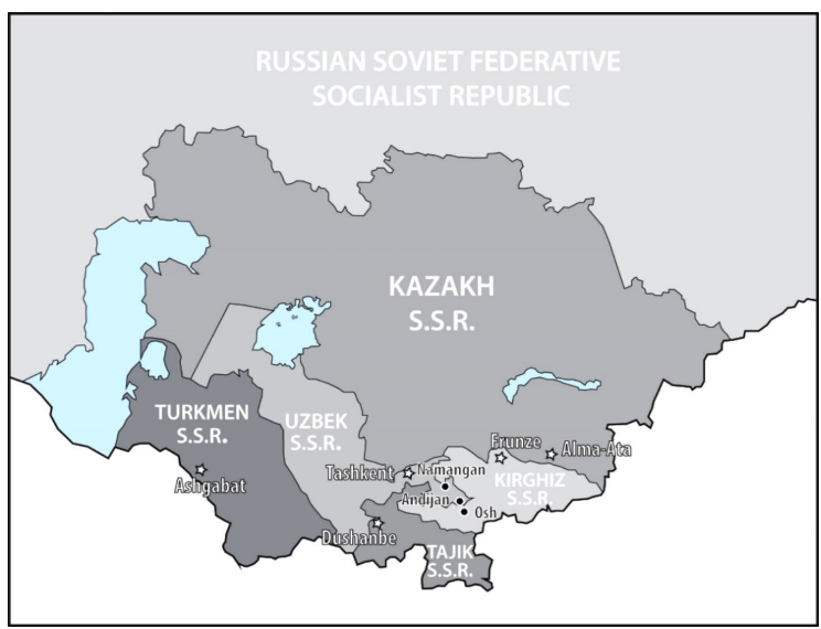
An illustrative map of Soviet Socialist Republics in Central Asia by 1936. Illustration by Nina Bergheim Dahl.

The National Territorial Delimitation process changed not only the administrative and territorial division of the region, but it had a far-reaching impact on the political and social worlds of the people of Central Asia by transforming people's identification practices. While designations such as 'Kyrgyz' and 'Uzbek' were not completely new creations, their usage and conception were fluid and contextual (Megoran 2017). The meanings of these designations were to change along with the Soviet policies of creating nations. The category of Uzbek provides a telling example of this. Grigol Ubiria (2015), in exploring the making of the Uzbek nation, has noted that the term 'Uzbek' became actively used by a special Turkestan commission (Turkkomissiia) that was established in 1919 by Lenin to work out proposals for ethnoterritorial divisions of the region. 'Under "Uzbeks", the members of Turkkomissiia supposedly referred collectively to an urban and sedentary Turkic (and possibly some "Farsi-Tajik")-speaking population of the TSR [Turkestan Socialist Republic], such as those who (or whose predecessors) were defined in the 1897 imperial census as Sarts, Uzbeks and Tiiurks. (...) Later the term "Uzbek" was also formally approved by the central Bolshevik government in Moscow as an ethnonym