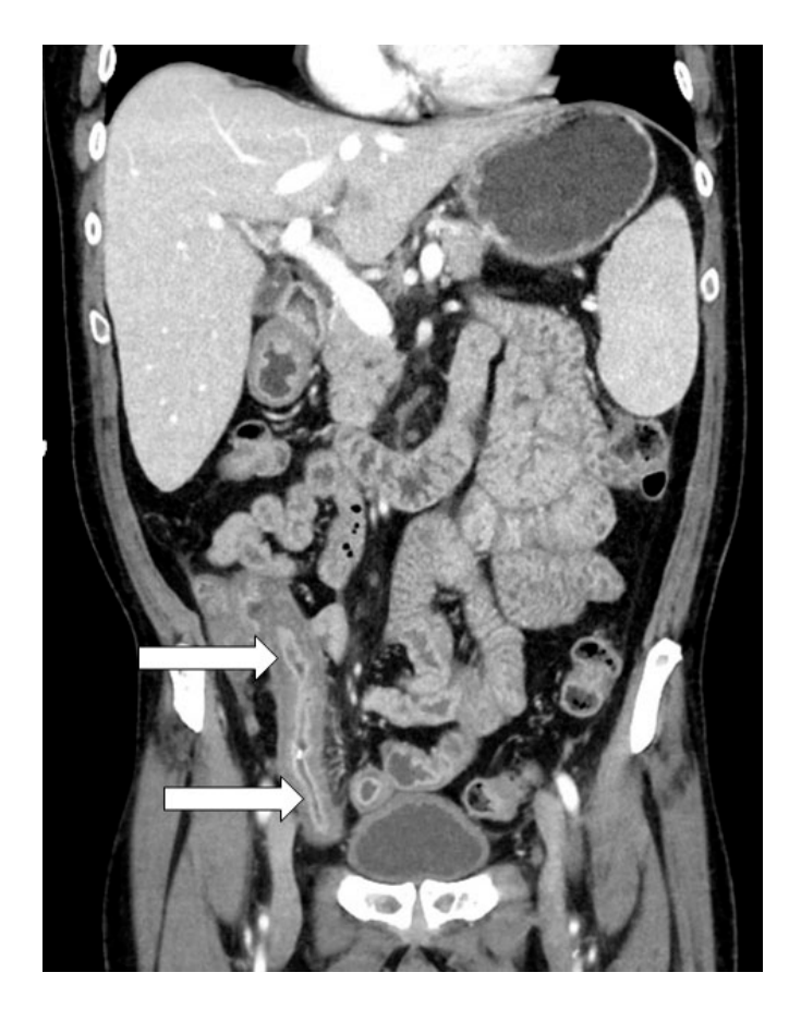
Figure 3. Abdominal computer tomography (CT) scanning. CT image in the coronary plane demonstrating segment of terminal ileum with thickened wall (arrows).

Based on these findings and given the lack of effect of both conventional immunosuppressive treatment and antiviral treatment, and the potential risk of both bacterial and fungal infections with utterly escalation of immunosuppressive treatment, the patient was accepted for surgical intervention. He underwent surgery with laparoscopic ileocecal resection with intracorporeal anastomosis at day +250 posttransplant. The pre- and postoperative courses were uneventful. The surgical intervention had a striking effect on the patient's abdominal pain, and he could shortly after surgery start taper of opioid analgesics. The patient, however, had persistent diarrhea with loose and frequent stools. On pathological assessment, the resected bowel segment demonstrated active inflammation and signs of active CMV disease (Figure 4), despite no increase in CMV-DNA copies in serum by PCR analysis. Following this evaluation, valganciclovir was reintroduced and immunosuppressive treatment taper was initiated. Both cyclosporine and budesonide could be gradually reduced and terminated before day +400 (Figure 1). The treatment had a striking effect on the patient's clinical conditions with normalization of bowel function, and total regression of abdominal pain. He is currently being followed up at an outpatient clinic and has no signs of recurrence, MDS, CMV, or active GVHD 15 months after the transplant procedure.