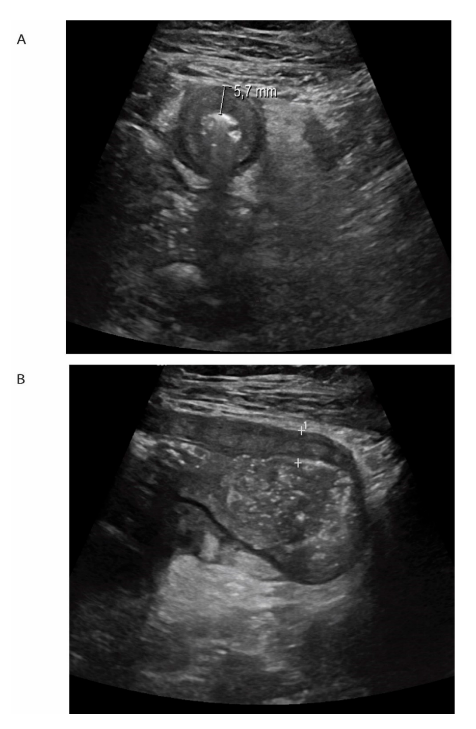
Figure 2. External abdominal ultrasound (US) of the terminal ileum. ( A ) External cross section of terminal ileum with thickened wall (5.7 mm) and "creeping fat" surrounding the small intestine circumference. ( B ) External US of longitudinal/oblique section of the terminal ileum, the bowel wall is markedly thickened, although the mucosa layer is intact. Lumen diameter is wider towards the right indicating a prestenotic dilatation. "Creeping fat" seen below the bowel segment as a hyperechoic area.