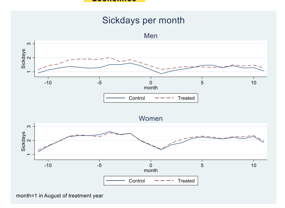
FIGURE 1 Mean number of sickdays per month, by treatment status and gender [Colour figure can be viewed at wileyonlinelibrary.com]