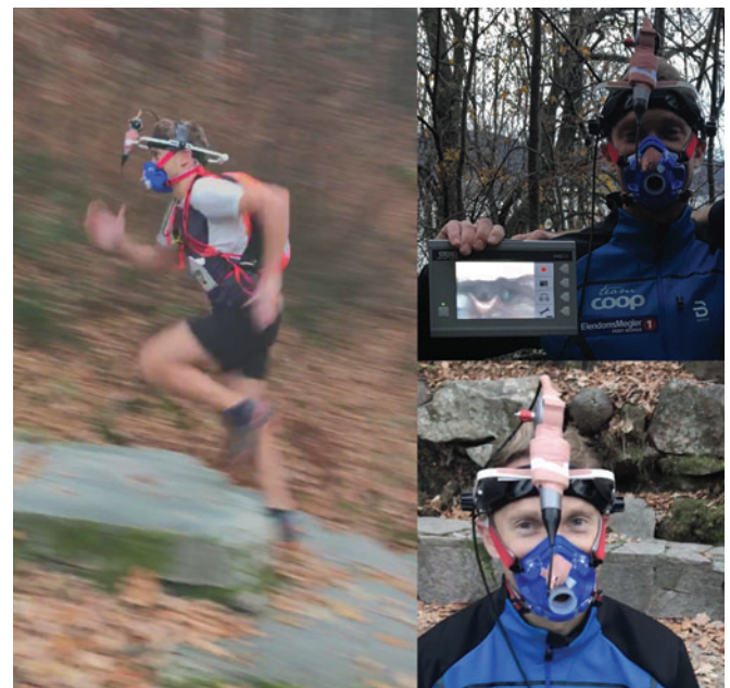
Figure 1 The participant at rest and running with the portable video-laryngoscope attached. The monitor shows the video-recording of the laryngeal area (upper right image).

Normally distributed data were presented as means with SD and skewed data as median with ranges. Intraindividual changes in spirometry values were calculated using