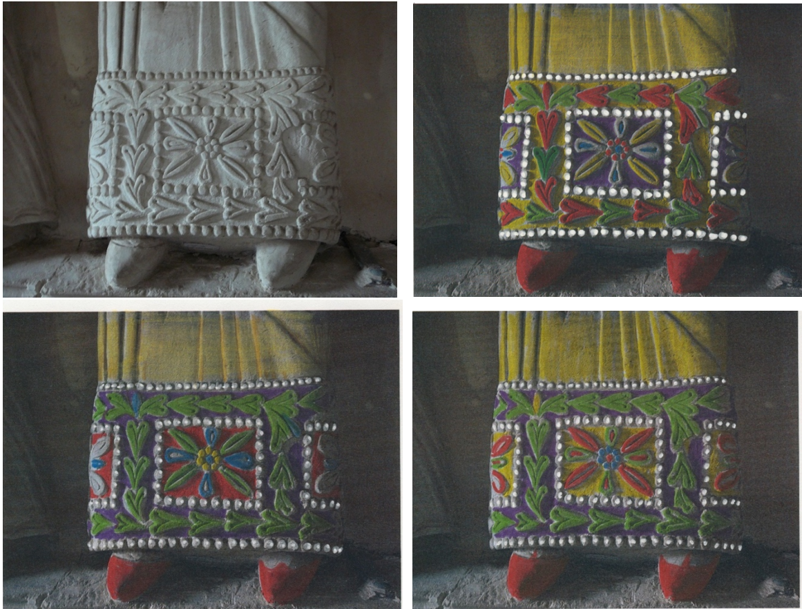
Fig. 11a-d Tempietto Longobardo, Cividale. Suggestions of colours for hemline of saint 'E'. Photo: Bente Küllerich 2010 and colour drawing 2019 ©.

blue semi-precious stone gives a general idea of a Longobard jewelled aesthetic. 38 The pierced earlobes indicate that the finishing touches would have included the insertion of earrings. These accessories must have been in a Byzantine style to match the richness of the garments. Bronze wire with pendants of semi-precious stone or glass, a material used in the ornamental stuccoes, could give the impression of earrings with precious stones. 39