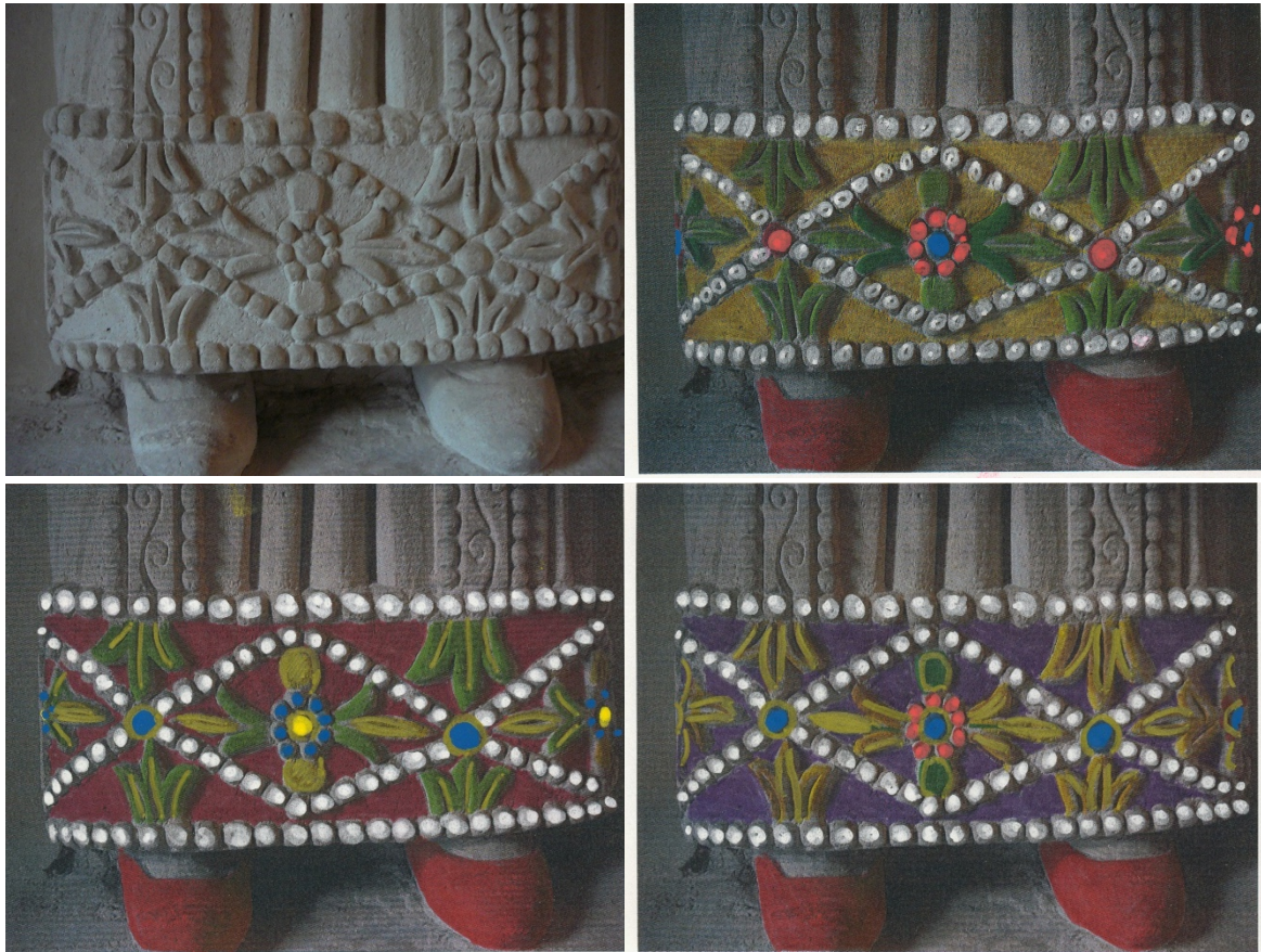
Fig. 10a-d) Tempietto Longobardo, Cividale. Suggestions of colours for hemline of saint 'B'. Photo: Bente Küllerich 2010 and colour drawing 2019 ©.

Even with a limited palette of four to five basic hues – yellow, red, blue, green, purple – the potential combinations are more numerous than the hypothetical reconstructions show. The pearls were certainly white and must have closely followed the schema of the wall paintings, where white pearls are visible on, for instance, the gospel book held by Christ and on his nimbus. As for the shoes, these were undoubtedly red, the ubiquitous choice for high-status footwear in Byzantium.