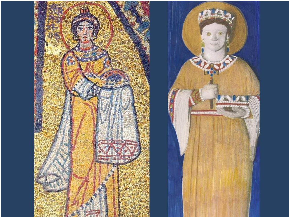
Fig. 8 San Zeno chapel, Basilica of Sa Prassede, Rome. Sa Prassede. Tempietto Longobardo, Cividale, hypothetical reconstruction of saint 'E'. Colour drawing, Bente Kiilerich 2008 ©.

in mosaics from Rome and Ravenna, female saints are often dressed in golden garments, a striking example being the procession of holy women in the nave of Sant'Apollinare Nuovo, c. 560. Closer in time to the Tempietto, saints in Sa Prassede, Rome, c. 810, don yellow attire (Fig. 8). Since the designs worn by 'B' and 'E' differ, they plausibly also differed in colour. This means that if one of these saints wore a yellow tunic the other may have sported another bright hue. Dalmatics with clavi are often depicted white with dark bands. In that case, the stucco would have been covered with a layer of chalk white and polished. White does not mean colourless, as the hue ranges from what the medieval viewer might have seen as albus , candidus , niveus or lactus . Light yellow, mixed from ochre and chalk white, or the red ochre used in the wall paintings could also have been chosen. Finally, although I find purple less probable, it is worth calling attention to the purple dalmatic with floral clavi worn by the lady next to Theodora in the San Vitale