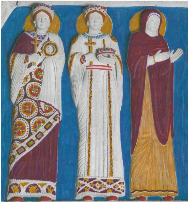
Fig. 7 Tempietto Longobardo, Cividale. Hypothetical reconstruction of polychromy on saints 'A', 'B' and 'C'. Photo: Colour drawing, Bente Küllerich 2008 ©.

Another possibility is a combination of purple and yellow. In the mosaics of the cathedral of Euphrasius at Porec, c. 550, John's mother Elizabeth is represented in a yellow mantle and purple tunic. If depicted in contrasting colours rather than sharing a single hue, it was easier to tell the two dress items apart (Fig. 7). A purple palla and yellow dalmatica is a combination seen for instance in Sa Maria Maggiore in Rome. 32