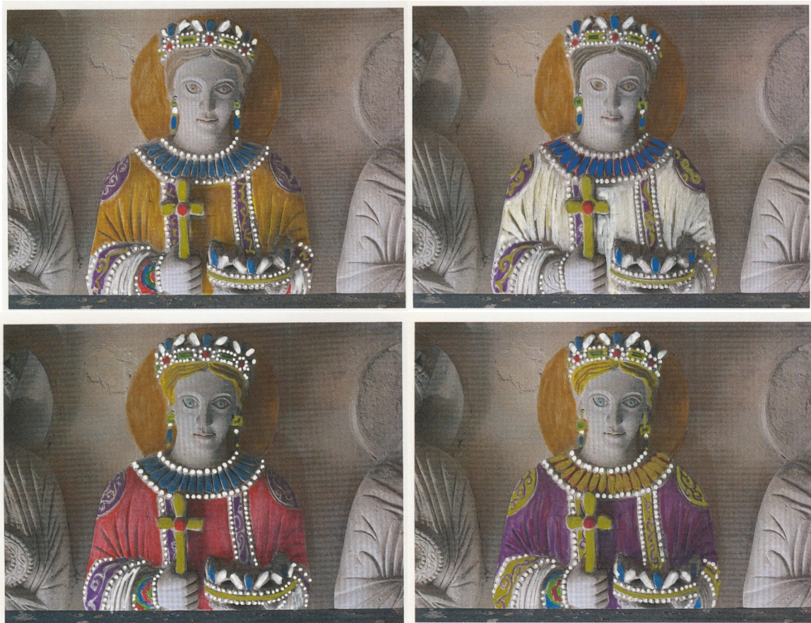
Fig. 9a-d) Tempietto Longobardo, Cividale. Hypothetical reconstruction of polychromy on saint 'B': yellow, white, red and purple versions. Photo: Bente Küllerich 2010 and colour drawing 2019 ©.

mosaic. In fact, white, yellow, red and purple are all likely hues, which are also attested in the wall paintings (Fig. 9 a-d). 36