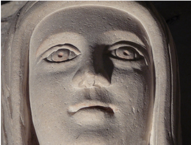
Fig. 4 Tempietto Longobardo, Cividale. Close-up view of saint 'C' showing red on lips and eyes.

ground in higher relief than the body; a characteristic trait is a slight tilt of the head. When the figures had been modelled, surface details, such as the pearls that line ornamental bands and insignia, were plastically added and the patterns on garments were incised with a pointed instrument (Fig. 3). 13 While marble glimmers, plaster tends to be dull, and the Tempietto saints, although impressive for their sheer size and solemn demeanour, lack a vital element: colour. To brighten the dull, grainy surface of the stucco, the figures must have been painted. 14 The use of paint, and perhaps gilding, would have made for a rich and varied surface texture.