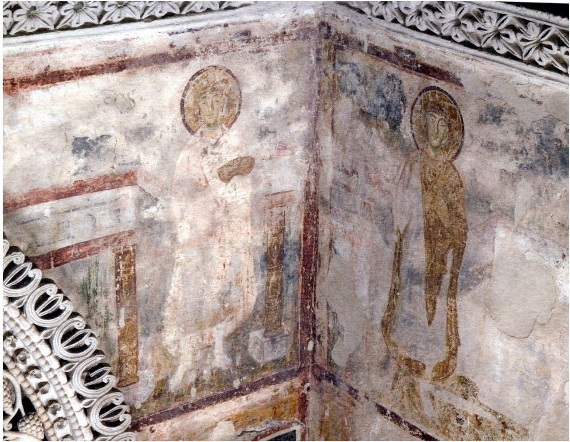
Fig. 6 Tempietto Longobardo, Cividale. Wall painting, two male saints, NW corner.

As far as one can tell, the prevailing clothing colours on the walls are yellow and purple (of which the reddish hue is better preserved than the bluish hue): a dark red purple for the Virgin's palla , a medium red-purple for Christ's pallium and for the chlamys of the soldier saint on the north wall. Reddish purple is also used for clavi . In addition to the artists' obvious interest in chromatic variation, with no two saints being identically dressed, it is noticeable that the individual parts of the outfits were originally endowed with various kinds of ornaments: this is still faintly discernible in the yellow border appliqué that lines the side and hem of one tunic.