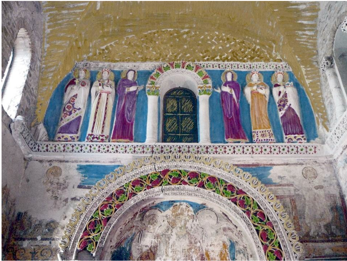
Fig. 12 Tempietto Longobardo, Cividale. West wall of aula with hypothetical polychromy. Photo: Colour drawing, Bente Küllerich 2008 ©.