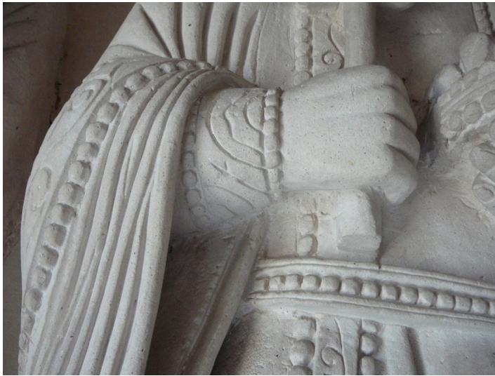
Fig. 3 Tempietto Longobardo, Cividale. Detail of saint 'B'.