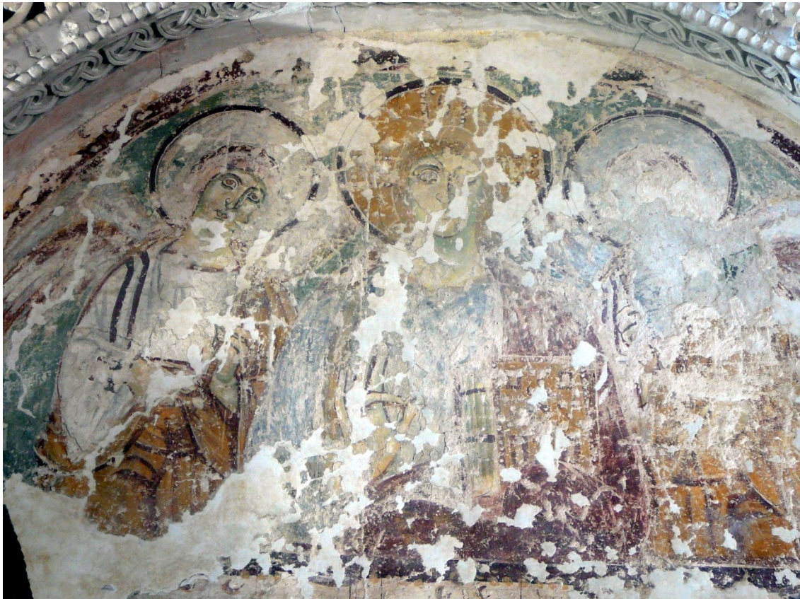
Fig. 5 Tempietto Longobardo, Cividale. Wall painting, Christ and archangels, west wall.

is that most pigments have faded. Moreover, in the instances when stuccoes do show vivid colour, this has often turned out to be the result of modern restoration. 18