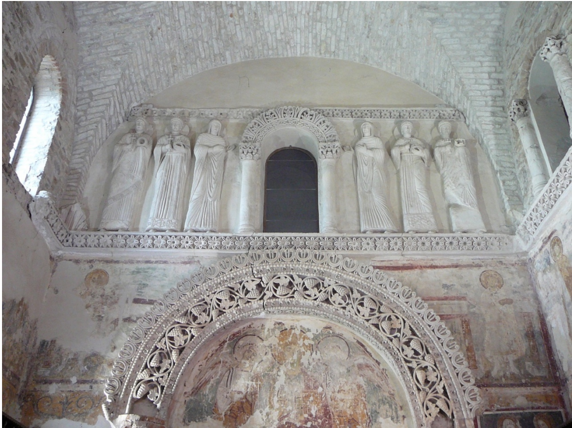
Fig. 1 Tempietto Longobardo, Cividale. West wall of aula with the six stucco figures above painted lunette of Christ in a vine-scroll frame.

The Tempietto Longobardo consists of an aula covered by a groin vault and a lower presbytery covered by three parallel barrel-vaults. The interior of the chapel is lavishly decorated in various artistic media: architectural sculpture, including spolia, a black and white opus sectile pavement, wall revetment in marble, wall paintings as well as figural and ornamental stuccoes ( Fig. 1 ). Fragments prove that, in addition to the six female stuccoes that flank the window of the west wall of the aula, two further series, each consisting of three figures, occupied the space between the windows of the north and south walls, thus giving a total of twelve saints. 4 Scattered tesserae indicate that mosaics decorated the vaults of the presbytery and the aula.