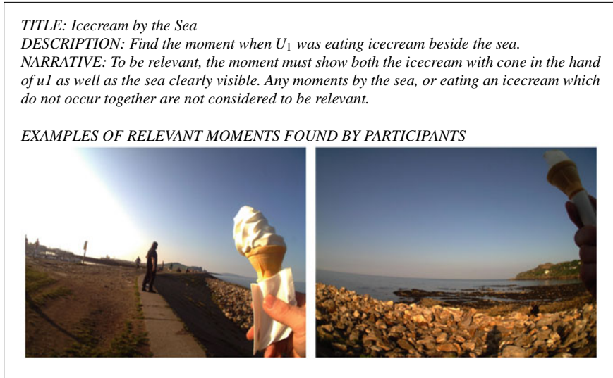
Fig. 13.3 LSAT Topic Example, including example results

used. Participants were allowed to undertake the LAST subtask in an interactive or automatic manner. For interactive submissions, a maximum of five minutes of search time was allowed per topic.