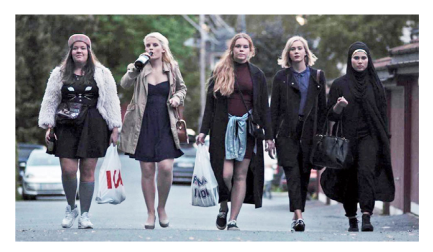
FIGURE 2. The five girls who are at the center of SKAM 's fictional world are very frequently shown in group shots. Eva, Noora, and Sana (the three girls on the right) each have a season dedicated to their stories, while Chris and Vilde, on the left, also have important roles.

when she goes into a room by herself to pray during a party, as well as in the meeting with the PepsiMax Girls (Figure 4).