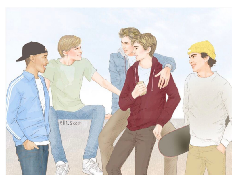
FIGURE 11. Fan art by @elli_skam.

Other forms of metalepsis in SKAM occur when material created by fans is validated by the actors or creators referencing it in their extradiegetic posts and when fan material is integrated into the core