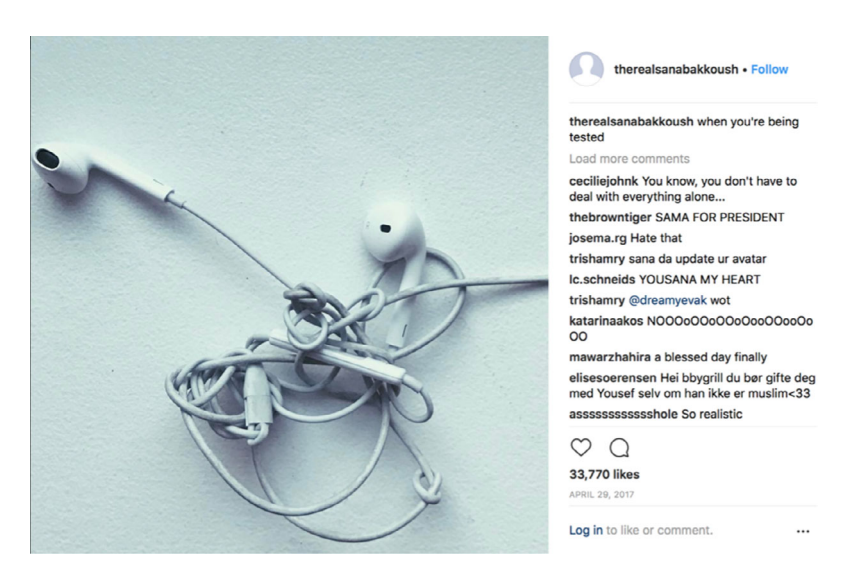
FIGURE 9. Instagram post by Sana (@therealsanabakkoush) on 29 April 2017.

(Figure 9). This metaphorical use of social media is known as social steganography (boyd; Marwick and boyd), and is a common strategy used to share information with close friends without making the topic obvious to everyone else. Viewers of SKAM knew exactly what Sana was referring to, of course, and would thus feel included, as though they were close friends. The familiarity of the rhetorical move has a secondary effect too: By mirroring the viewers own social media practice, the fictional world seems to melt into the viewers' actual world.