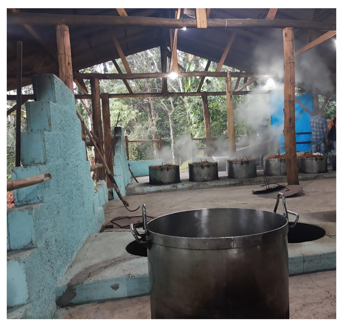
Figure 8. Casa do Feitio, where the liana is shredded and the daime is cooked by men.

He uses a long stick to stir the leaves and vines, poking the mass with a slow, careful force in the casseroles to get the juices from the plants into the brew. After doing this, a man with a long metal pole accompanied by another man goes on each side of a casserole and stick the pole through two metal holes on the top. They brace themselves before carrying the heavy, boiling brew to a filtration station. The filtration station is a big metal slide with two metal hooks serving as breaks on the sides and a net on the front. Another man has put a new casserole underneath the slide and the two men carry the full one and manage to flip it on the side. The breaks hold the casserole in place as the brew pours out leaving all the leaves and shrubs of vine behind in the net.