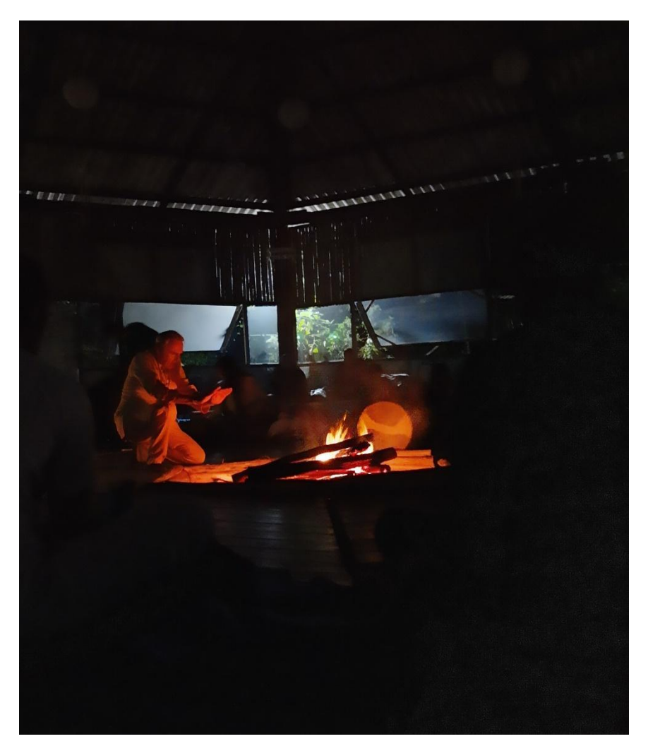
Figure 2. Lead shaman performing a ritual by the fire inside the church.

When I approach the station I have butterflies in my stomach, I am excited and afraid of what is to come. Jon looks at me with a soft smile and measure a cup according to my size. As I sit down, I watch the musicians on stage who are performing songs while everyone who wants or knows the lyrics can join. I was told that sitting straight is best for the body to tackle the effects, so I do. A couple in front of me are placing crystals and instruments I have never seen in front of them. As the ceremony goes on, they use the instruments and stones in various ways, like placing the crystals on parts of the body or using the instruments to produce enchanting sounds. After a while I start to get cold and lay down under my sleeping bag. Just a minute or two after I can sense the effects coming. Slowly my body starts to tense, and my legs start to shake. I look around, a bit worried as I do not know what to do. I mimic the