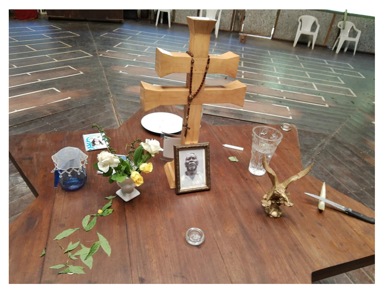
Figure 4. Mesa inside the salon in Céu de Estrela. Photo by author.

Around the table are a few chairs for the musicians, the Padrinho and the Madrinha. In Céu de Estrela, the Padrinho often played the drums accompanied by 3-6 other musicians, often men. On the floor there are marked up squares in six sections around the mesa (see figure 4). People are placed hierarchically according to affiliation, position, age, and height. Facing the table on either side the juniors are on the left, middle raged in the middle and seniors on the right. In the front stand the people who have attained the star, meaning they have received a star medal and become a fardado (uniformed member), but positioning depends on seniority. To become a fardado means that one has more responsibility and is obligated to be of service to others if needed during works. This does not include the fiscais , the assigned helpers during ceremonies who do not ingest the daime. There are usually two women on the women's side and two men on the men's side depending on the size of the group. The placement on the