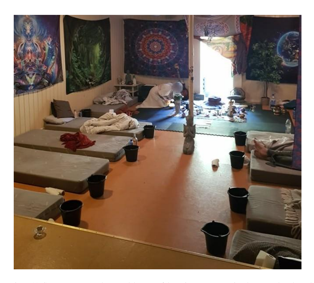
Figure 11. Ceremony room on the second day, one of the assistants are preparing the room.

colors, artwork of "psychedelic" art, the Indian god Shiva and green forests. I am transported to a place not resembling Norway. It reminds me of pictures from shamanic ceremonies in the Amazon and from retreat centers (see figure 11 below).