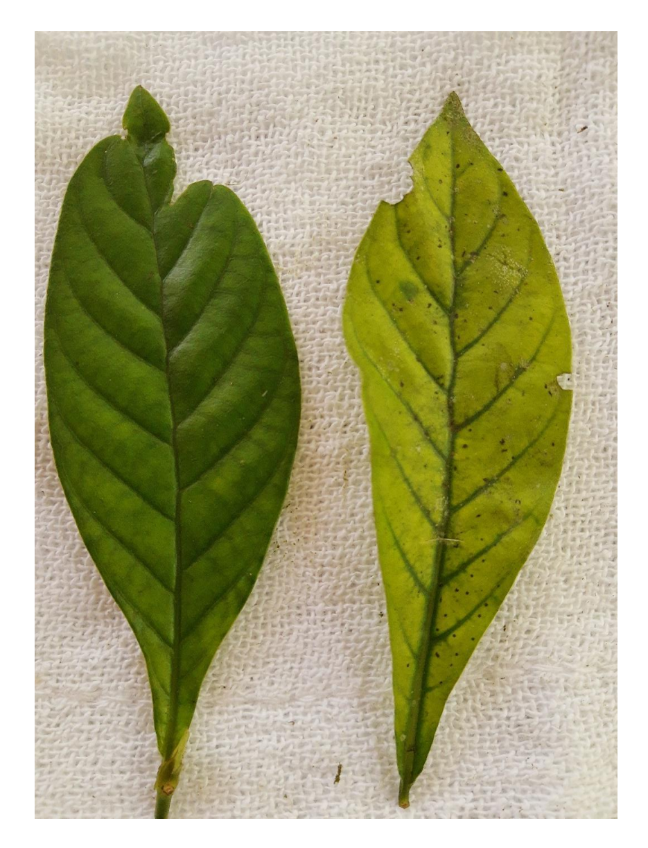
Figure 7. Leaves of the Psychoteria Viridis, "Chacruna".

look at every leaf and clean them. We are to use our hands as much as possible but get a cloth to wash the worst parts off.