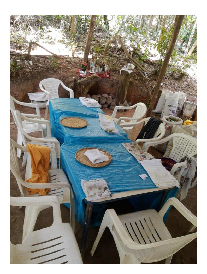
Figure 5. Working area for cleaning the leaves.

in the forest is a small roof supported by six beams. A table made up of different smaller tables in plastic, covered by plastic drapes. Around, there are chairs. Behind the table, in the center of the back there is an altar (see figure 5 on below). The ground has been carved out in the hillside so the alter is leveled at hip height. There are pictures of master Irineu, Padrinho Sebastião, an angle statue, candles, and Palo Santo. Palo Santo is the bark of a sacred tree native to South America, it is used as incense, for cleansing and to get rid of bad energies. Beside the altar is a tall, small table with a carafe containing the medicine. At the far end in front of us, on the left side of the little shack, are books for writing our names and how much work we manage to get done each day, a trash can, and more chairs.