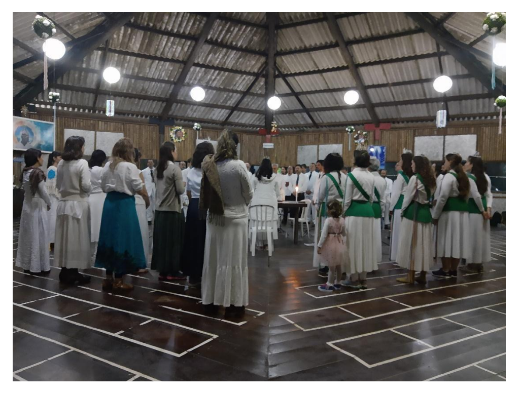
Figure 9. Hinario with baptism and receiving of the Star.

often helped by the other members. There is little or no talking, and everyone are focusing and preparing for the work ahead.