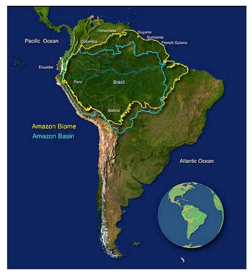
Figure 3. Scope of the Amazon.

The deforestation and destruction of the rainforest have naturally become a core issue for its many inhabitants. Their livelihood and quality of life is ruled by the rainforest, which is a harsh environment in itself. When deforestation occurs, it puts indigenous and people living in the Amazon at risk for losing their livelihood and quality of life. The anthropologist's interest in the Amazon has been highly focused on the indigenous, but throughout the 80s, scholars took upon themselves to challenge this view by doing research on other groups in the area (Parker 1985:xviii).