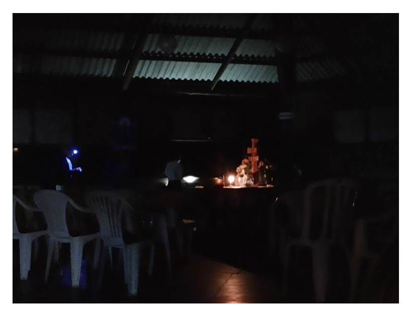
Figure 10. In contrast to other works, Concentração is conducted in darkness.

This was the first ritual presented to Mestre Irineu and is held on the 15th and 30th of each month. For this work it is common to sing a collection called The Concentration (Concentração), which begins with three Our Father's, three Hail Mary's and Key of Harmony (prayer) and Prayer, a collection of hymns associated with the Prayer ceremony (not an official work) (Santo Daime e, n.d.). But in contrast to other rituals, chairs are placed in each square on the floor, where people sit in the first part of the ritual in darkness in meditation with just a few candles lit (see figure 10). In Concentração the farda azul (blue uniform) is worn. Everyone rises and stands still for each hymn. The second part can then be directed by the commander who decides what hymns should be sung and weather there should be dancing or not. The only Concentration ritual I took part in in Brazil ended with lights on, bailado and hymns.