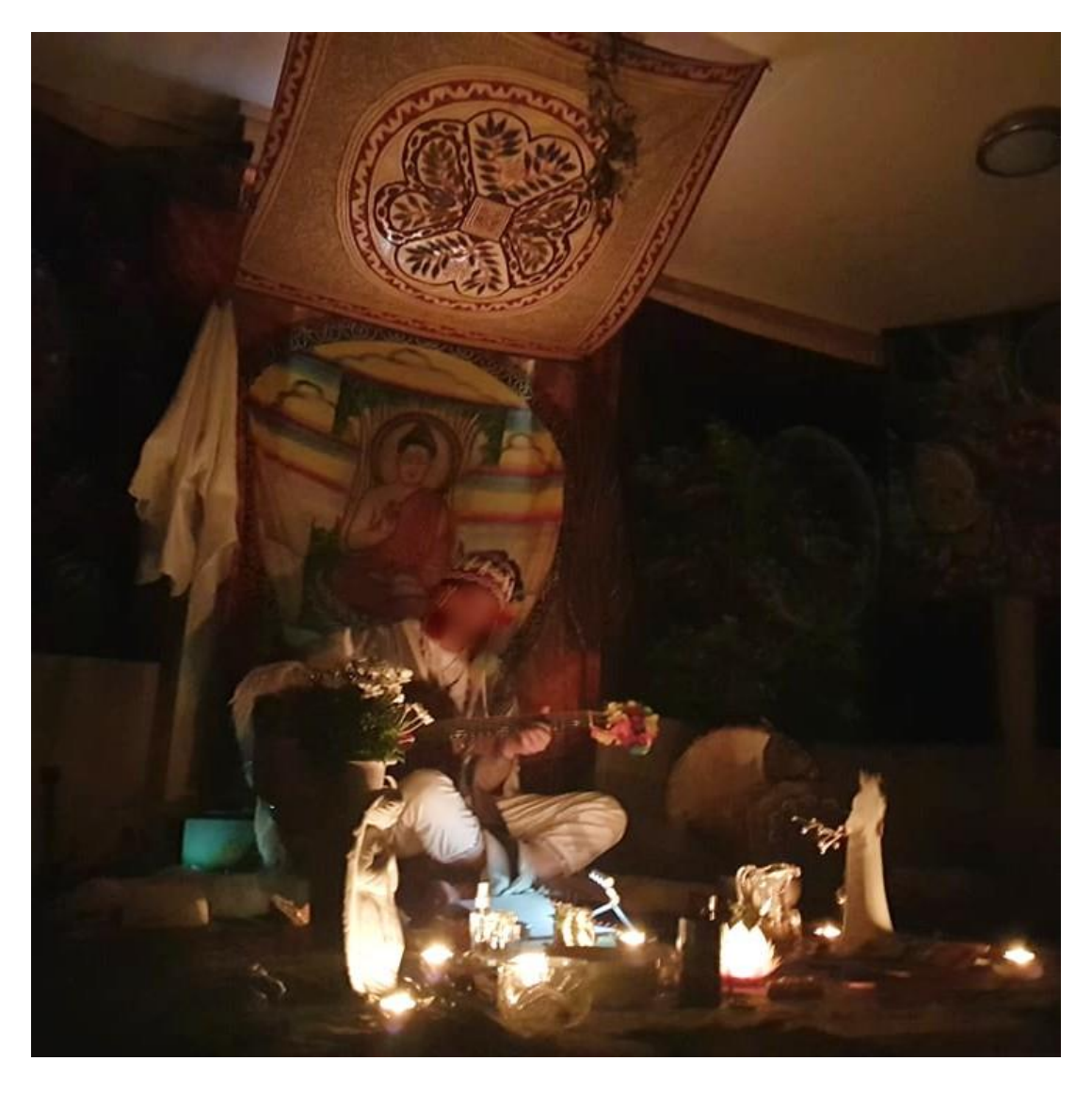
Figure 13. Frank playing during ceremony.