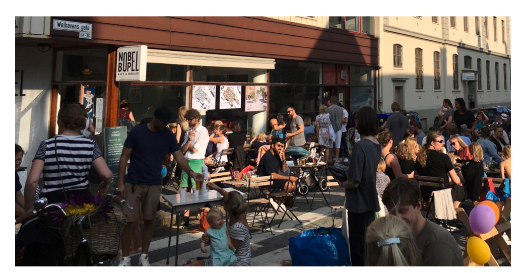
Fig. 3. Residents enjoy the street life offerings of Møhlenpris.

The Zero Growth Objective exercises agency beyond the incentive of securing funding – Bergen has sharpened the target in its Climate and Energy Action Plan, which aims for a 20 percent reduction in automobile traffic by 2030. When interviewed, three senior planners responsible for the municipal spatial plan – one of the city's chief tools to steer development – explained that the ZGO is "a very useful tool for us. It sets the premise for the municipal spatial plan and lays the foundation for other guidelines". Asked if the target should be changed to zero emissions instead of zero growth in the number of private vehicle miles as some actors at the national scale have proposed, they responded "that would be catastrophic", anticipating that rapid growth in electric automobiles would crowd out public space. A representative of Bergen's Agency for Urban Environment expressed frustration that while the Norwegian Public Roads Administration took part in UGA negotiations, their large road projects into Bergen undermined the city's efforts.