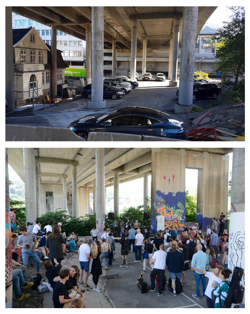
Fig. 1. (a) and (b). A planner highlighted the 'Under the Bridge' festival in Møhlenpris as reclaiming public space for people, showing these 'before' and 'after' photos.