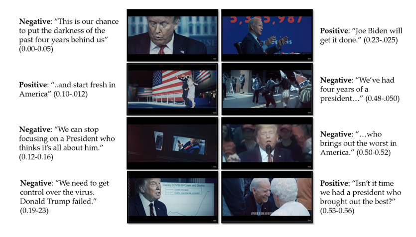
Figure 3. Screenshots from the 'Fresh Start' advertisement from the Biden campaign. Note the quick movement between positive and negative tone.

a positive message about Biden and a negative message about Trump (see Figure 3). Moving from one emotional appeal to another is common in political advertising, where it is known as the 'wheel of emotion', which 'begins with symbols and sounds relating to uncertainty or even fear, and moves across an arc of emotions to a positive resolution at the end in the person of the candidate' (Kern, 1989: 133). Central to this rhetorical approach, however, is the move from a pure negative feeling to a pure positive feeling. The continuous mixing of emotional appeals in 'Keep Up' and especially in 'Fresh Start' establishes an emotional incongruity in the advertisements that our informants recognized. Furthermore, the textual multimodal incongruities , where mixtures