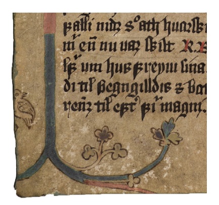
Figure 5: AM 138 4to, f. 14v (Detail): Jónsbók. 1500. Reykjavík, Stofnun Árna Magnússonar í íslenskum fræðum.