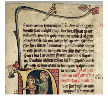
Figure 6: AM 227 fol., f. 38r (Detail): Stjórn. 1350. Reykjavík, Stofnun Árna Magnússonar í íslenskum fræðum.

resemblances as regard to their mise en pages and size. Either way, according to Guðbjörg, they have loose links to the yet unlocated workshop at which the C-painter of the famous Icelandic sketch book AM 673 a III 4to (Íslenska teiknibókin) worked.<sup>60</sup> Like other illuminators from the fifteenth century, the C-painter mainly draws on iconographic models known from previous centuries.<sup>61</sup>