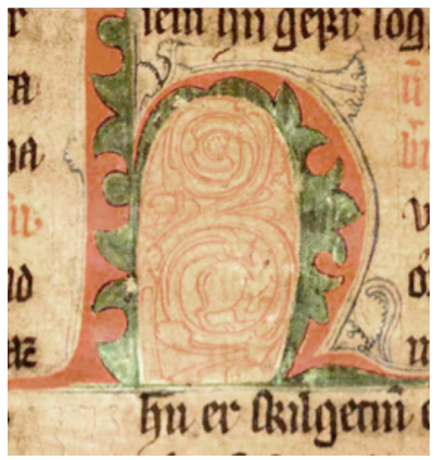
Figure 4: AM 343 fol. (Svalbarðsbók) (Detail), f. 33r: Jónsbók. 1330–40. Reykjavík, Stofnun Árna Magnússonar í íslenskum fraðum.