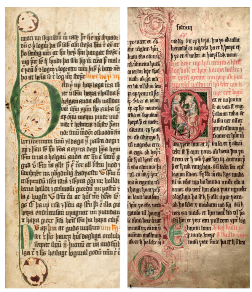
Figure 1: AM 132 4to, f. 5r: Jónsbók. 1450–75. Reykjavík, Stofnun Árna Magnússonar í íslenskum fræðum.