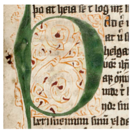
Figure 3: AM 132 4to, f. 5r (Detail): Jónsbók. 1450–75. Reykjavík, Stofnun Árna Magnússonar í íslenskum fræðum. Image: Jóhanna Ólafsdóttir.