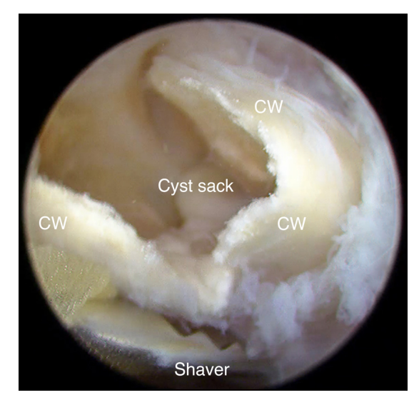
Fig 7. The cyst wall (CW) is thick, but easily removed with a 3.5-mm (aggressive) shaver starting from the top and moving gradually toward the base of the cyst. For best effect of the shaver, the cyst wall is trapped against the underlying bone by a light pressure (downwards) while the shaver oscillates.

We recommend removing all loose fragments, but not to remove larger deeper parts of the screw that seem relatively intact and still fixed/stuck inside the canal. The inside of the canal is covered with a thin layer of soft tissue and we have not observed sign of bony ingrowth into the screw (remnants) (Fig 12).