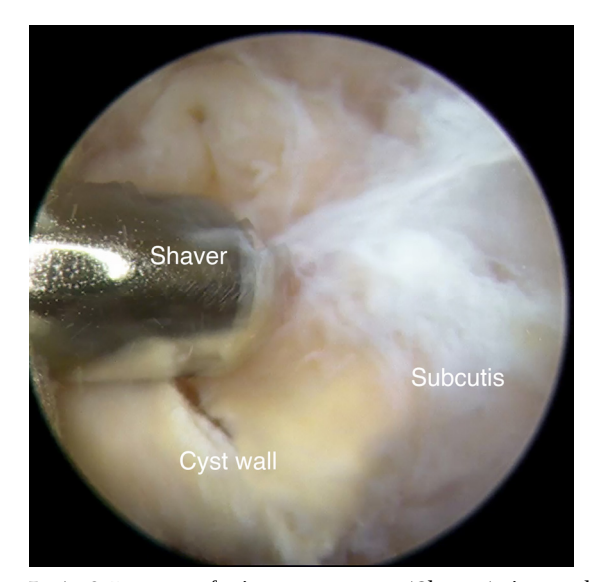
Fig 5. A 3.5-mm soft-tissue resector (Shaver) is used to dissect through the subcutis toward the tibial cyst. The cyst wall (capsule) is seen as a fluctuating yellowish structure bulging above the surrounding bone surface and is wider than the underlying bone canal.

The softness and fragility of the material of the partly absorbed interference screw make it easy to remove the loose pieces with an aggressive soft-tissue resector. When the cyst and contained screw fragment have been removed, the canal should be examined for loose screw fragments (Fig 10). Loose fragments within the canal are removed by the soft tissue resector placed into the canal (Fig 11). Be prepared to move the resector out of the canal to get a visualization of the effect every few