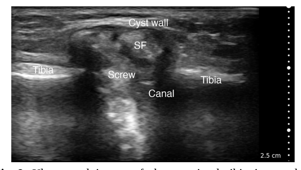
Fig 2. Ultrasound image of the proximal tibia in another patient having undergone the same procedure as the patient in Figure 1, only 5 years earlier (using the same implant, a BIOSURE 9 \times 30 mm). The transducer is placed vertically on tibia, centred on the painful swelling. The bioabsorbable interference screw (Screw) is partly absorbed and broken into at least 4 screw fragments (SF). The head outside the canal is surrounded by a cyst-like structure with a well-defined cyst wall.

The thick-walled cyst is then gradually removed by the oscillating shaver, starting from the top and moving gradually toward the base (Fig 7, Video 1). Alternatively, a large basket punch, e.g., the ACUFEX oval punch (Smith & Nephew), may be used for removing the cyst wall. Larger pieces, especially inside the tunnel,