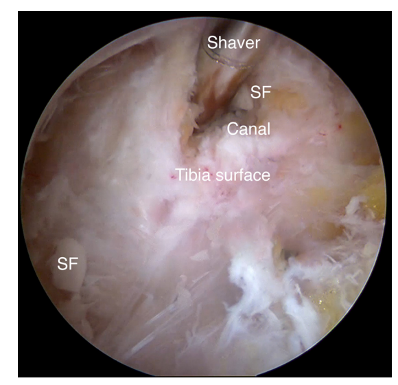
Fig 11. A small (3.5-mm) soft-tissue resector (shaver) is used for removing all loose screw fragments (SF) within the canal. The image shows the shaver tip inside the tunnel. For best visualization, the shaver should be pulled out of the canal every few seconds as the shaver blocks most of the vision to the inside of the canal.