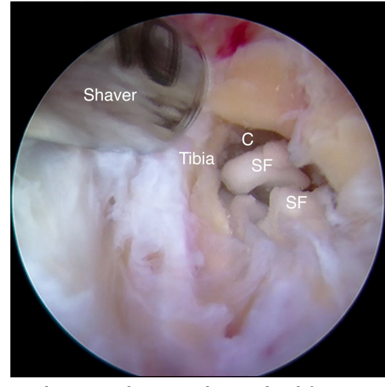
Fig 10. The cyst and contained screw head fragments have been removed, and the canal (C) is examined for loose screw fragments (SF).

US examination is ideal for diagnosing cysts<sup>6</sup> and localizing radiolucent foreign bodies<sup>7</sup> and was used both diagnostically and as a perioperative aid for localizing screw remnants in the present cases. We have found that both the cyst and remaining soft biomaterial parts are easily removed endoscopically by a shaver,