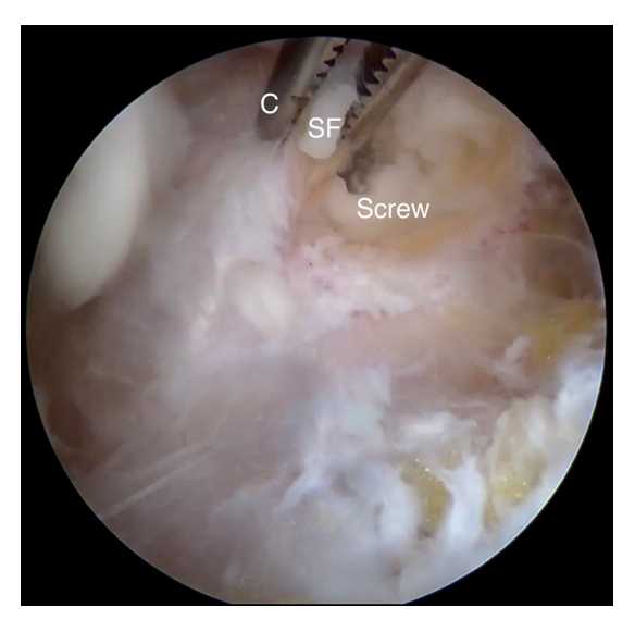
Fig 9. Endoscopic image captured within 2 seconds of that in the previous Figure 8. As the Kocher clamp (C) grasps the screw head it bursts (in an explosive manner) into many small screw fragments (SF). The smaller pieces were later removed with a small (3.5 mm) soft-tissue resector.

Bioabsorbable implants, including PLLA-HA interference screws used in ACLR, are oftentimes marketed as being absorbed and replaced by bone tissue within a few years after insertion into bone. However, often this does not happen,<sup>4</sup> and cases of breakage, migration, and cyst formation have been reported.<sup>9</sup> Although generally considered biocompatible, some studies have