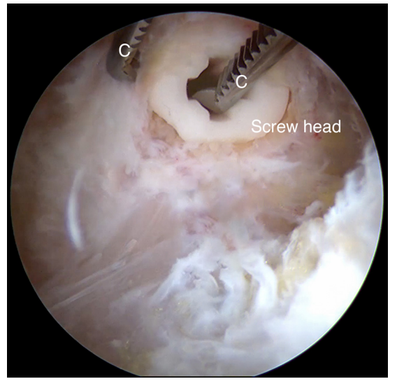
Fig 8. The capsule surrounding the fractured and dislodged screw head of a 9 \times 30 -mm BIOSURE interference screw has been removed by a small tissue resector. A straight Kocher's toothed clamp (C) has been introduced with the intent to remove the loose screw head in one piece. However, the material is brittle and fragile and tends to fracture as seen in the next figure (Fig 9).