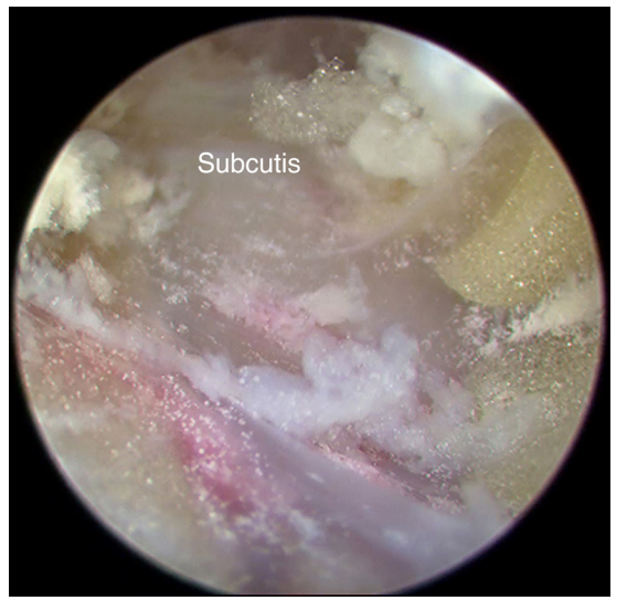
Fig 4. Endoscopic image of the subcutis overlying and surrounding a tibial cyst caused by a partly absorbed interference screw made of poly-L-lactic acid and hydroxyapatite. Myriads of small, whiteish powder-like particles of the partly absorbed interference screw are seen in the soft tissue.

The softness and fragility of the material of the partly absorbed interference screw make it easy to remove the loose pieces with an aggressive soft-tissue resector. When the cyst and contained screw fragment have been removed, the canal should be examined for loose screw fragments (Fig 10). Loose fragments within the canal are removed by the soft tissue resector placed into the canal (Fig 11). Be prepared to move the resector out of the canal to get a visualization of the effect every few