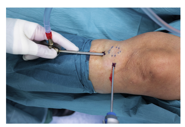
Fig 3. Perioperative image of the left knee of a patient about to undergo an endoscopic removal of a tibial cyst and the contained resorbable screw remnants. The localization of the broken head and the surrounding cyst has been determined by ultrasound examination. The cyst has been marked on the skin by a waterproof marker (dotted line circle). The broken screw head is situated in the center of the marked circle. The arthroscope cannula enters the cyst area from a small incision 2-3 centimetres below the screw head. The 3.5-mm soft-tissue resector enters the same area from an incision 2-3 cm laterally to the screw head.