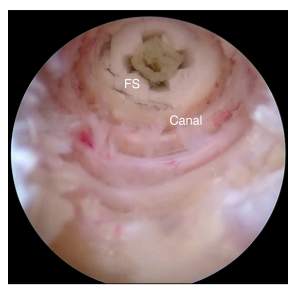
Fig 12. Endoscopic image into the canal after most fractured and partly absorbed screw material has been removed with the shaver. The remaining part of the screw seen in the end of the canal is fractured (FS) but otherwise largely intact and stable. The wall of the tunnel is covered with fibrous tissue and probably includes the distal end of the anterior cruciate ligament graft. There is no sign of bony ingrowth.

found chronic inflammation with foreign-body reaction, aseptic cysts and sinuses, and inhibition of bone formation by poly-(lactic acid).<sup>10</sup>