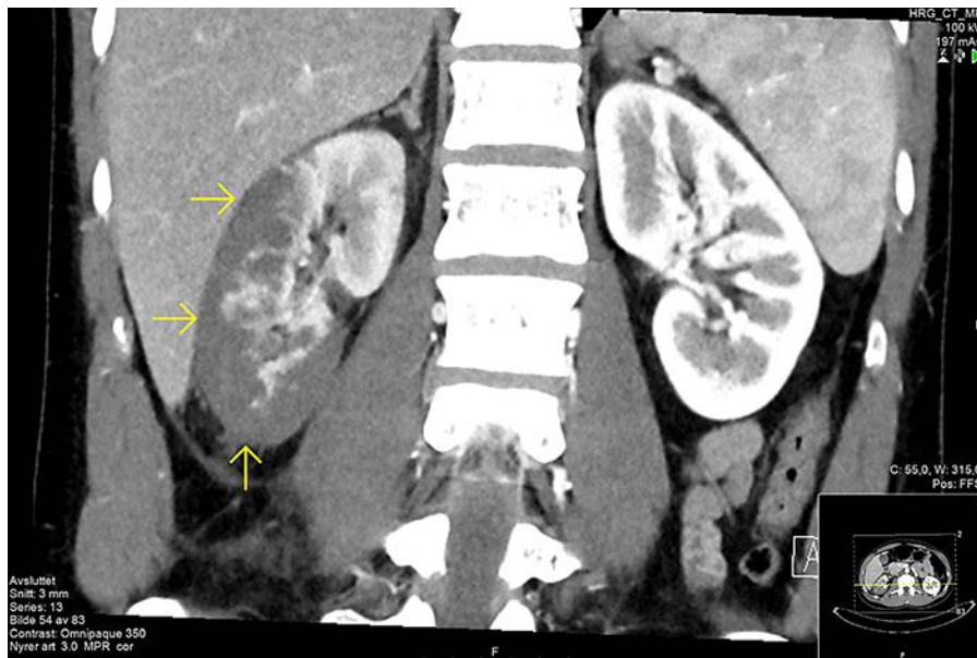
Fig. 1. Lack of contrast enhancement in the peripheral parts of the right kidney and fat stranding in the surrounding tissue could be consistent with severe pyelonephritis or renal infarction.