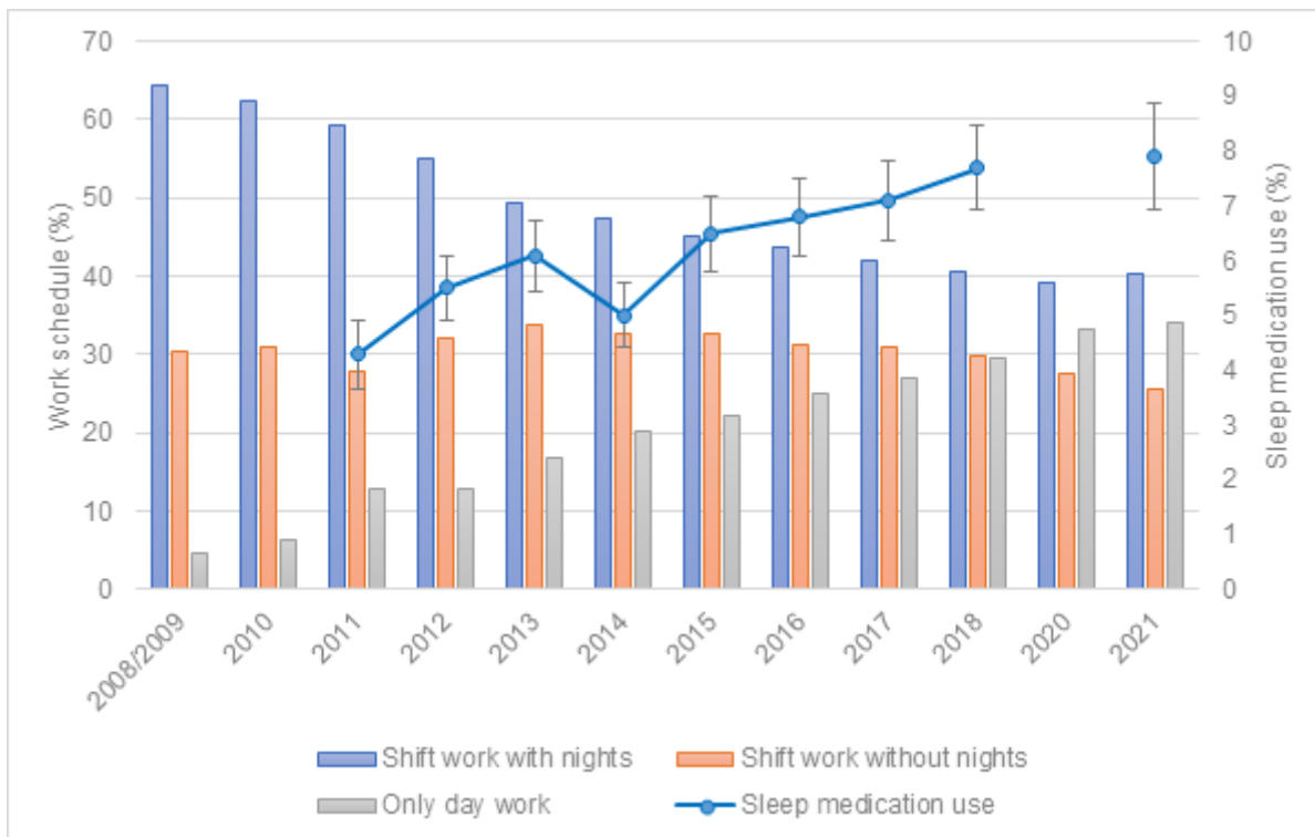
Figure 1 Changes in the proportion of nurses within each work schedule category over time and changes in sleep medication use (with 95% CI) over time in a sample of Norwegian nurses (n=2028). Data from nurses who reported sleep medication use in the 1st wave (2008/2009) were excluded. The 2nd (2010/2011) and 11th wave (2020) did not include questions on sleep medication use (no questionnaire was administered in 2019).

sleep and thereby reduce hypnotic use. For most nurses, night work requires them to stay awake at times when the circadian system promotes sleep and sleep when the circadian system promotes wakefulness. 1 This is typically associated with a reduction in total sleep time and insomnia symptoms such as difficulties falling and maintaining sleep, premature awakenings and non-restorative sleep. In nurses, quitting night work has been found to significantly reduce the risk of shift work disorder (a circadian rhythm sleep disorder characterised by excessive