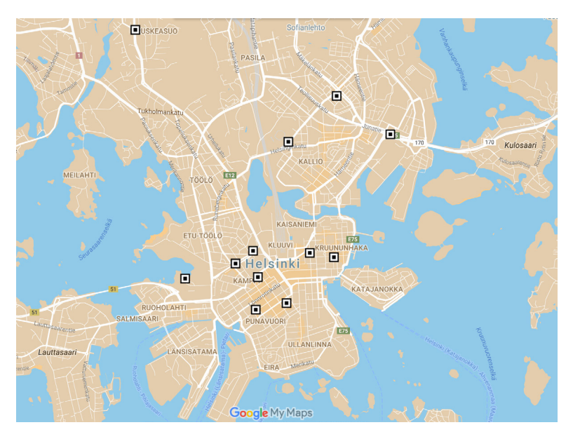
Figure 4. The distribution of queercaches in downtown Helsinki. Map: Visa Immonen.

selectively. The caches were not placed in accordance with the distance rule (0.1 miles apart), nor were the coordinates announced on the established websites of the hobbyists. The polished visual appearance of the caches, and the fact that the cache texts were published separately were also a departure from common geocaching practice.