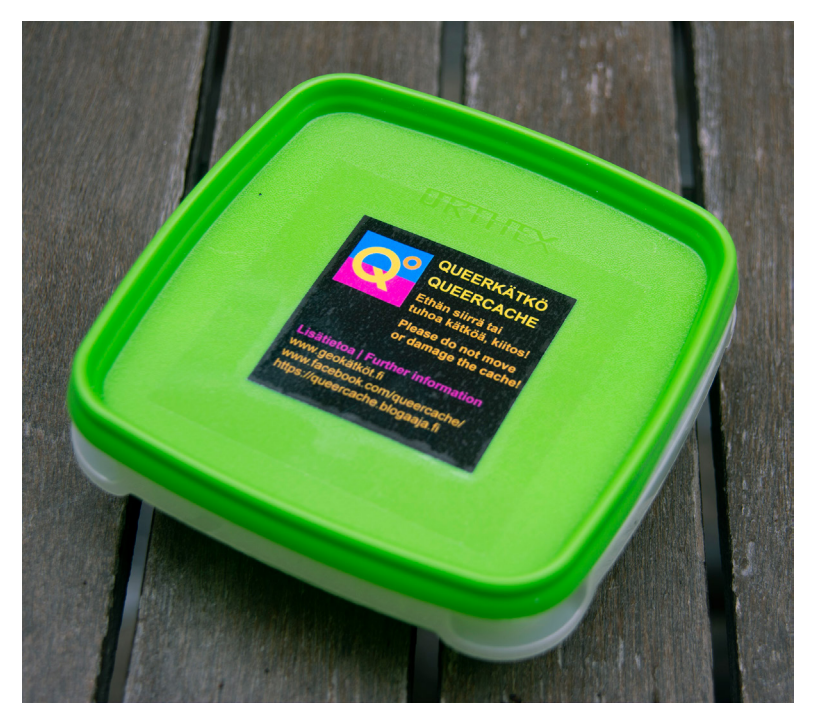
Figure 3. A plastic Queercache container.

the story of the cache. The texts of the work were in Arabic, English, Finnish and Swedish. There were also two laminated pieces of paper in each cache. One with a picture related to the topic of the cache and the other with a web address and QR code which led the reader to more information. Finally, the box contained a small quartz stone wrapped in translucent nylon pantyhose.