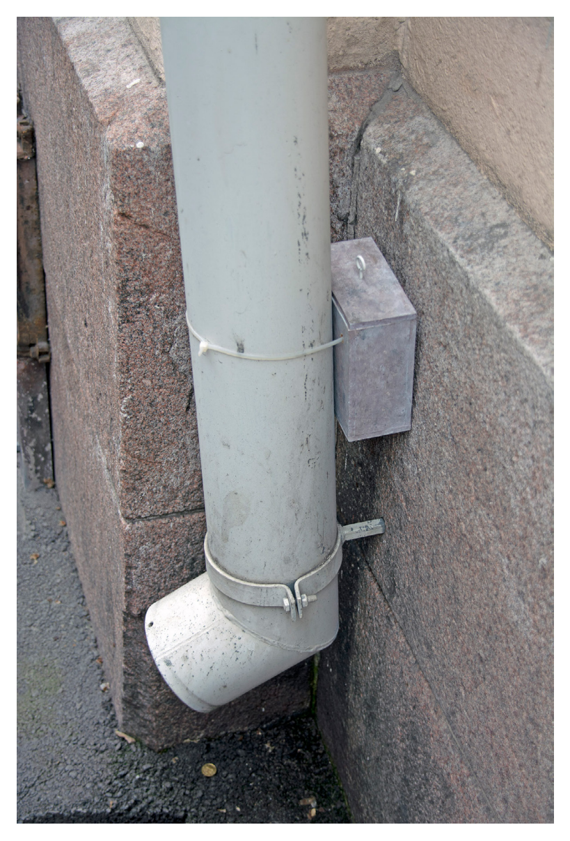
Figure 2. Queercache's wooden box hidden behind a downspout.