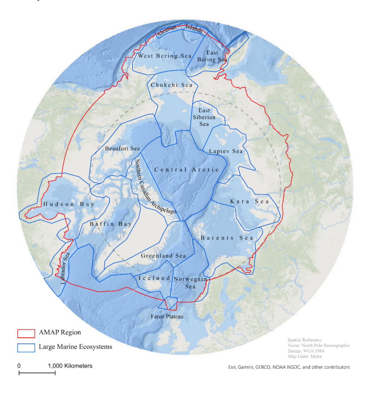
Fig. 1. The Arctic Monitoring and Assessment Programme (AMAP) region and the 18 large marine ecosystems (LMEs) it includes. AMAP comprises eight member states: Canada, Denmark, Greenland, Faroe Islands, Finland, Iceland, Norway, Russian Federation, Sweden, and United States; and six permanent participants: Arctic Athabaskan Council, Aleut International Association, Gwich'in Council International, Inuit Circumpolar Council, Russian Arctic Indigenous Peoples of the North, and Saami Council. Map constructed in ArcGIS Pro with Shapefiles from AMAP (Steenhuisen and Wilson 2013) and PAME (Protection of the Arctic Marine Environment Working Group (PAME) 2013a, 2013b). Map Projection: WGS 1984 Web Mercator (auxiliary sphere). Coordinate system: WGS 1984.

marine snow (e.g., Long et al. 2017; Porter et al. 2018) or ice algae. Given the susceptibility for sediment in calm areas to accumulate and sequester microplastics, and the potentially weak upward transport of already buried plastics (≥100 µm) (Brandon et al. 2019; Fan et al. 2019; Näkki et al. 2019; Courtene-Jones et al. 2020), these depositional systems represent a temporal record of plastic input to aquatic environments (e.g., Dahl et al. 2021). However, microplastics settled on the seafloor or stranded on shorelines may still be subsequently resuspended and further transported with water currents or redistributed within the sediment column (Enders et al. 2019; Kane et al. 2020; Martin et al. 2022).